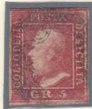
GR. 5 carmine