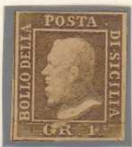
GR. 1 olive brown (Naples paper)