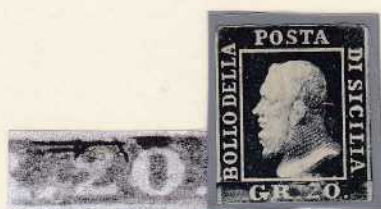
gray slate pos.72

20 Grana : the plate had only 1 retouched stamp