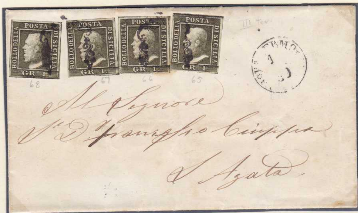
GR. 1 dark olive green (Naples paper), four stamps (pos.68, 67, 66, 65) on double rate letter from Palermo to S. Agata (1860).