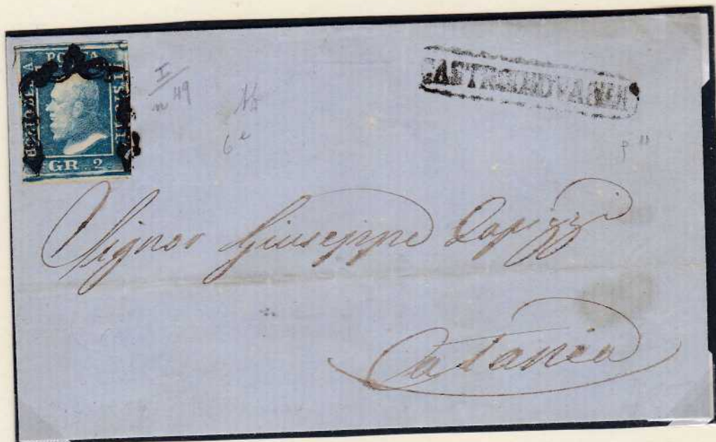
GR. 2 pale blue on first rate letter mailed April 6, 1859 from CASTROGIOVANNI (Enna today) to Catania.