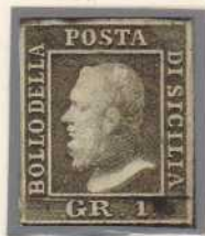
GR. 1 dark olive green (Naples paper)