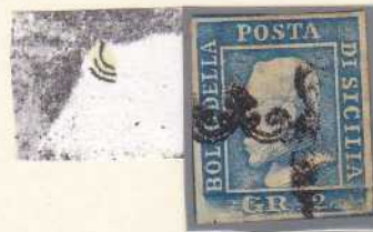
2 gr. blue (Palermo paper) (pos.71)