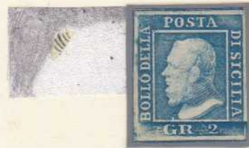
2 gr. light blue (Palermo paper) (pos.82)