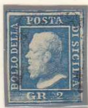
GR. 2 blue (Palermo paper)