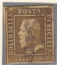
GR. 1 olive brown (Naples paper)