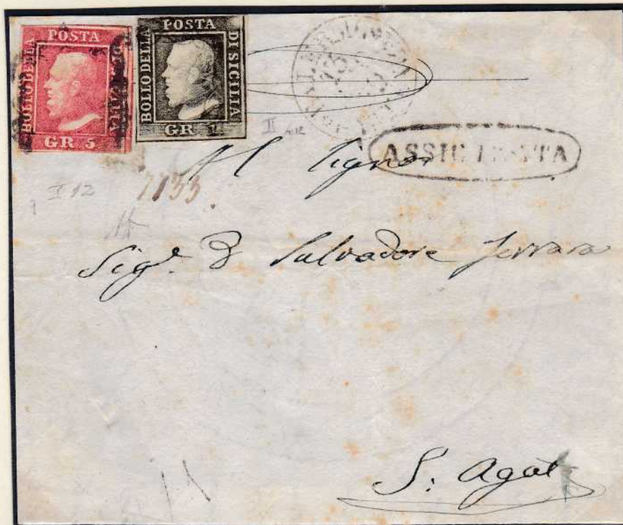
GR. 1 greyish olive with GR. 5 pink carmine (plate I) on front of a registered letter of a sheet and a half from Palermo (June 13, 1859) to S. Agata.