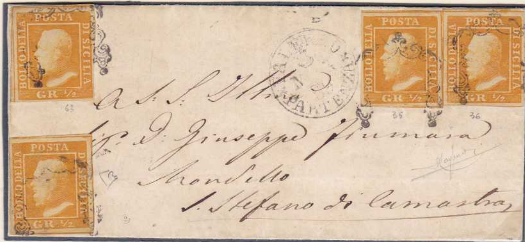
GR. ½ orange (Naples paper), 4 stamps on first rate letter to Santo Stefano di Camastra of 1859, March 3.