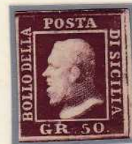
Gr.50 brown lacquer