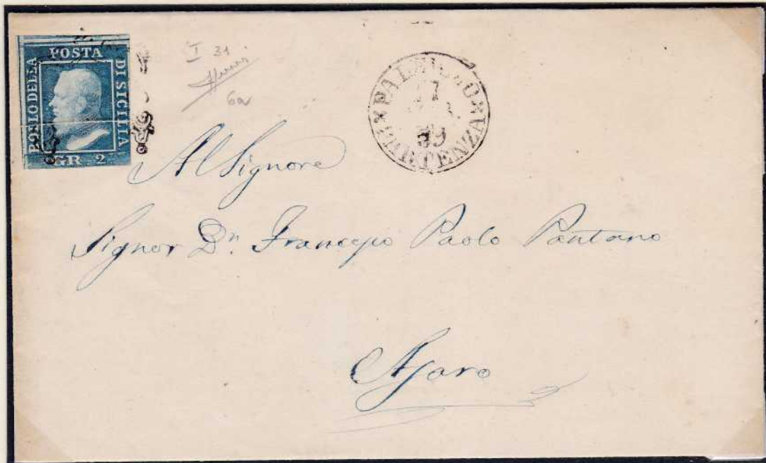
2 grana blue, plate I (Naples paper), on first rate letter from Palermo (February 11, 1859 to Assoro).