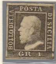
GR. 1 olive green (Naples paper)