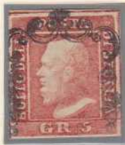
GR. 5 pink vermillion