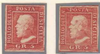
GR. 5 vermilion (different nuances)