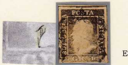
brown rust pos.18 (first state)

1 Grano plate I : the plate had 22 retouched stamps. Four of the 22 were retouched again in the second state