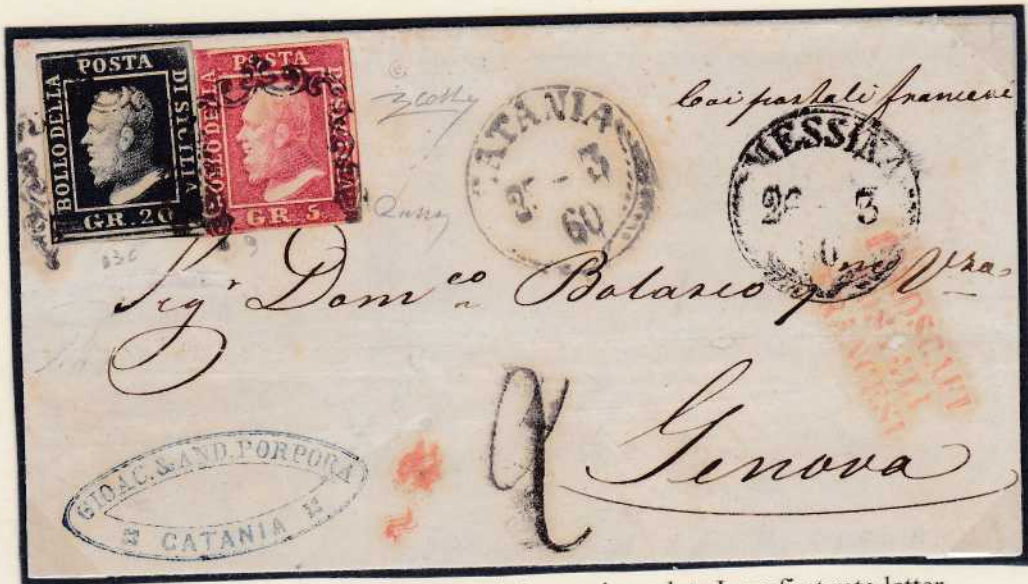
GR. 20 dark slate plus 5 grana pink carmine, plate I, on first rate letter from Catania (March 25, 1860) to Genova with the French ships. To the rate (22 grana) 3 grana were added to transport the letter until Messina.