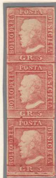
GR. 5 light vermilion Vertical strip of three (pos.73, 83, 93)