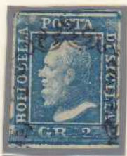
GR. 2 blue (Naples paper)