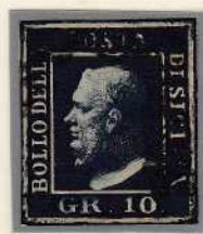
GR. 10 black indigo