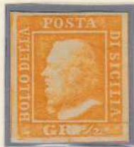
Gr. 1/2 orange , plate I, pos.97 (Palermo paper)

The three stamps with constant color spots