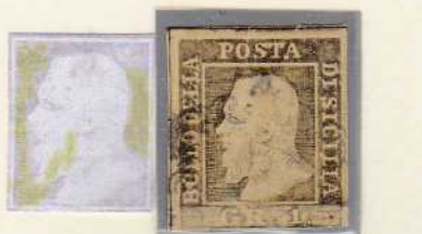
olive green greyish pos.18 (second state)