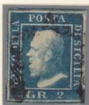
GR. 2 greenish blue (Naples paper)