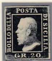
GR. 20 gray slate