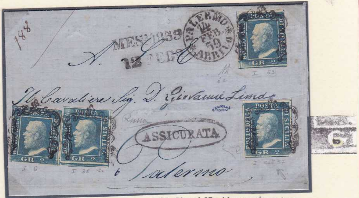
2 grana pale blue, 4 stamps, pos.6, 38, 53 and 57 with retouch, on two sheets registered letter from Messina, 1859, February 12, to Palermo.