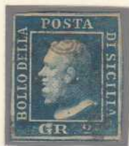
GR. 2 pale blue (Naples paper)