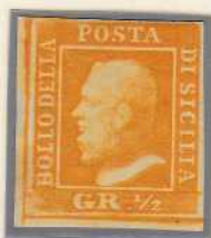
GR. ½ orange (Palermo paper)