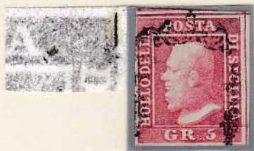
5 Gr. carmine pos.19