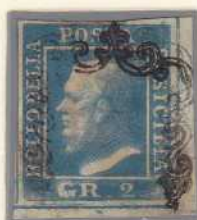
GR. 2 ultramarine blue (Naples paper)