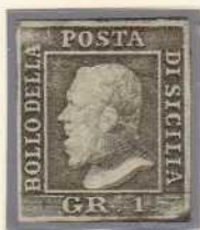
GR. 1 greyish olive green (Palermo paper)