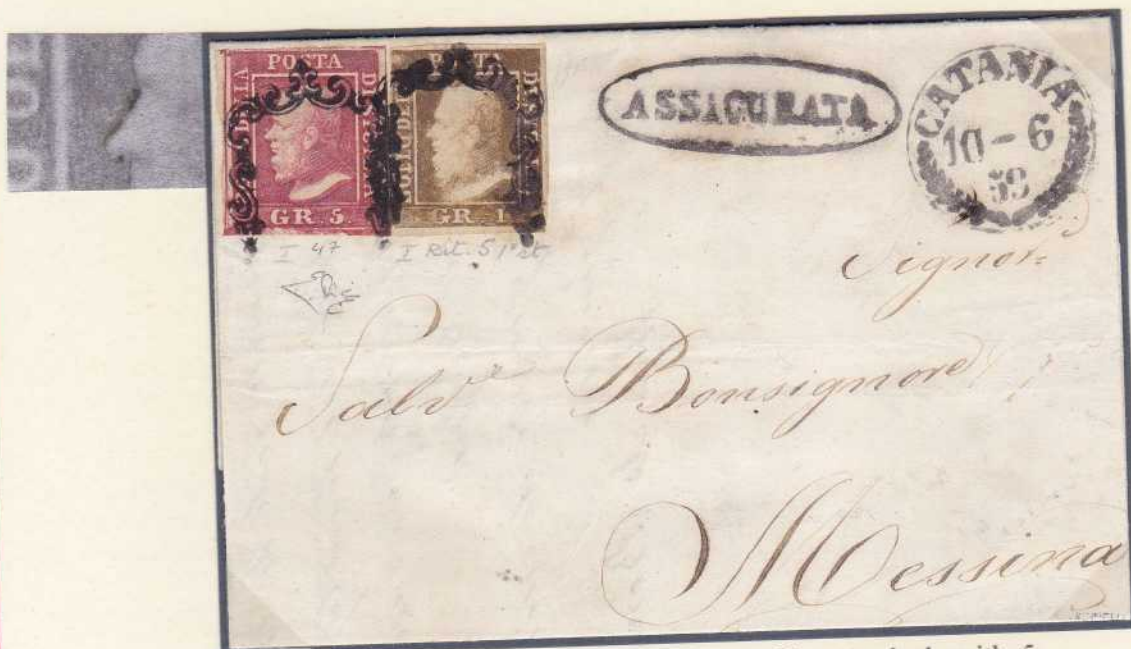
1 grano (first state) rust brown, pos. 51 retouched, with 5 grana pink carmine (plate I) pos.47 on registered letter of a sheet and a half from Catania (June 10, 1859) to Messina.