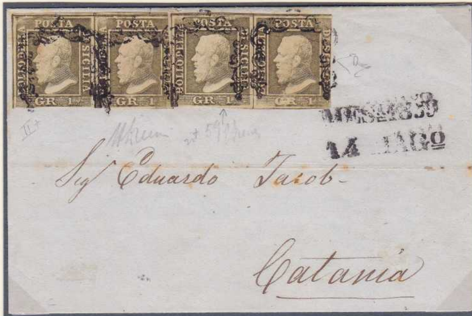
GR. 1 greyish olive (Naples paper), two pairs on second rate letter from Messina (May 14, 1859) to Catania. The first of the second pair is a retouched stamp (pos.59).