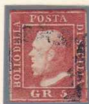
GR. 5 vermilion (different nuances)