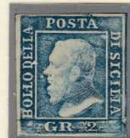
GR. 2 light blue (Palermo paper)