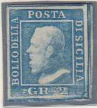
2 gr. blue (Palermo Paper), pos.45

2 Grana plate II: the plate had 6 retouched stamps