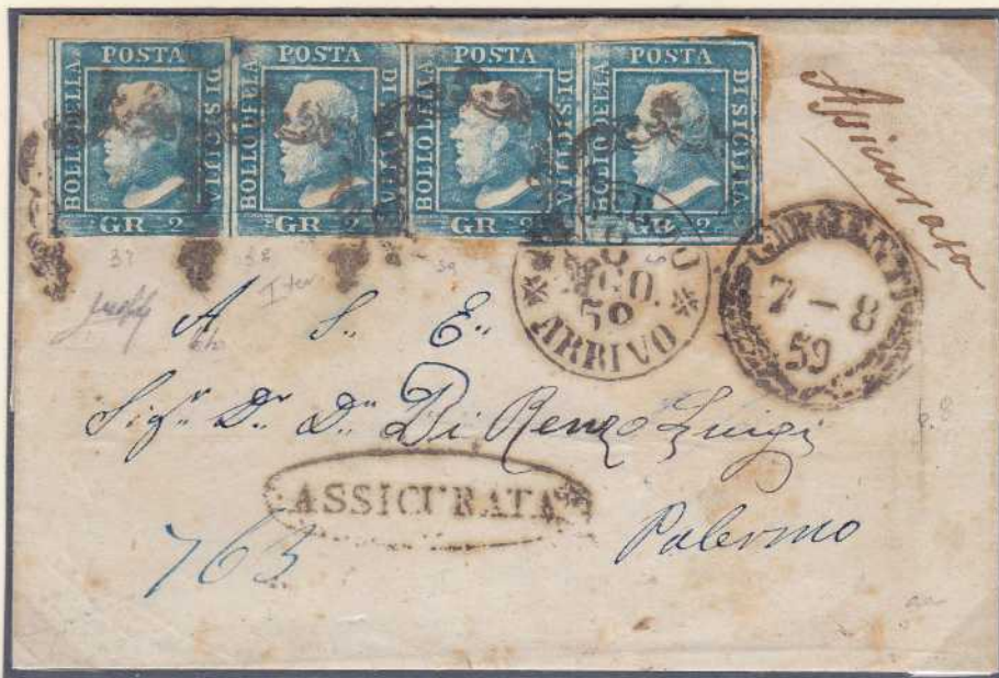
GR. 2 light blue (Naples paper), strip of four stamps (pos.37/40) on two sheets registered letter from GIRGENTI (Agrigento today) August 7, 1859 to Palermo.