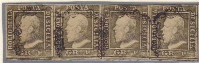
GR. greyish olive (Naples paper), fragment with strip of 4: pos.31, 32 (double engraving), 33, 34