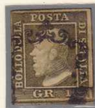
GR.1 dark olive green (Palermo paper)