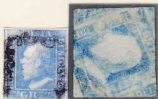
Gr. 2 blue, plate I, pos. 74, light blue back (Naples paper)

They are really rare stamps with recto-verso print. Occasionally there are also stamps with part of the print on the back, probably by contact with other sheets of stamps not yet dry.