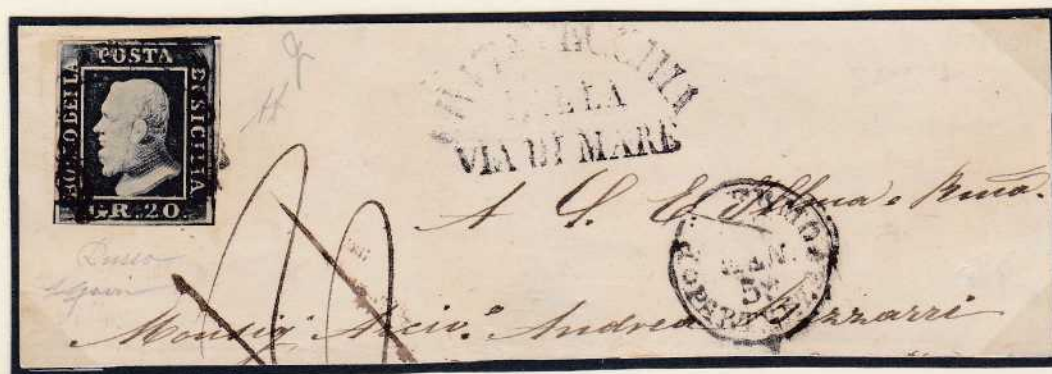
GR. 20 gray slate on part of a two sheets letter from Palermo (January 26, 1859) with the ship "Corriere Siciliano". At the port of Civitavecchia had the postal mark "CIVITAVECCHIA DALLA VIA DI MARE". On arrival in Roma was taxed "32" bajocchi.