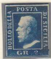
GR. 2 bright blue (Naples paper)