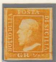
GR. 1/2 orange (Palermo paper)