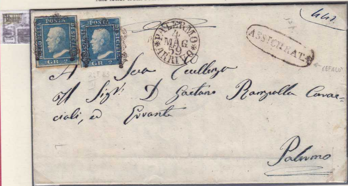
2 grana cobalt blue with 2 grana dark cobalt blue, pos 83 retouched, on registered letter from CEFALU' (May 3, 1859), without the nominative postmark, to Palermo