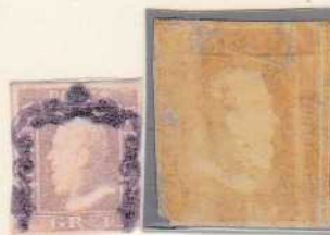
Gr. 1 olive brown, plate II (Naples paper)