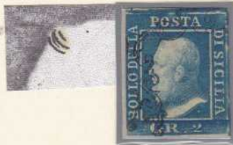
2 gr. bright blue (Naples paper) (pos.81)