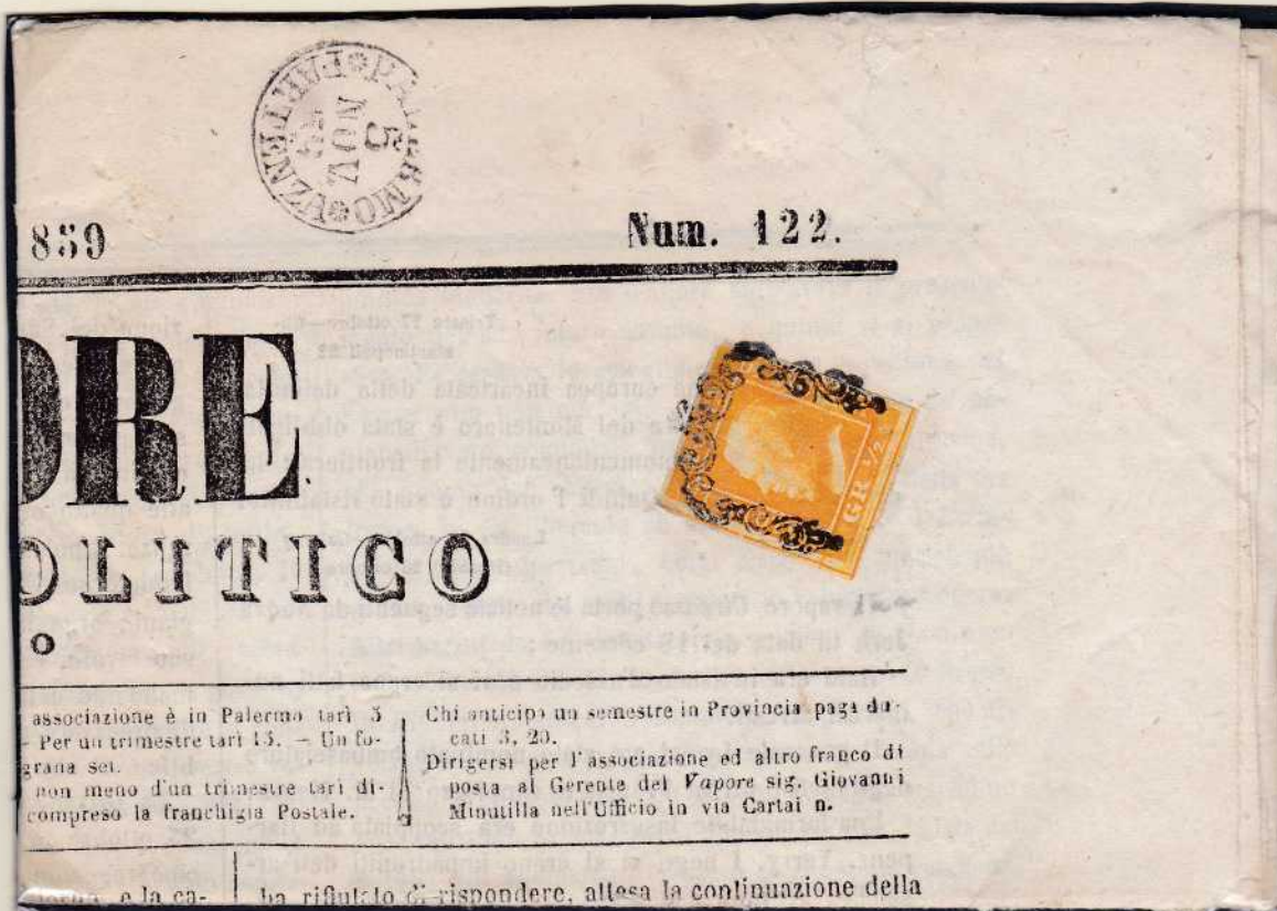
GR. 1/2 yellow light orange (Naples paper) on "IL VAPORE" of November 3, 1859, newspaper first rate.