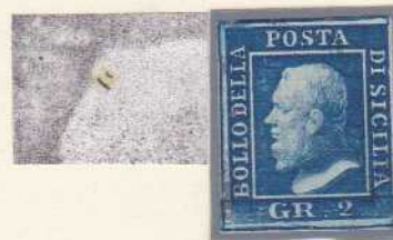
2 gr. bright blue (Naples paper) (pos.94)