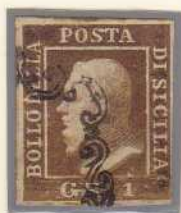
GR. 1 deep rust brown