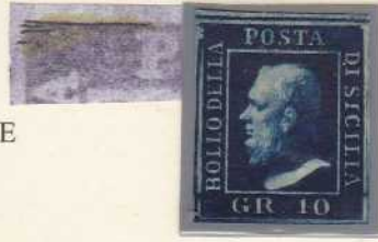
dark blue pos.4