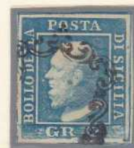
GR. 2 light blue (Naples paper)