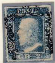
Gr. 2 blue, plate II (Naples paper)