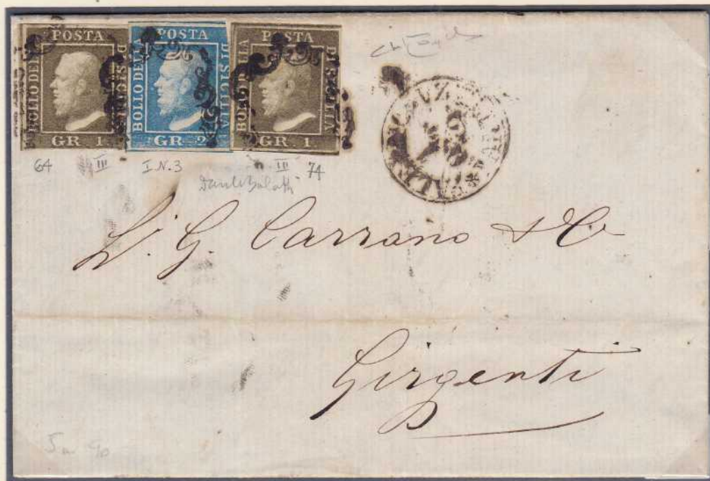
GR. 1 olive green (Naples paper), two stamps with GR.2 light blue (plate I) on double rate letter from Palermo (October 1, 1859) to Girgenti (Agrigento today).