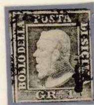
Gr.1 light olive green