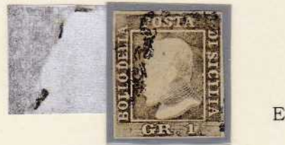
olive green greyish pos.98 (second state)