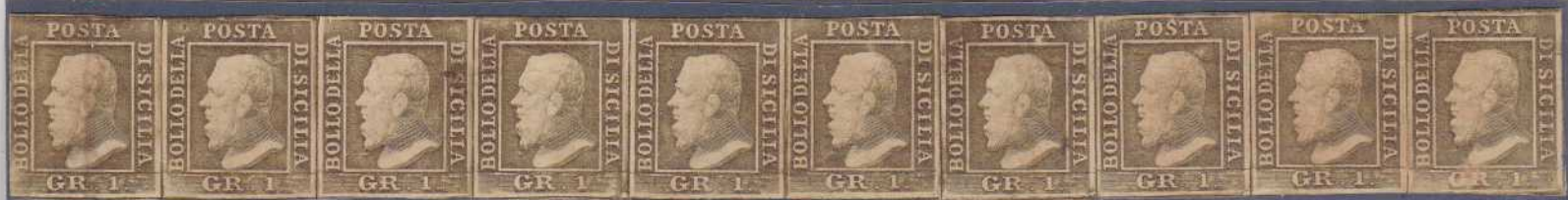
GR. 1 olive brown (Naples paper), strip of 10: pos.51/60, ex Alphonse