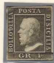
GR.1 dark olive green (Palermo paper)