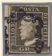
GR. 1 dark olive green (Naples paper)