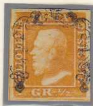
GR. ½ orange (Naples paper)