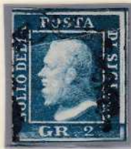
Gr. 2 bright blue, plate III