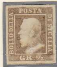
light olive bistre