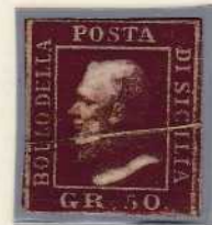
Gr. 50 brown lacquer