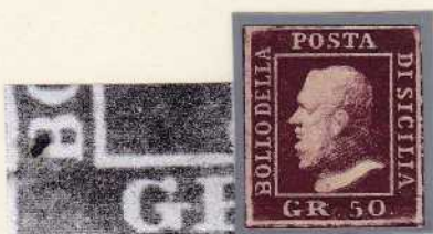
brown lacquer pos.67

50 Grana : the plate had 2 retouched stamps