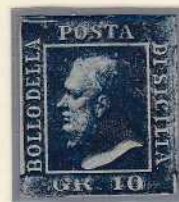
Gr. 10 dark blue