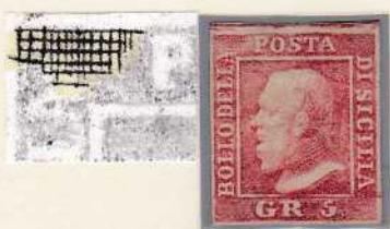
5 Gr. pink carmine pos.5