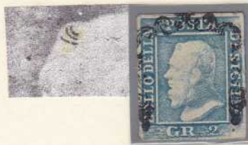
2 gr. light blue (Naples paper) (pos.88)