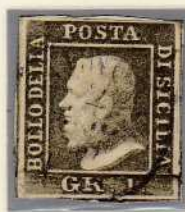
1/2 grano and 1 grano, probably from the same letter, only with the mark "GENOVA 2 MAG 1859"