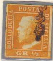
Gr. ½ orange (Naples paper)