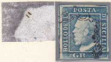
2 gr. light blue (Palermo paper) (pos.84)