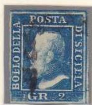
GR. 2 bright blue (Naples paper)