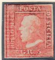
GR. 5 light vermillion, plate I (Palermo paper) Double print on the left