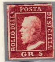
GR. 5 dark carmine