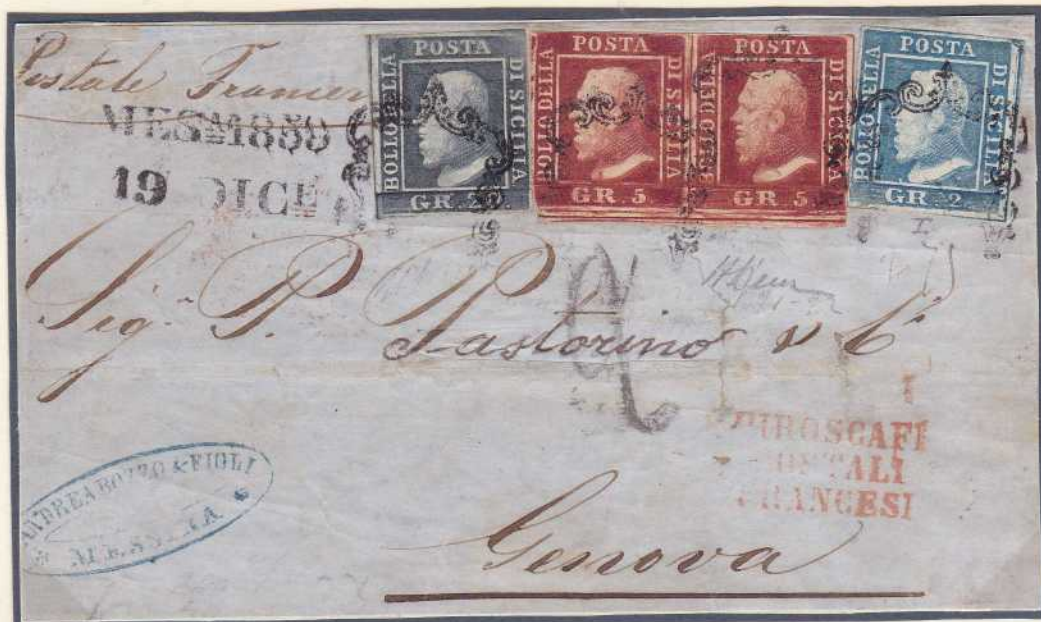
GR.5 dark carmine in pair plus 20 grana slate gray and 2 grana light blue (Palermo paper) plate I on front of a letter of a sheet and a half from Messina (December 19, 1859) to Genova with the French ship "Pausilippe". On arrival the letter had the red mark "PIROSCAFI POSTALI FRANCESI" and was taken "2".