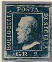
GR. 2 blue (Naples paper)