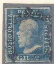
GR. 2 blue (Naples paper)