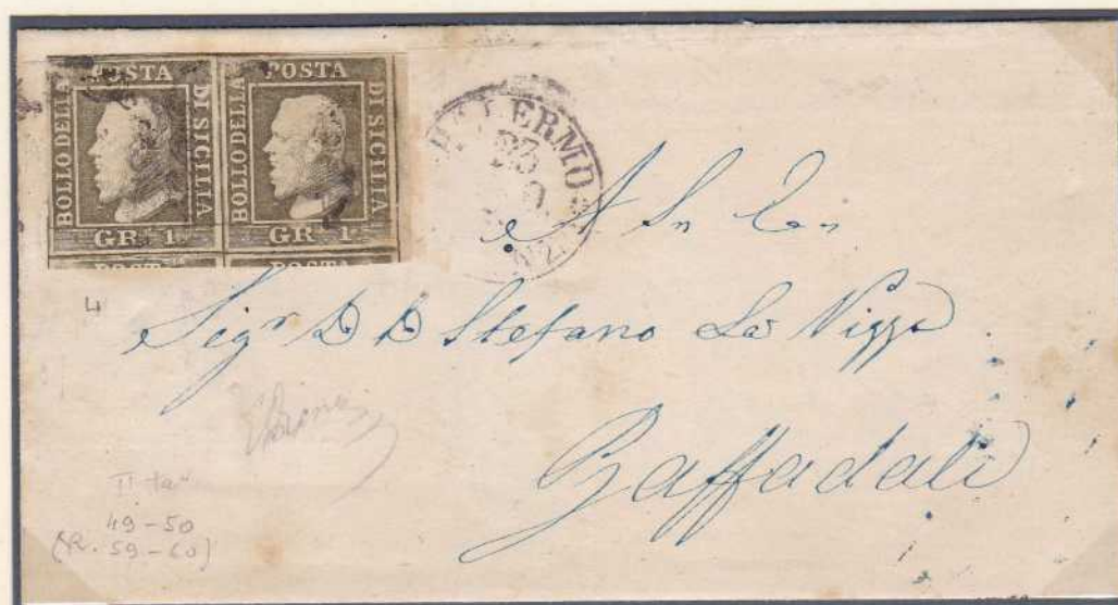
GR. 1 greyish olive green, pair with part of the lower stamps (the first retouched) on first rate letter from Palermo (August 23, 1859) to Raffadali (Agrigento).