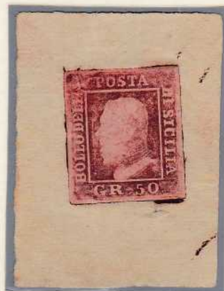
carmine on little sheet