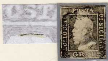
olive pos.84 (Naples paper)

Other retouches of the plates became necessary in later times, as some clichés had deteriorated. So for some positions there is the stamp with and without retouche.