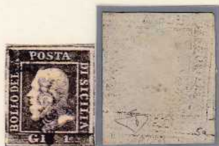
Gr. 1 olive green, plate III (Naples paper)