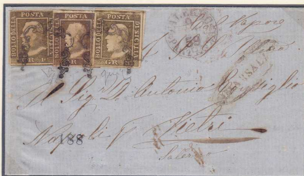
GR. 1 brown rust between two Gr.1 olive brown (second state) on letter of a sheet and a half from MARSALA to Vietri (Salerno), sea route from Palermo (transit mark of Palermo, November 9, 1859) to Naples with the "Corriere Siciliano".