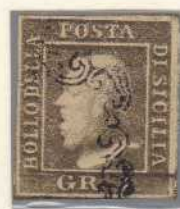
GR.1 olive green (Palermo paper)