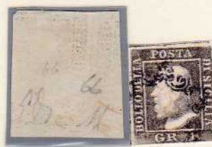
Gr. 1 olive green, plate III (Naples paper)