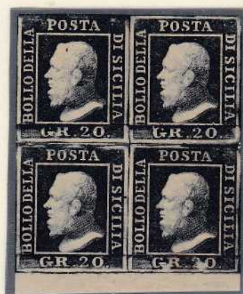
GR. 20 gray slate, block (pos.84/85, 94/95)