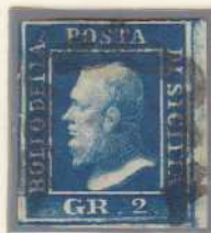
GR. 2 bright blue (Naples paper)