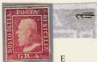
5 Gr. pink carmine pos.9