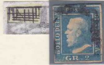
2 gr. cobalt blue, pos.83