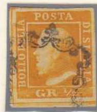
GR. ½ yellow light orange (Naples paper)