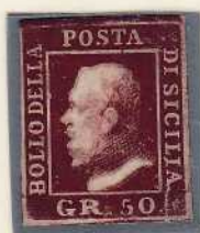
GR. 50 dark purple lacquer (different nuances)