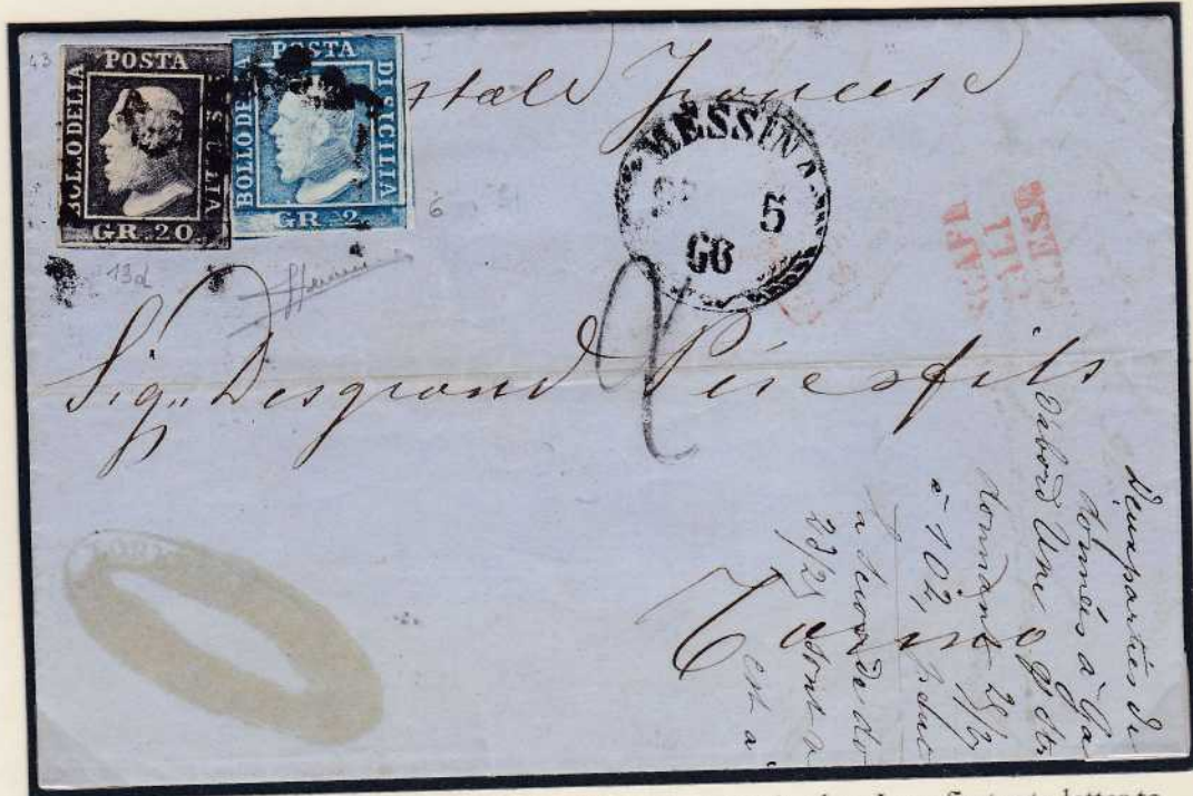
GR. 20 purple slate plus 2 grana blue (Palermo paper), plate I, on first rate letter to Torino, with the French ships until Genova. The letter, written in Reggio (Calabria), left Messina on May 27, 1860, the same day Garibaldi arrived in Palermo.