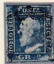
Gr.2 cobalt blue , plate II, pos.48 (Naples paper)