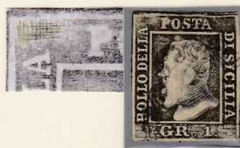
1 gr. olive pos. 62 with retouche