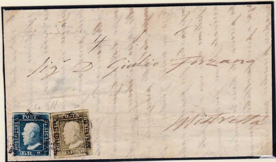
GR. 1 olive green grayish (second state) with 2 grana dark cobalt (plate I) on letter of a sheet and a half from Messina (January 30, 1859, as noted inside). The absence of the starting mark is unusual.