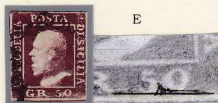
brown lacquer pos.93