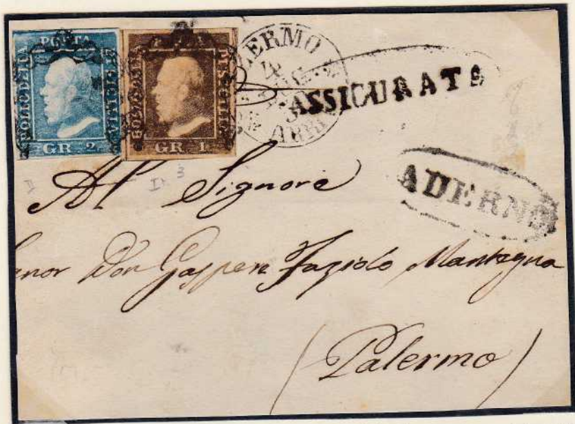
GR. 1 brown rust with 2 grana (plate II) on part of the front of a registered letter from ADERNO'. The correct fee of the whole letter was 4 grana, like first rate registered letter.