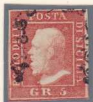
GR. 5 vermilion