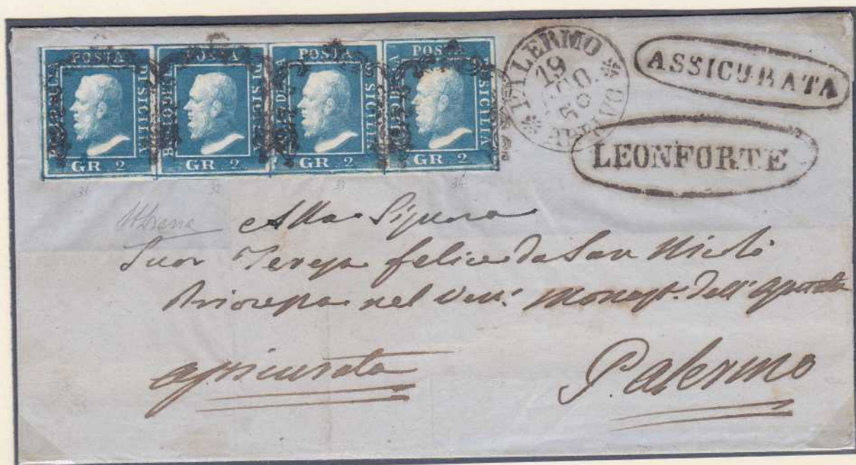
GR. 2 greenish blue (Naples paper), strip of four stamps on two sheets registered letter from LEONFORTE to Palermo (mark "PALERMO ARRIVO 19 AGO 59"). The oval mark "ASSICURATA" was put on arrival in Palermo.