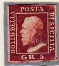
GR. 5 pink brick