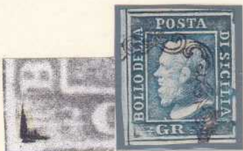
2 gr. blue (Naples paper) (pos.91)