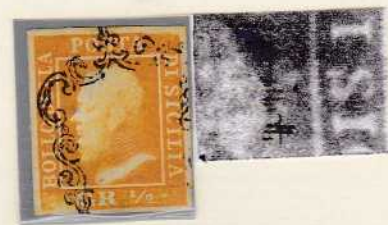
dark orange pos.99