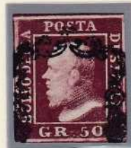
GR. 50 dark purple lacquer