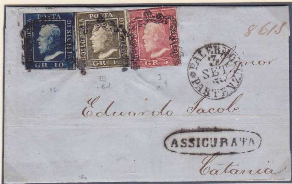
GR. 5 pink carmine with 10 grana dark blue and 1 grano olive green (Palermo paper) plate III on registered letter of an ounce (16 grana) from Palermo (September 3, 1859) to Catania.