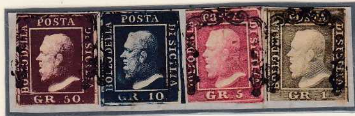
GR. 50 chocolate plus 10 grana indigo, 5 grana pink carmine, plate I, and 1 grano olive brown (Naples paper), plate II, on fragment of 66 grana.