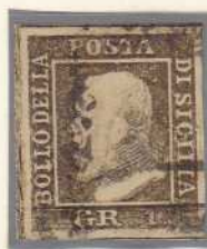
GR. 1 olive brown grayish (second state)