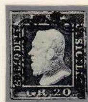
GR. 20 dark slate violet