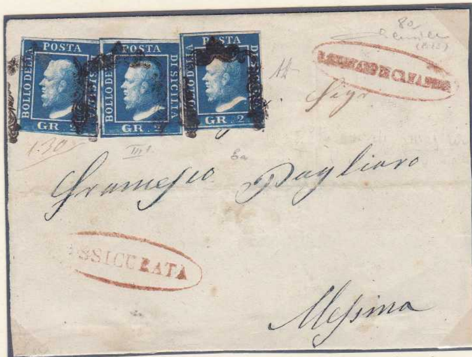
GR. 2 very dark blue (Naples paper), three stamps on registered letter of a sheet and a half from S. STEFANO DI CAMASTRA to Messina, where arrived on July 28, 1859 (like mark on the back).