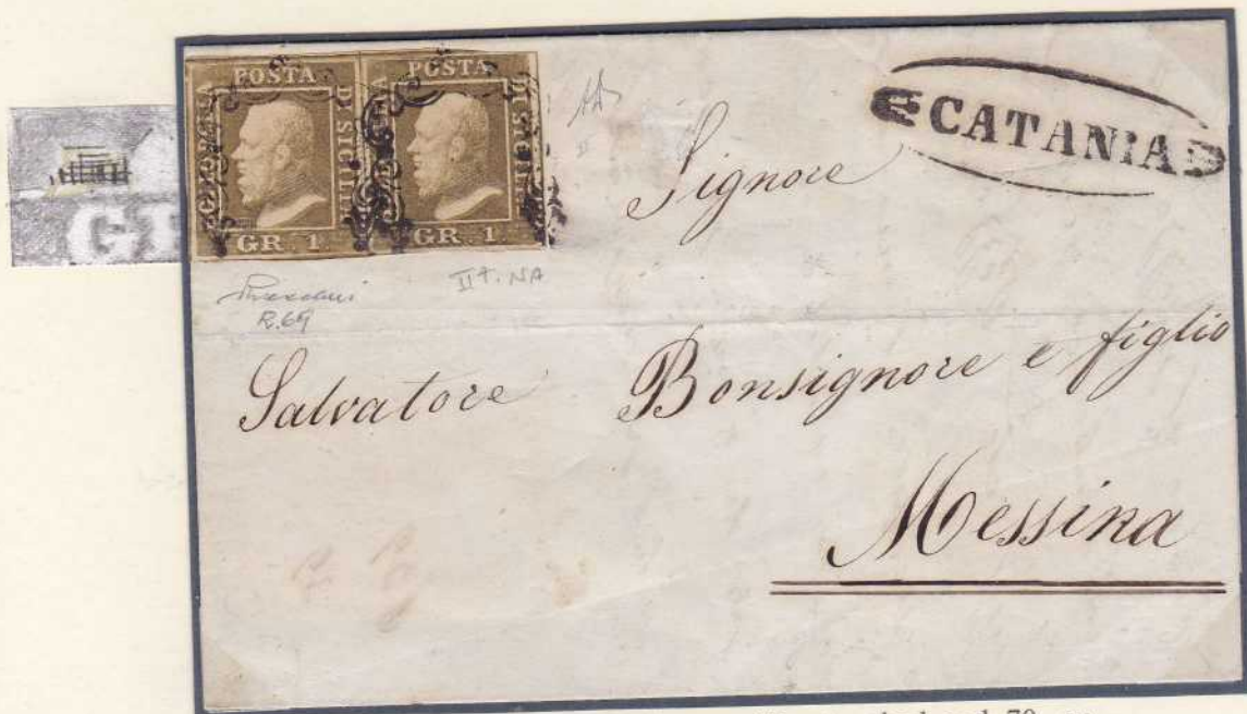
1 grano olive brown, pair, pos. 69 retouched, and 70, on first rate letter from Catania (March 23, 1859) to Messina.