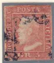
GR. 5 light vermilion