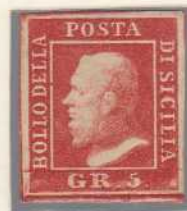
GR. 2 bright vermilion (different nuances)