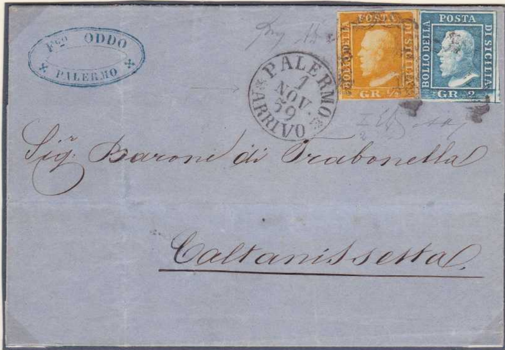
GR. ½ orange (Naples paper) on first rate letter (1859, November 1) to Caltanissetta, added to the 2 grana to pay a receipt included (like described). Anomalous use of the "PALERMO ARRIVO" mark on outgoing letters.