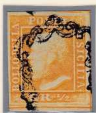
Gr. ½ arancio, plate I (Naples paper)

It's due to insufficient moistening of the paper or to drying of the ink. It's also called "poor print" and changes the appearance of the stamps.