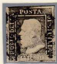
Gr. 1 olive green, plate II (Naples paper)