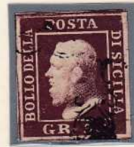
GR. 50 chocolate