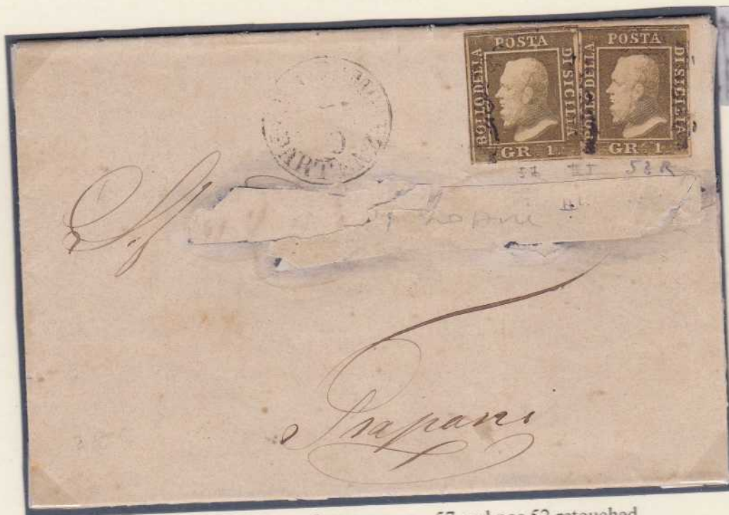
1 grano olive brown, 2 stamps, pos. 57 and pos.52 retouched, on first rate letter from Palermo (August 2, 1859) to Trapani.