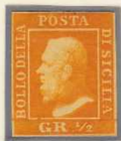
GR. ½ bright orange (Palermo paper)