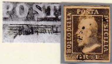
deep rust brown pos.27 (first state)