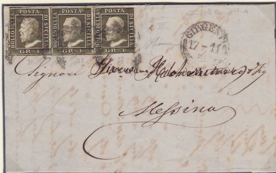
GR. 1 dark olive green (Palermo paper) strip of three (pos.36/38) on letter of a sheet and a half from GIRGENTI (November 17, 1859) to Messina.