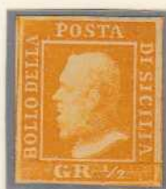
GR. ½ orange (Naples paper)