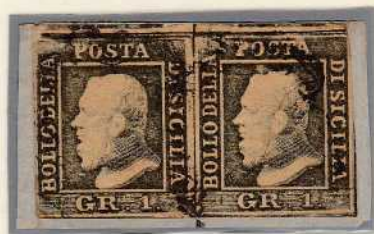
1 gr. dark brown olive, pair pos.61/62, no retouched

Other retouches of the plates became necessary in later times, as some clichés had deteriorated. So for some positions there is the stamp with and without retouche.