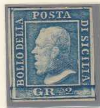
GR. 2 light blue (Palermo paper)