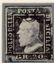
GR. 20 gray slate