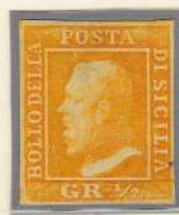
GR. 1/2 yellow light orange (Naples paper)