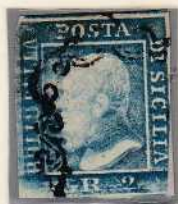
GR. 2 light blue, plate I (Naples paper) Double print on the left