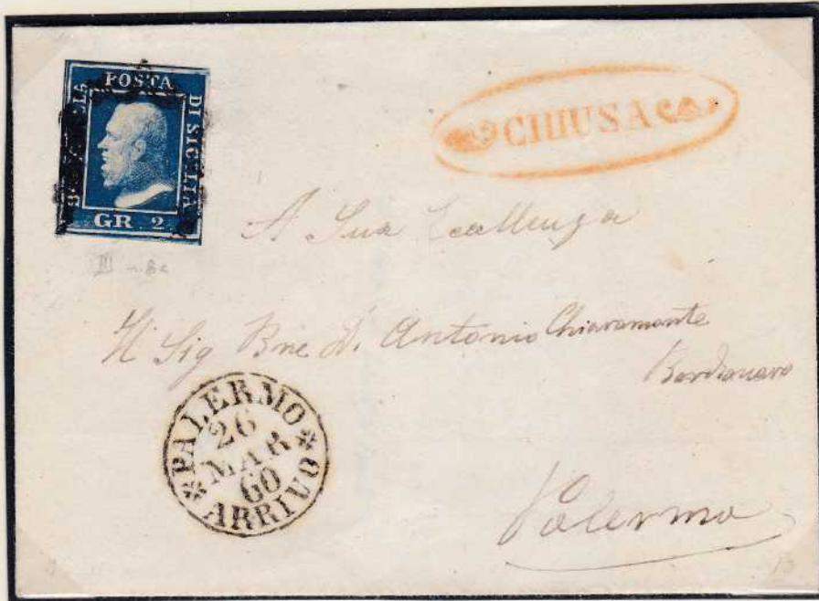
GR. 2 sapphire blue from CHIUSA to Palermo, first rate letter, with the arrival mark of March 26, 1860.