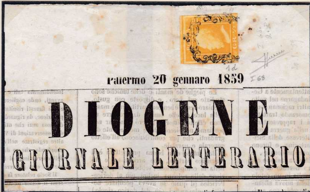
GR. 1/2 light yellow (Naples paper) on "DIOGENE" of January 26, 1859, newspaper first rate.