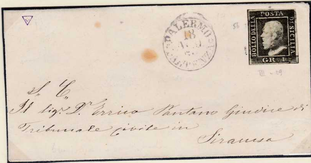
GR. 1 dark olive green (Naples paper), pos.29, on first rate letter from Palermo (August 18, 1859) to Siracusa. The rate of 1 grano was only for first rate letter within the postal district but, strange and rare, the letter was not taxed. In the king's profile there is a small original stain in the forehead.