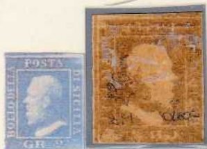
Gr. 2 pale blue, plate I (Naples paper)