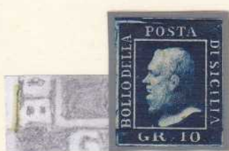
dark blue pos.61