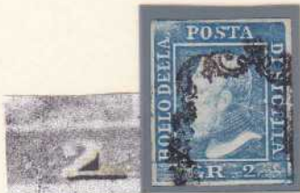
2 gr. light blue (Naples paper) (pos.79)