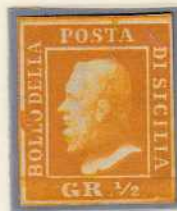
Gr. 1/2 dark orange , plate II, pos.74 (Naples paper)