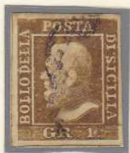
GR. 1 brown rust