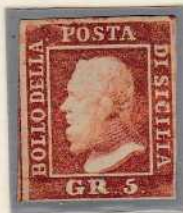
GR. 5 brown red