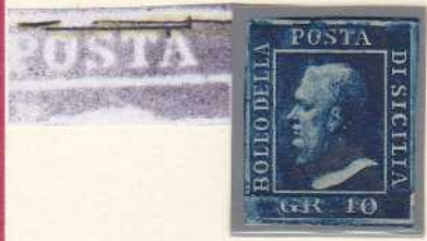
dark blue pos.1

10 Grana : the plate had 12 retouched stamps