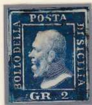
Gr.2 bright blue , plate II, pos.36 (Naples paper)