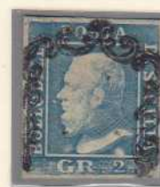
GR. 2 pale blue (Naples paper)