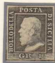
GR.1 greyish olive (Naples paper)