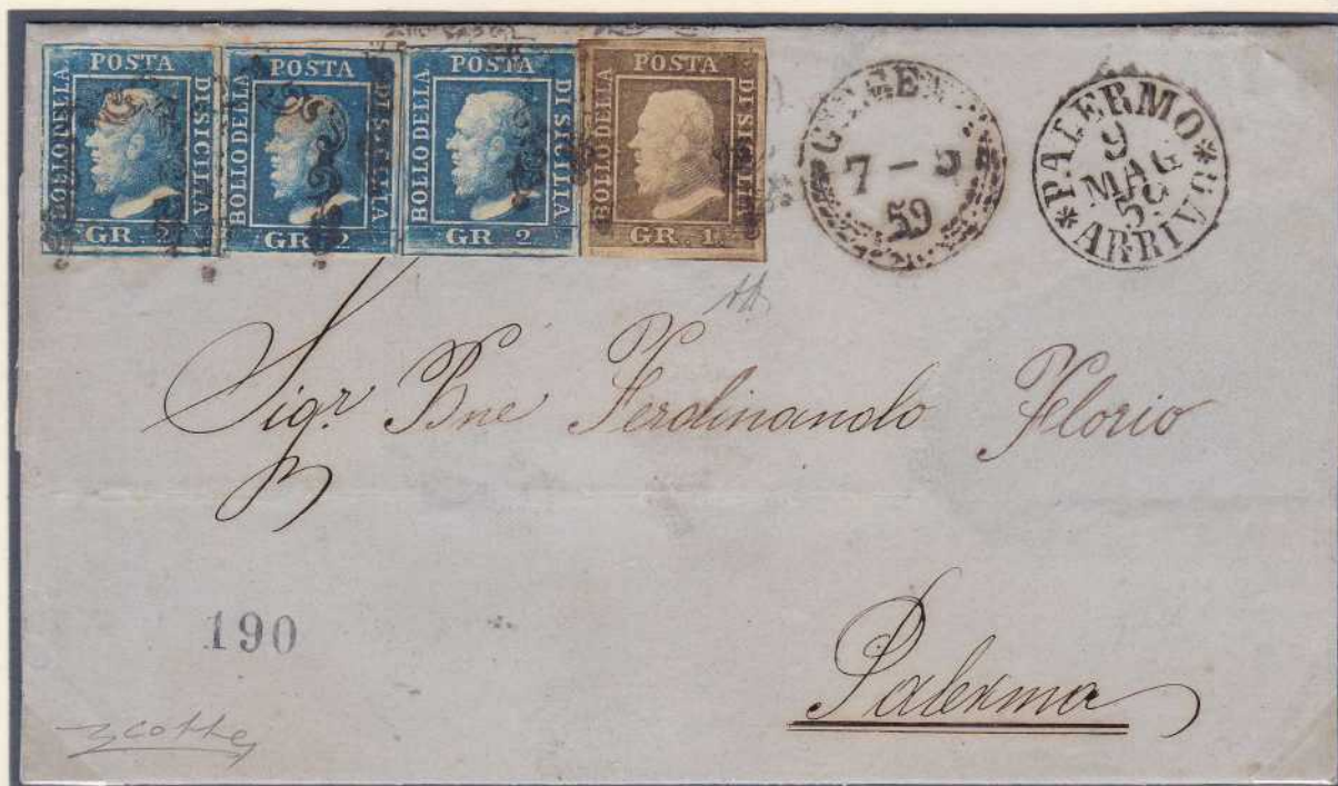
GR. 1 olive brown (second state) with 3 stamps of 2 grana (plate I) bright blue on three rates and half letter from Girgenti (Agrigento) to Palermo.