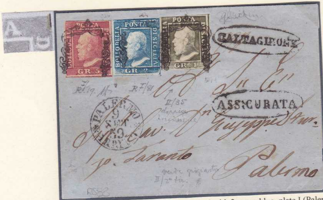
5 grana pink carmine (Naples paper) pos. 19 retouched with 2 grana blue, plate I (Palermo Paper) pos 81 retouched, and 1 grano grayish olive green, plate II (Naples paper), pos.35 double print, on two sheets registered letter from CALTAGIRONE to Palermo (September 9, 1859).