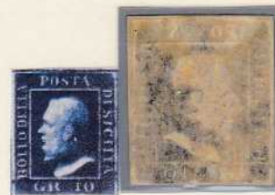
Gr. 10 dark blue