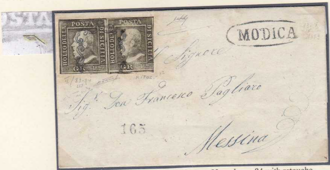
1 grano greyish olive green, pair, pos.83 and pos.84 with retouche, on first rate letter from MODICA (October 13, 1859) to Messina.