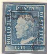
GR. 2 light blue (Palermo paper)