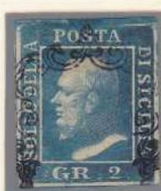
GR. 2 dark cobalt (Naples paper)