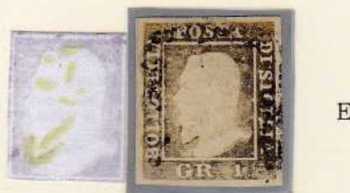
olive brown greyish pos.87 (second state)