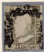
Gr.1 light olive green