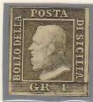
GR. 1 light olive green (Palermo paper)