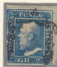
GR. 2 cobalt blue (Naples paper)