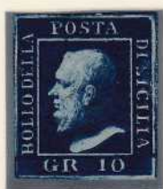
GR. 10 dark blue (different nuances)