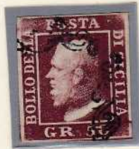
GR. 50 brown lacquer