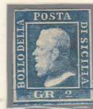
GR. 2 blue (Palermo paper)