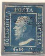
GR. 2 cobalt blue (Naples paper)