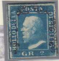
2 gr. dark cobalt blue, pos.71