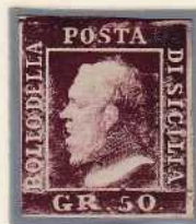
Gr. 50 brown lacquer