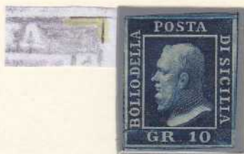
dark blue pos.21