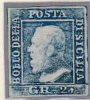
Gr.2 blue , plate I, pos.30 (Palermo paper)