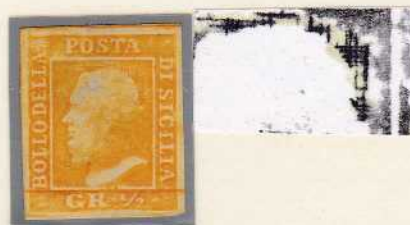
yellow light orange pos.69