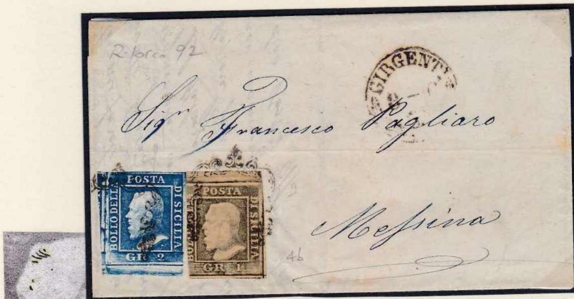
2 grana bright blue, pos.92 with retouch and 1 grano olive brown, plate II, on one sheet and half letter from Girgenti, 1859, June 8, to Messina.