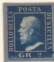
GR. 2 very dark blue (Naples paper)