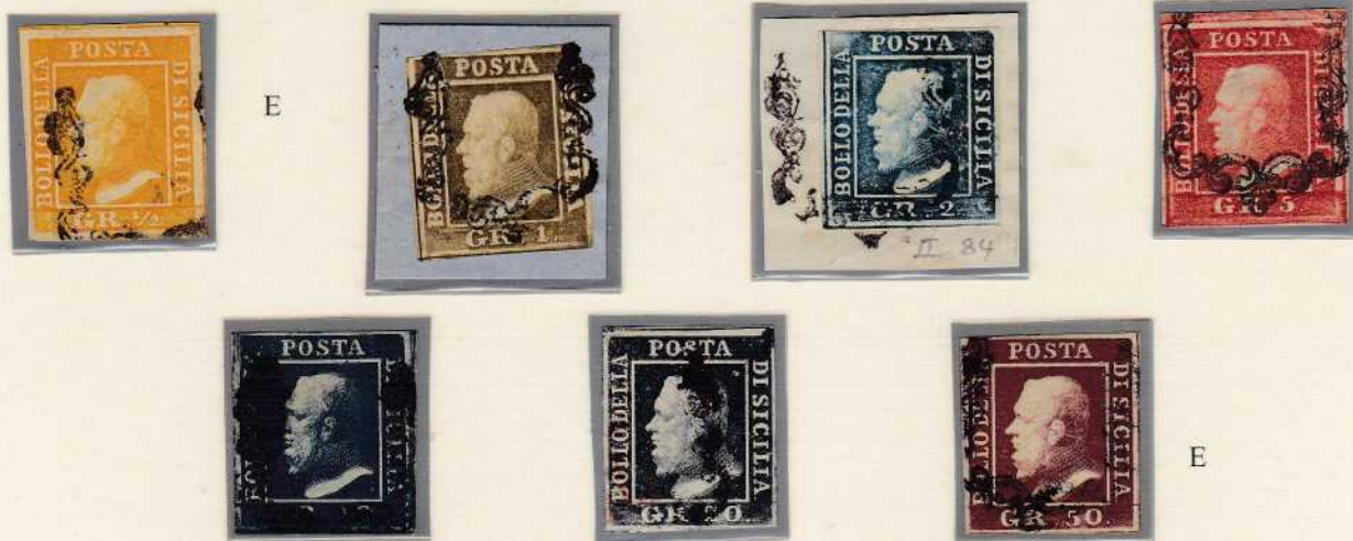
The seven values with the postmark upside down, not to corrupt the sovereign image.