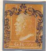
Gr. ½ dark orange (Naples paper)