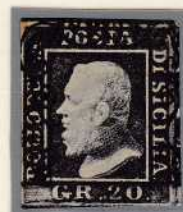
GR. 20 purple slate