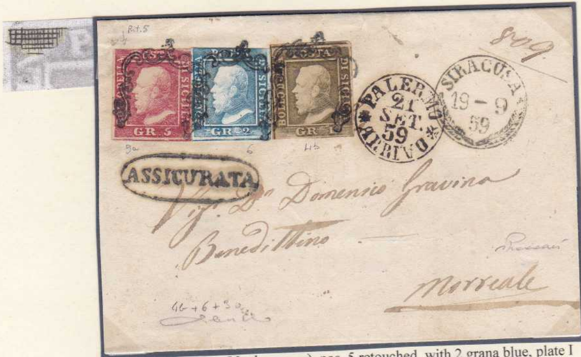
5 grana carmine (Naples paper) pos. 5 retouched with 2 grana blue, plate I (Palermo Paper), and 1 grano olive brown, plate II (Naples paper) on two sheets registered letter from SIRACUSA (September 19, 1859) to Monreale.