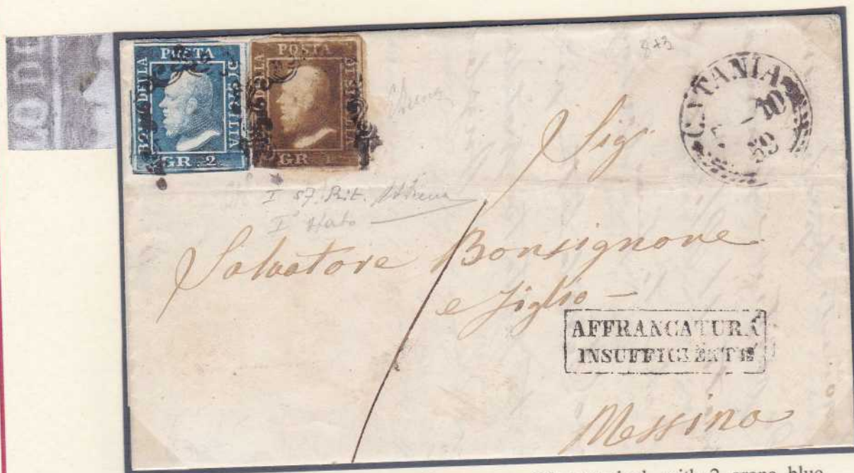
1 grano (first state) deep rust brown, pos. 57 retouched, with 2 grana blue (plate III) on letter from Catania (October 5, 1859) to Messina. Taxed "1", on arrival in Messina had the "AFFRANCATURA INSUFFICIENTE" mark.