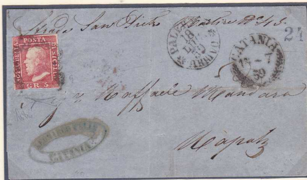
GR. 5 pink carmine on letter of two sheets and a half from CATANIA (July 15, 1859) to NAPOLI. The letter arrived in Palermo (July, 18) and left for Napoli on July 20 with the "Corriere Siciliano" (Florio Company).