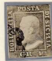
Gr.1 greyish olive green