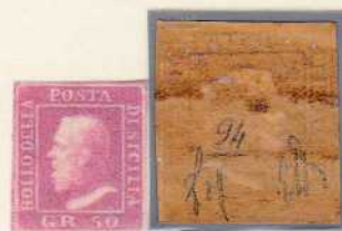
Gr. 50 brown lacquer