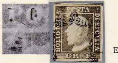
olive brown pos.89 (first state)