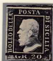
GR. 20 purple slate