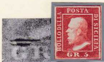
5 Gr. bright vermillion pos.90