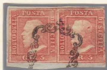
GR. 5 light vermilion, pair