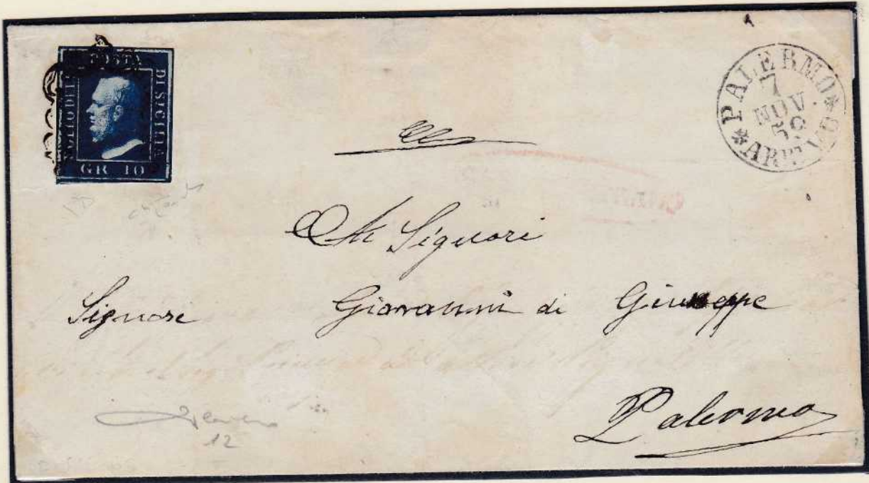
GR. 10 dark blue on letter of one ounce and 1/4, unusual rate, from CASTELVETRANO to Palermo (arrival date November 7, 1859).