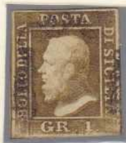
GR.1 light olive brown (Naples paper)