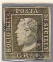
GR. 1 light olive green (Palermo paper)