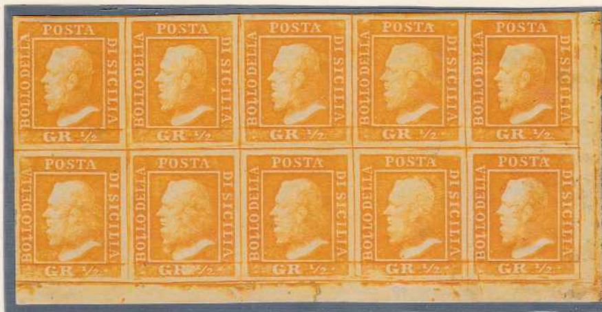
GR. 1/2 orange (Palermo paper) block of 10: pos.86/90, 96/100