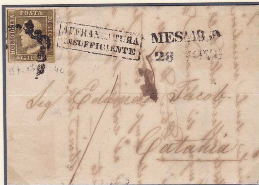
GR. 1 light olive brown (Naples paper) on first rate letter from Messina (November 28, 1859) to Catania. Franked 1 instead of 2 gr., it was taxed and the "AFFRANCATURA INSUFFICIENTE" mark was affixed.