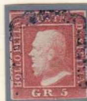
GR. 2 bright vermilion