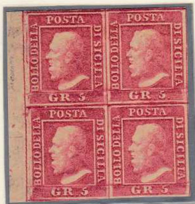
GR. 5 pink carmine, block (pos.21/22,31/32, ex Alphonse)