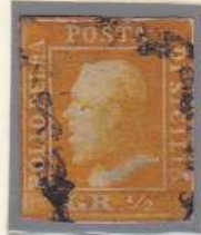
Gr. ½ bright orange (Palermo paper)