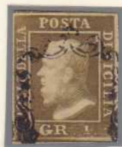
GR. 1 dark brown olive (Naples paper)