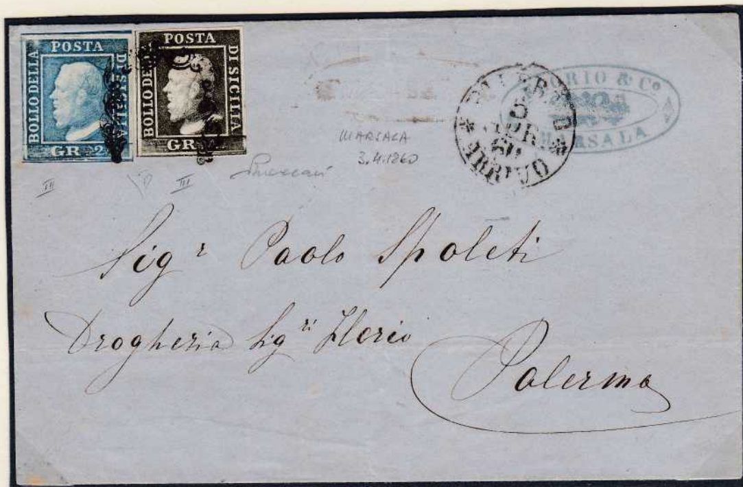
GR. 2 blue with 1 grana, plate III, olive green on letter of a sheet and a half from MARSALA (April 3, 1860) to Palermo. The letter arrived April 5, 1860, second day of the Gancia's Convent insurrectional movements.