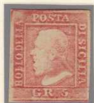
GR. 5 light vermilion