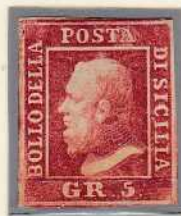
GR. 5 carmine