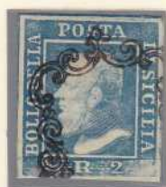
GR. 2 light blue (Palermo paper)