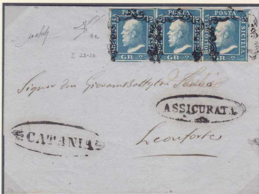
GR.2 pale blue, strip of three (pos.22,23,24), on registered letter of a sheet and a half from CATANIA (oval mark used in the first months of 1859) to Leonforte.