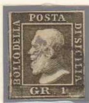
GR. 1 olive green (Naples paper)