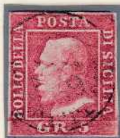
5 grana pink carmine, plate I, with the mark "PALERMO PARTENZA" of April 1859

They are very scarce the used stamps of Sicily without the horse-bit mark.