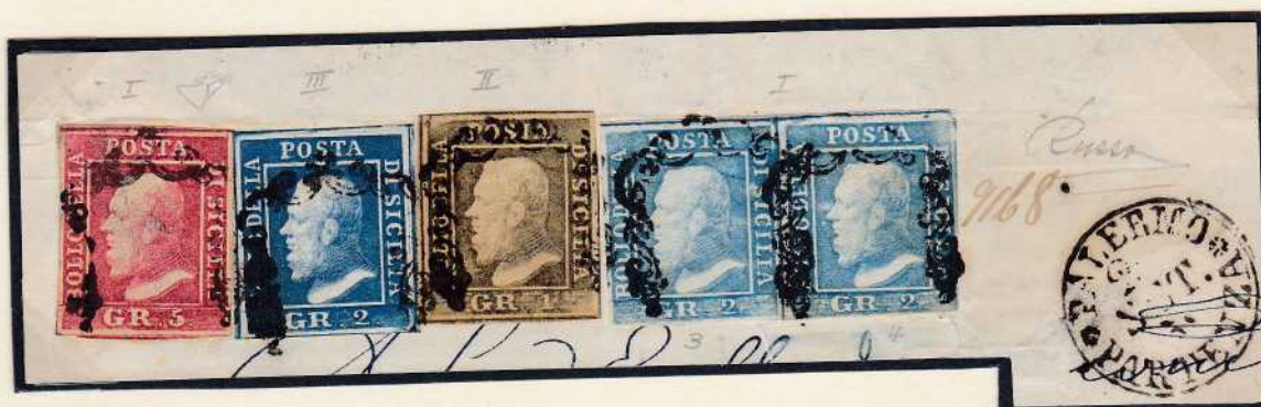
GR.2 light blue (Palermo paper) pair, with 1 grano plate II, olive brown (Naples paper), 2 grana plate III, blue (Palermo paper) and 5 grana plate I, pink carmine, on a partial front of a third rate registered letter (12 grana) from Palermo (September, 1859).