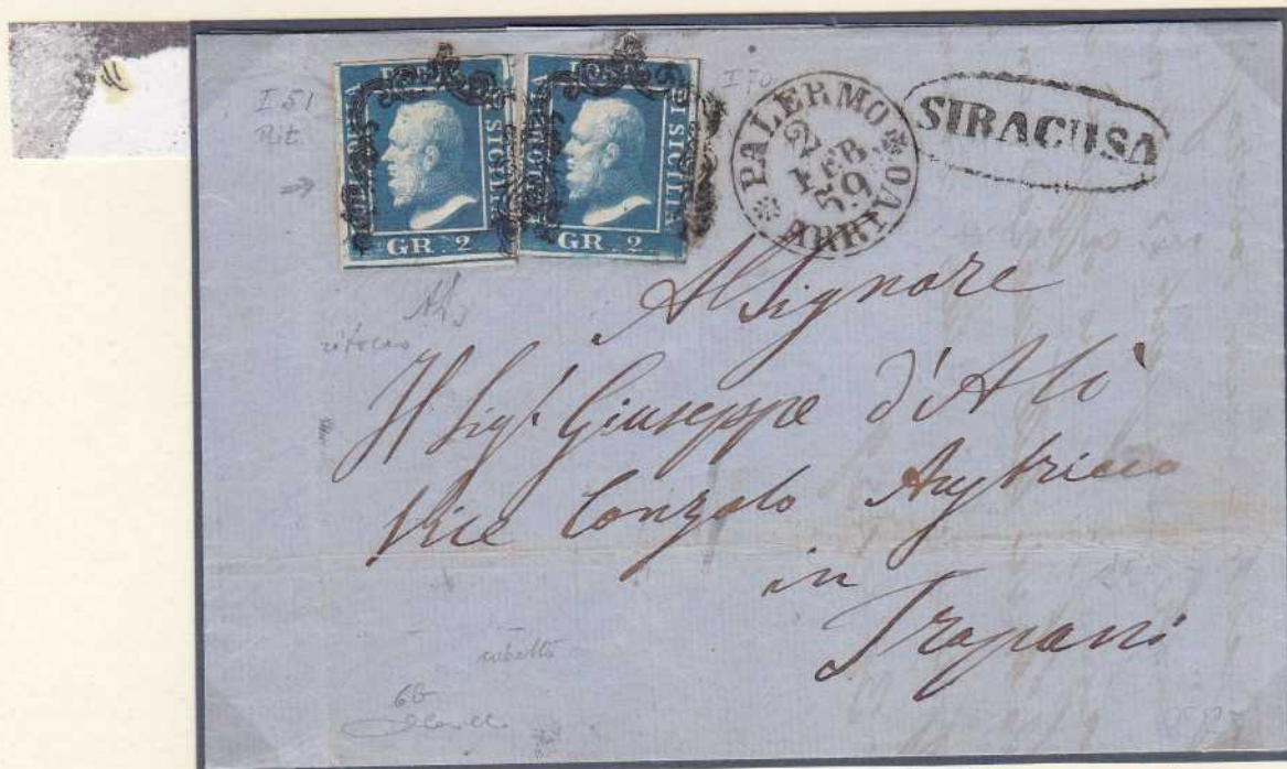
2 grana cobalt blue, plate I, pos.51 retouched and 70) on second rate letter from Siracusa, 1859, January 31, to Trapani via Palermo.