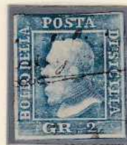
2 grana, bright blue, plate II, with part of the mark "Diritto Pontificio" used in Civitavecchia