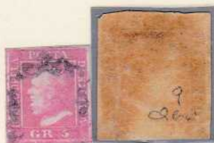
Gr. 5 pink carmine, plate I (Naples paper)