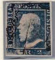
Gr. 2 blue, plate I