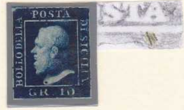
dark blue pos.58