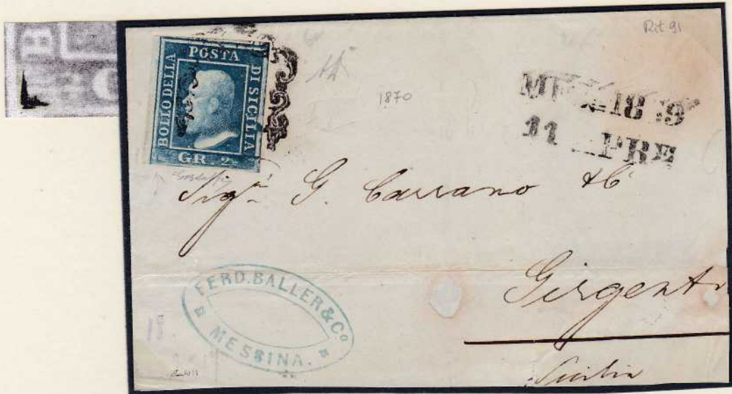
2 grana light blue (Naples paper), pos.91 with retouch, on first rate letter from Messina, 1859, April 11, to Girgenti.