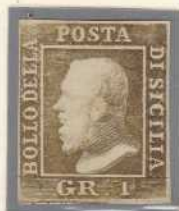
GR.1 light olive brown (Naples paper)