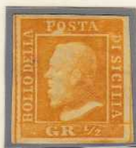
GR. 1/2 brownish yellow (Naples paper)