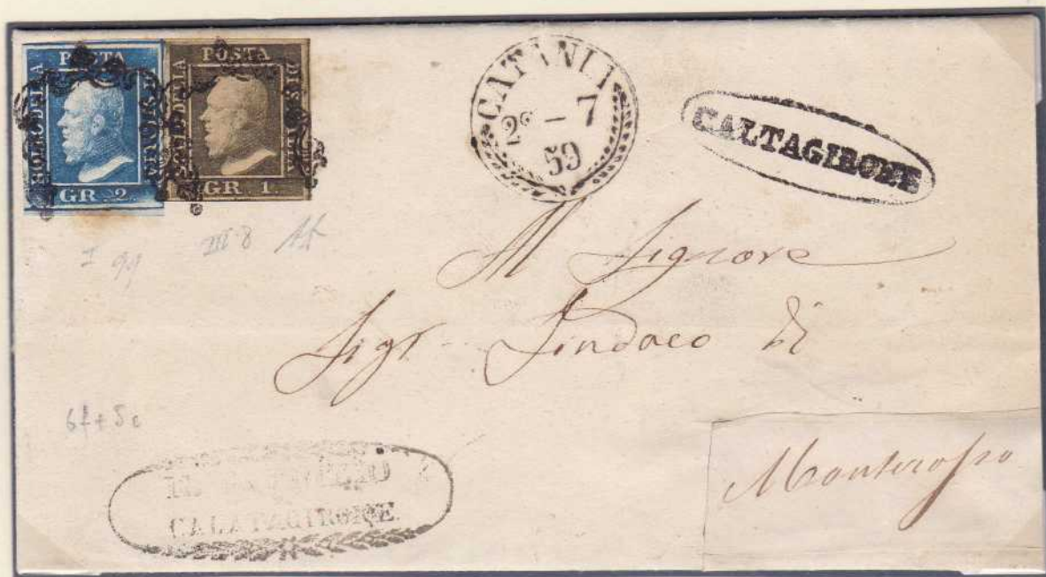
GR. 1 dark olive green (Palermo paper) with GR.2 bright blue (plate I) on letter of a sheet and a half from CALTAGIRONE (July 22, 1859) to Monterosso.