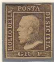
GR. 1 dark brown olive (Naples paper)