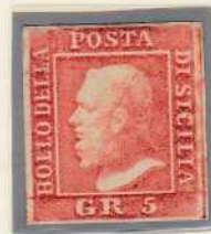
GR. 5 pink vermilion