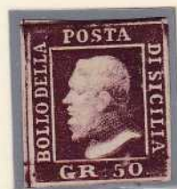
GR. 50 chocolate