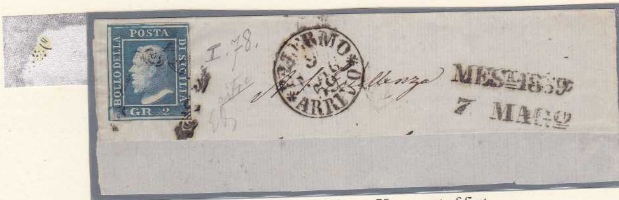
2 gr. blue (Palermo paper) pos.78 on part of first rate letter from Messina (May 7, 1859) to Palermo

2 Grana plate I : the plate had 17 retouched stamps