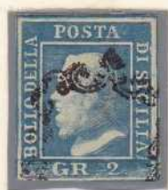
GR. 2 light blue (Palermo paper)