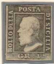
GR. 1 olive (Naples paper)