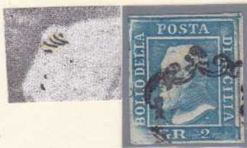
2 gr. blue (Palermo paper) (pos.92)