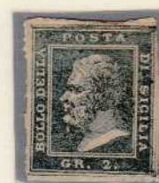
GR.2 green greyish the only known