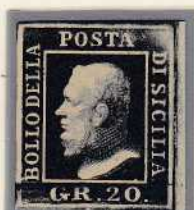
GR. 20 black slate