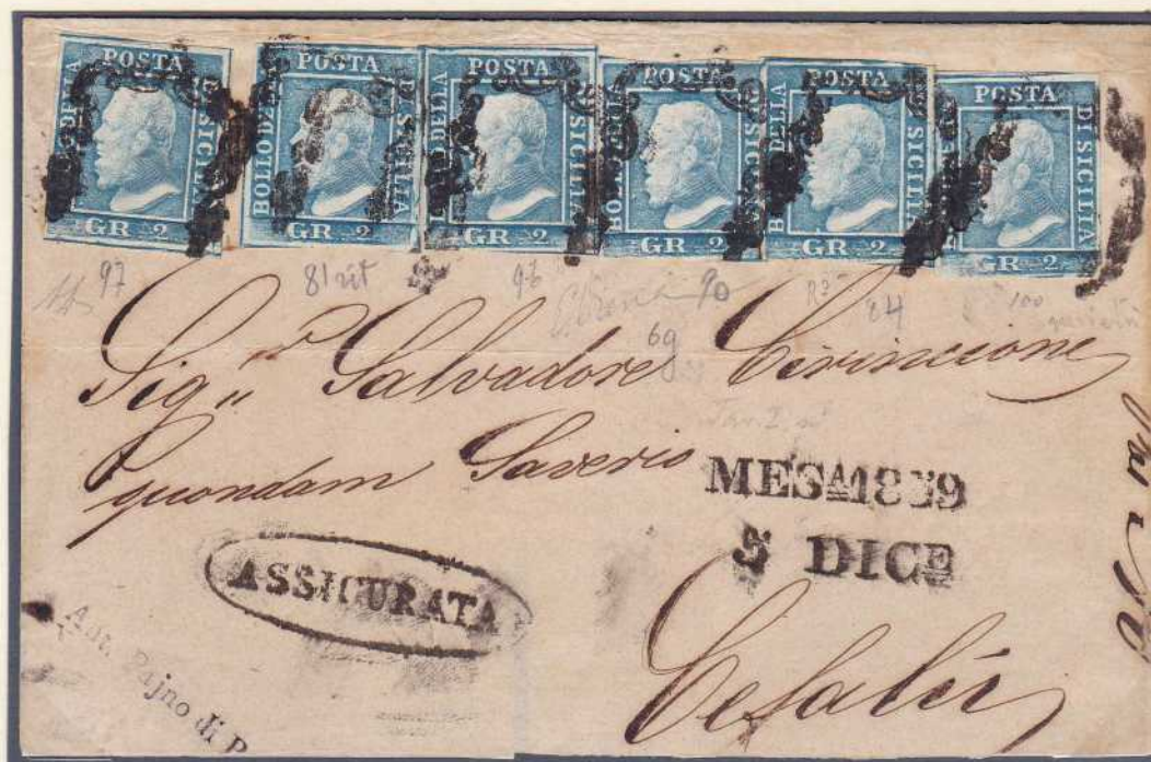
GR.2 light blue (Palermo paper), six stamps (two, pos.81 and 84, with retouch) on three sheets registered letter from MESSINA (December 5, 1859) to Cefalù.