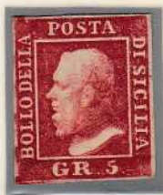
GR. 5 blood red