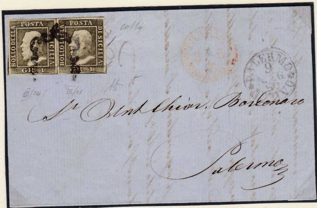
GR. 1 light olive green (Palermo paper), pair pos.26/27, on first rate letter from TRAPANI (May 8, 1860) to Palermo, where arrived May 9, 1860, two days before Garibaldi's landing in Sicily.