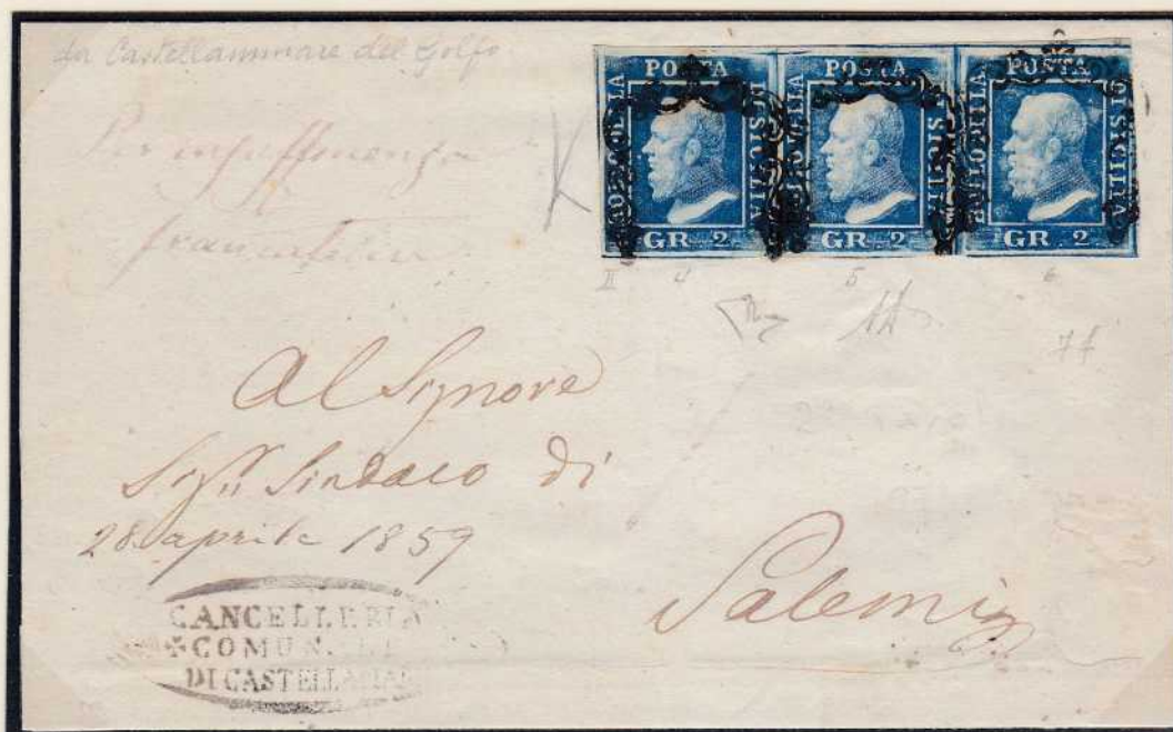
GR. 2 bright blue, strip of three stamps (pos. 4/6) on letter mailed in Castellammare del Golfo for Salemi, taxed "per insufficienza francatura". On the front is the date "28 aprile 1859".