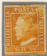
GR. 1/2 dark orange (Naples paper)