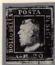
GR. 20 black slate