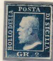
GR. 2 ultramarine blue (Naples paper)