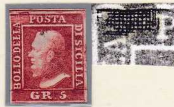
5 Gr. dark carmine pos.10