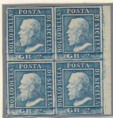
GR. 2 light blue, block (Palermo paper)