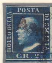
GR. 2 very dark blue (Naples paper)