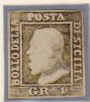
Gr.1 greyish olive green

The double engraving is constantly present in three positions of 1 grano, II plate (30,32 and 35) and 50 grana (43, 62 and 70). The effect is evident in the wording of effigy of the King.