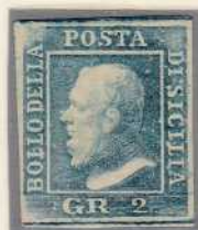
GR. 2 light blue (Palermo paper)