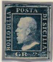
GR. 2 pale blue (Naples paper)