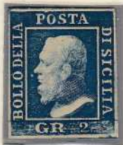
GR. 2 bright blue (Naples paper)