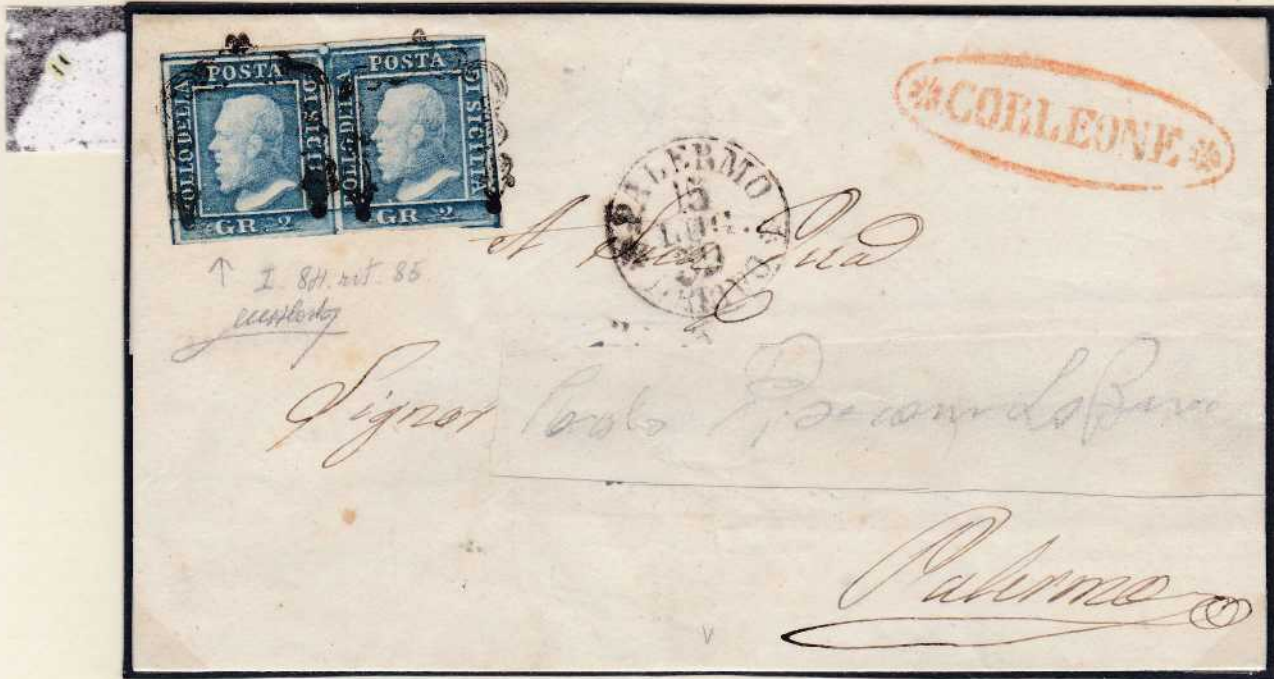
2 grana light blue (Naples paper), pair, pos.84 with retouch and 85, on two sheets letter from CORLEONE to Palermo, 1859, July 15.