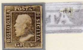
olive brown pos.59 (Naples paper)

1 Grano plate II : the plate had 7 retouched stamps