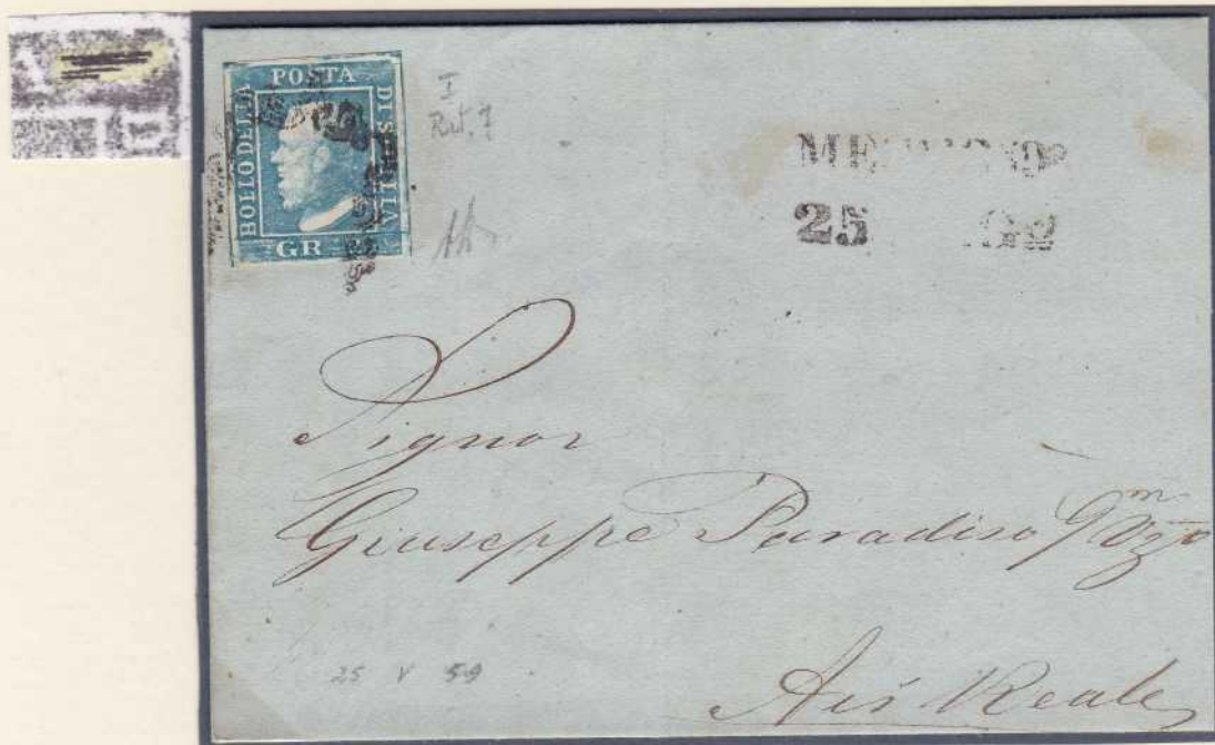
2 grana light blue, plate I, pos.7 with retouch, on first rate letter from Messina, 1859 May 25, to Acireale.