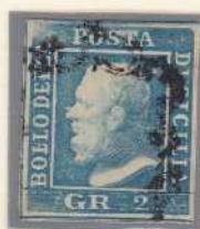
GR. 2 blue (Palermo paper)