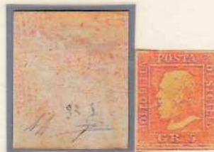
Gr. 5 vermilion, plate I (Palermo paper)