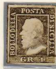
GR. 1 olive brown gray (second state)