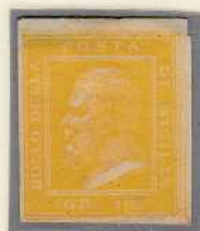
GR.2 light yellow the only known