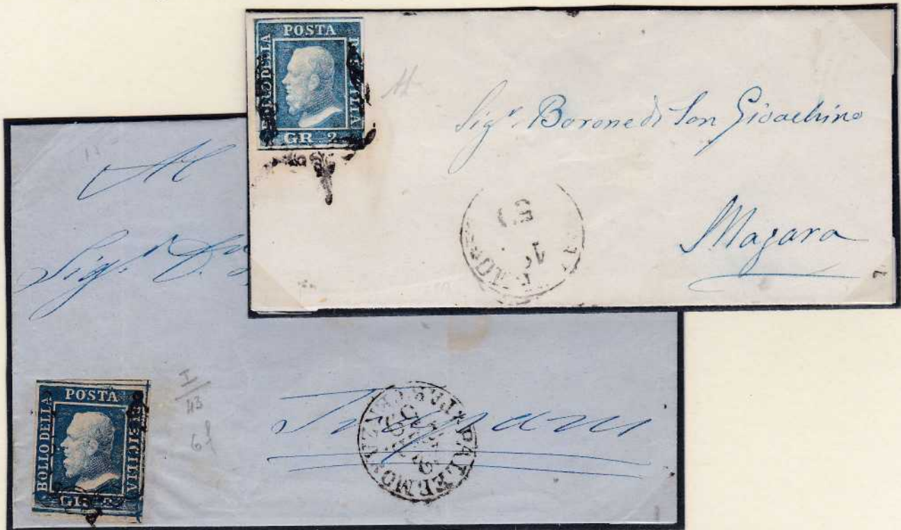
First rate letters from Palermo To Mazara and Trapani (1859). The 2 grana stamp was put on the left and so the postmark appears affixed upside down.

Today, after the examination of a good number of letters, it is believed that the postmark upside down was not use to corrupt the image of the King. Probably the postman, when the stamps weren't on the right side of the letter, provided to turn just those letters to work more easily.