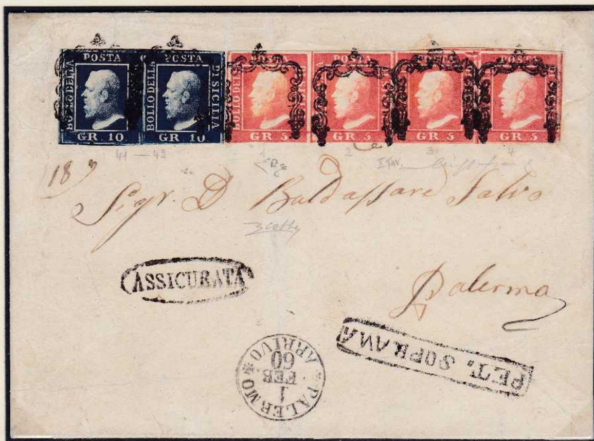
GR. 5 bright vermilion, strip of four (pos. 1/4), with 10 grana indigo, pair (pos. 41/42) on registered letter of two ounce and a half (40 grana) from PET. SOPRANA (Petalia Soprana) to Palermo (February 1, 1860).

The only known strip of 4 stamps of 5 grana plate II on letter