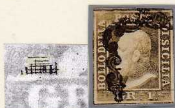
light olive brown pos.69 (Naples paper)