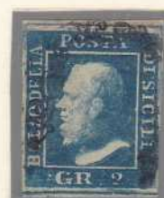
GR. 2 dark cobalt (Naples paper)