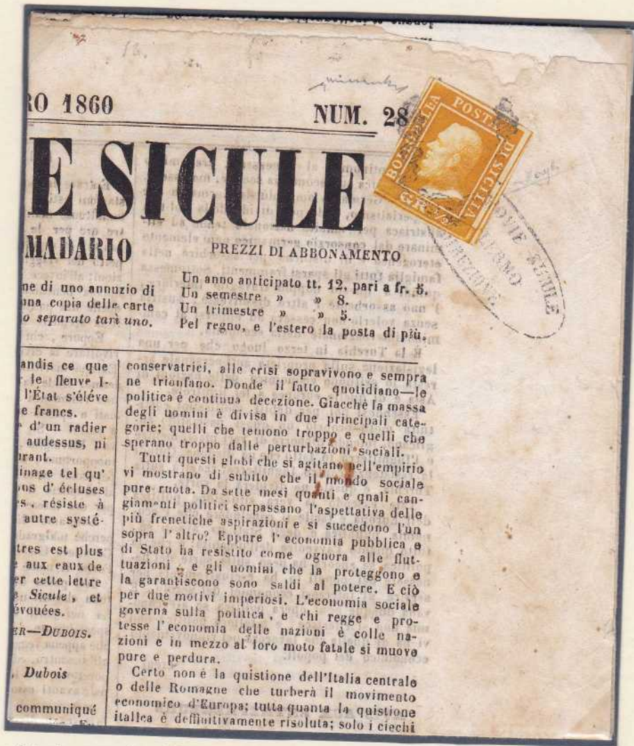
Gr. ½ orange (Naples paper) on "LE FERROVIE SICULE" OF January 7, 1860, newspaper first rate.