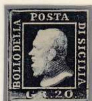
GR. 20 dark slate