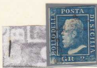
2 gr. bright blue (Naples paper) (pos.41)