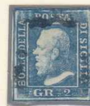
GR. 2 light blue (Naples paper)