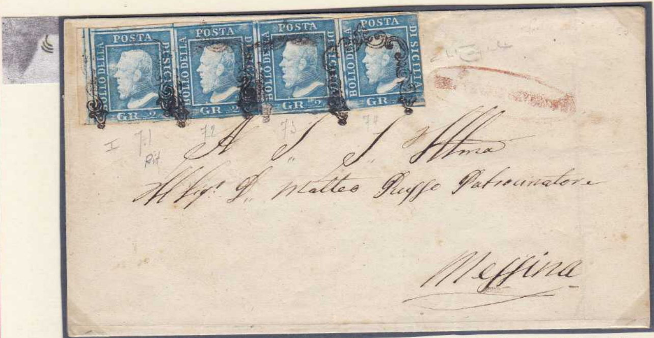
2 grana blue (Palermo paper), strip of 4 stamps, pos.71 with retouch, 72,73,74, on one ounce letter from S.STEFANO DI CAMASTRA to Messina (1859, October 6).