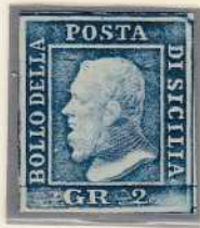
GR. 2 blue (Palermo paper)