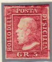
GR. 5 pink carmine