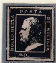
black without value

Not even these essays printed in the Lecoq typography pleased the authorities, that requested to stick more to the Juvara trials. So, in November 1858 other essays were prepared with and without the indication of value.