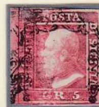
GR. 5 pink carmine, plate I (Naples paper) Double print on the left