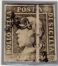
Gr. 1 greyish olive, plate II

Sometimes it is possible to find stamps with accordion folds of paper, vertical or horizontal, that existed before the press.