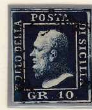
GR. 10 indigo