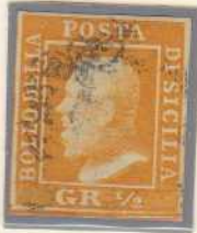
Gr. ½ orange (Palermo paper)