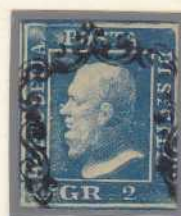
GR. 2 bright blue (Naples paper)