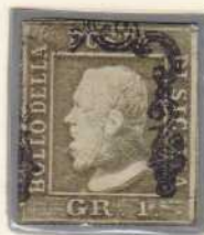
GR. 1 olive (Naples paper)