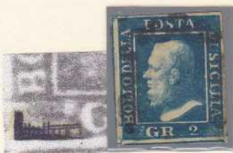
2 gr. cobalt blue (Naples paper) (pos.36)