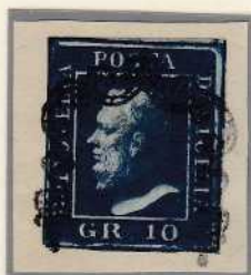
GR. 10 dark blue (different nuances)