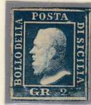
GR. 2 cobalt blue (Naples paper)