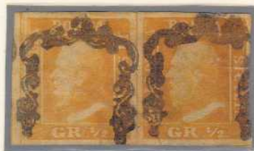
pair GR. ½ dark orange (Naples paper)