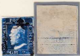
Gr. 2 light blue, plate II (Naples paper)