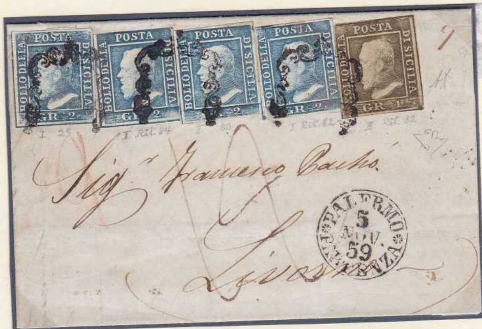
1 grano light olive brown, pos. 82 retouched, with 2 grana light blue (plate I), 4 stamps with pos. 82 and 84 retouched, on letter from Palermo (November 5, 1859) to Livorno.