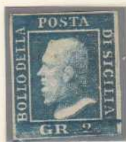
GR. 2 greenish blue (Naples paper)