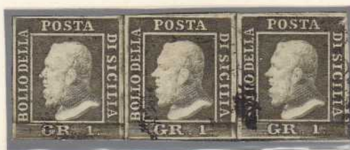
GR. 1 olive green (Naples paper) strip of three (pos.33,34,35)