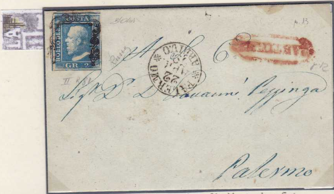
2 grana blue (Naples Paper), pos 81 with retouch, on first rate letter from PARTINICO to Palermo (1859, April 22)