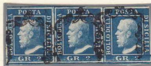
GR. 2 bright blue, strip of three (pos.97,98,99)