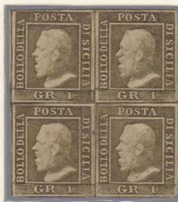
GR. 1 light olive green, block (Palermo paper)