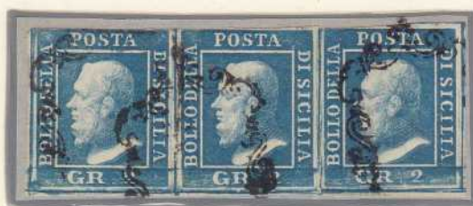
GR. 2 light blue, fragment with a pair and a single stamp (pos.39/40, 91)