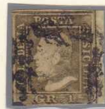
GR.1 greyish olive (Naples paper)