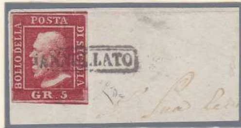
GR. 5 blood red

Fragment from a letter mailed to the ship. On arrival in Naples was put the mark "ANNULLATO"