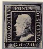
GR. 20 dark slate violet