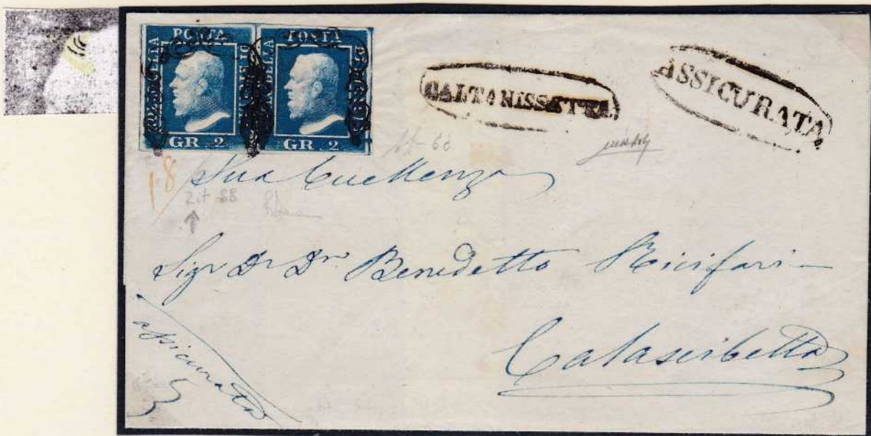
2 grana cobalt blue , pair, pos.88 with retouch and 89, on one sheet registered letter of the first months of 1859 from Caltanissetta to CALASCIBETTA.