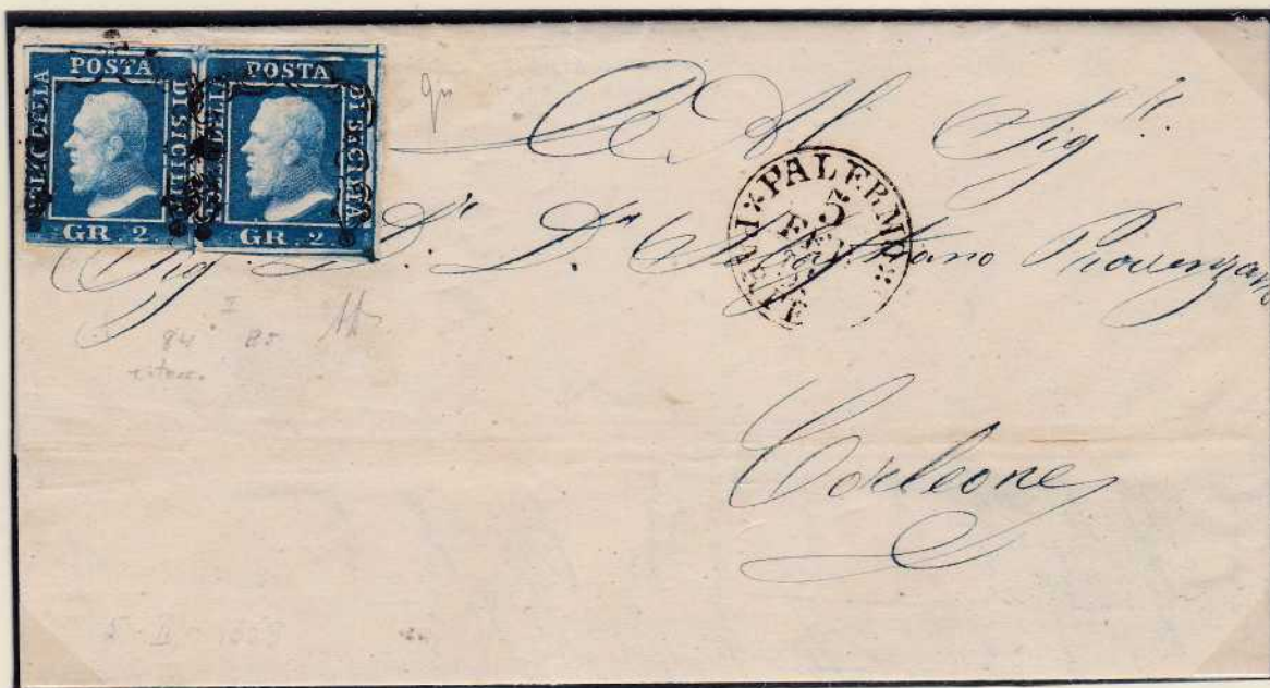
GR. 2 cobalt blue, pair (pos.84 retouched, 85) on second rate letter from Palermo (February 5, 1859) to Corleone.