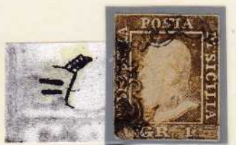
brown rust pos.55 (first state)