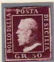
GR. 50 brown lacquer (different nuances)