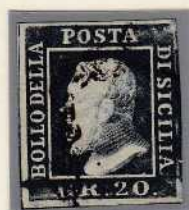
GR. 20 dark slate