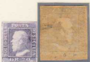
Gr. 20 grey slate