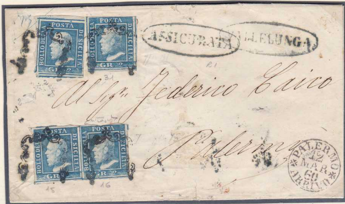
GR. 2 blue (Palermo paper), pair and other 2 stamps on double rate registered letter from VALLELUNGA to Palermo (mark "PALERMO ARRIVO 12 MAR 60").