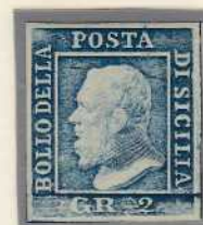
GR. 2 light blue (Naples paper)