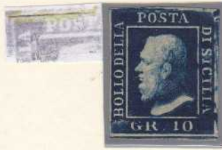
dark blue pos.53