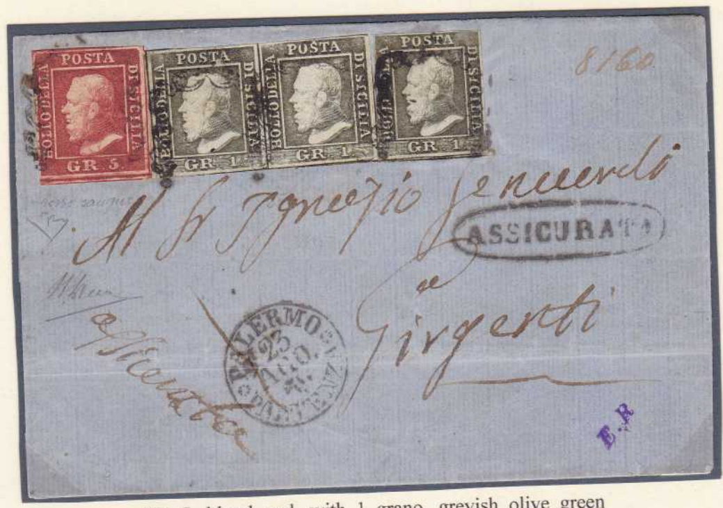
GR. 5 pink carmine with 1 grano dark olive green (Palermo paper) plate III on registered letter of a sheet and a half from SALEMI (one of the three registered letter known) to Palermo (March 16, 1860).