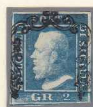
GR. 2 blue (Palermo paper)