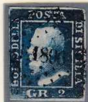
1 grano grayish olive green, plate II, with the points mark of the French ships and 2 grana cobalt, plate II, with the numeral cancellation "1896" of Marsiglia.