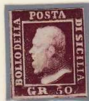
Gr.50 brown lacquer