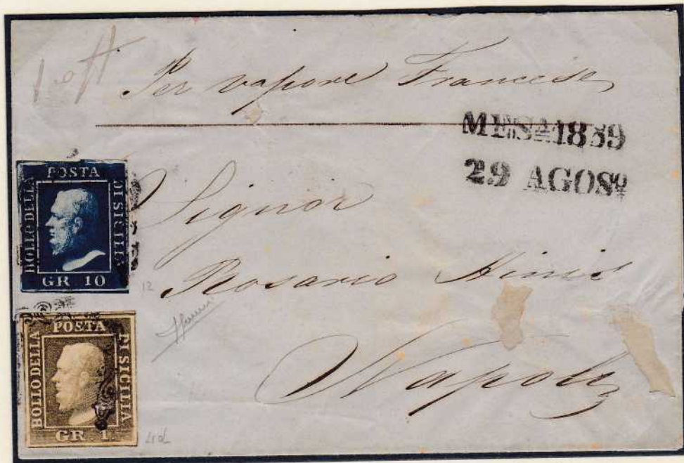
GR. 10 dark blue plus 1 grano olive, plate II, on one sheet letter from Messina (August 29, 1859) to Napoli with the French ship "Vatican".