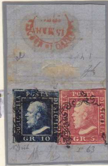
indigo pos.9 with 5 grana pink carmine on fragment to Naples (March 15, 1859)