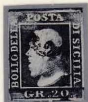
Gr. 20 grey slate