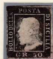
black, the only known