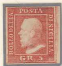
GR. 5 vermilion