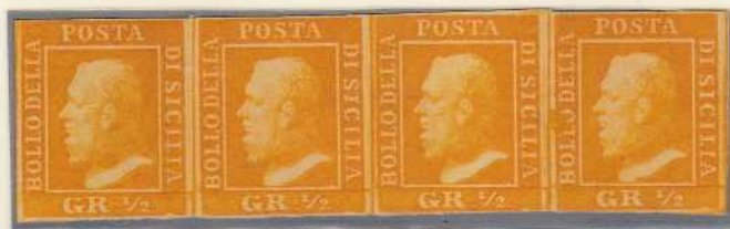
GR. ½ orange (Naples paper) Strip of 4: pos.71/74, ex Alphonse