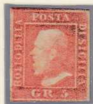
Gr. 5 light vermilion, plate I (Palermo paper)