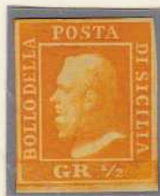
GR. ½ dark orange (Naples paper)