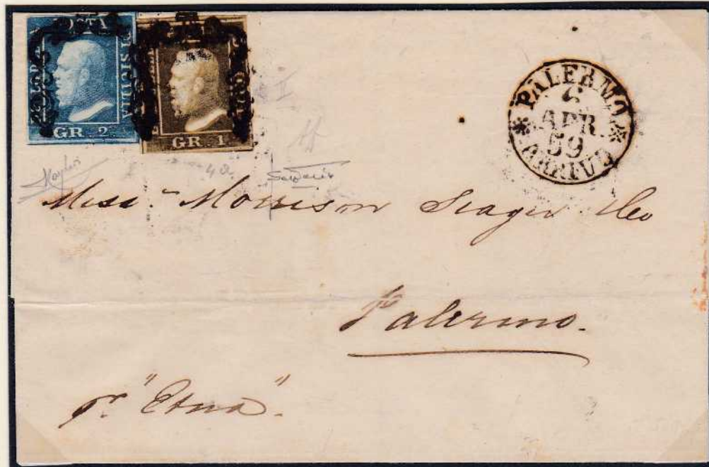
GR. 1 dark brown olive (Naples paper) with GR.2 blue cobalt (plate I) on letter of a sheet and a half from Messina (February 5, 1859) to Palermo, sea route with the "Etna" steamer.