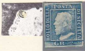
2 gr. blue (Palermo paper) (pos.55)