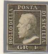
GR.1 olive green (Palermo paper)