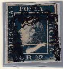
Gr. 2 pale blue, plate I