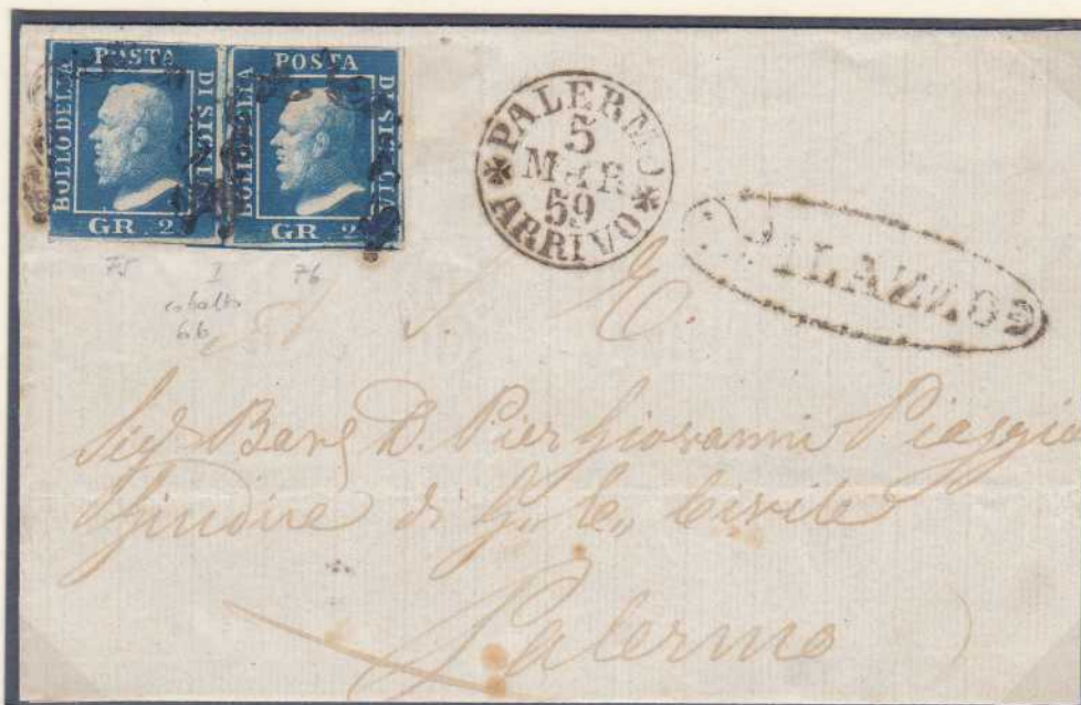
GR. 2 cobalt blue, pair, on double rate letter from MILAZZO to Palermo (March 5, 1859)