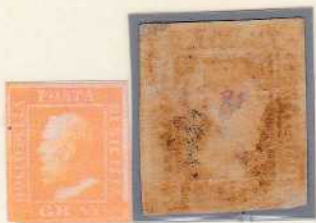
Gr. ½ arancio, plate II (Palermo paper)

It's due to the action of vegetable fats, sometimes in the brownish glue, that penetrating through the porous paper reach the printed surface giving it an oily appearance: at the back it's possible see the image of the stamp with an effect called "tête d'hivoire".