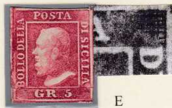
5 Gr. carmine pos.46