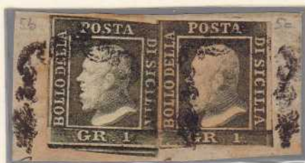
GR. 1 dark olive green (Naples paper) and GR. 1 olive green (Palermo paper) on fragment.