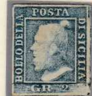
GR. 2 light blue (Naples paper)