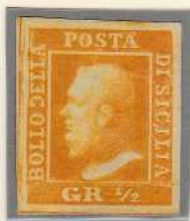
GR. 1/2 orange (Naples paper)