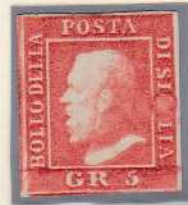
Gr.5 vermilion , plate II, pos.57 (Palermo paper)