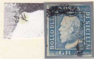
2 gr. light blue (Naples paper) (pos.51)