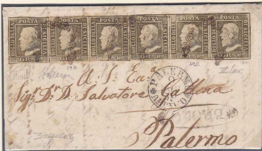
GR. 1 greyish olive (Naples paper), two strips of three on three rates letter from BROLO (November 7, 1859) to Palermo. The second stamp of each strip is retouched (pos.59 and 69).