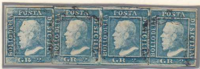
GR. 2 light blue (Palermo paper), four stamps on fragment (pos.40,45,51 with retouche,52)