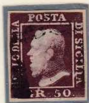
Gr.50 brown lacquer