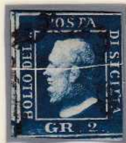
Gr. 2 very dark blue, plate III