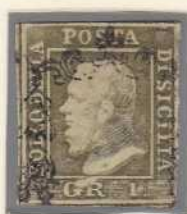
GR. 1 greyish olive green (Palermo paper)