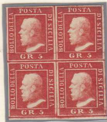
GR. 2 bright vermilion, block (pos.83/84, 93/94)