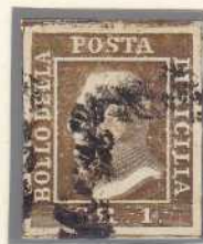
GR. 1 olive brown