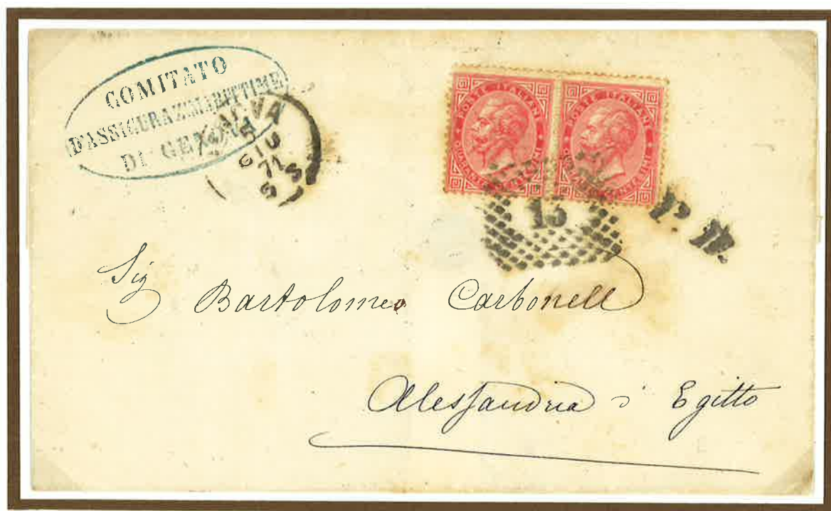
5 June 1871. Double rate letter from Genoa to Alexandria (Egypt), prepaid 80 centesimi to destination. The letter was placed on board on an Italian packet in Brindisi on 7 June and it was disembarked in Alexandria of Egypt on 16 June.