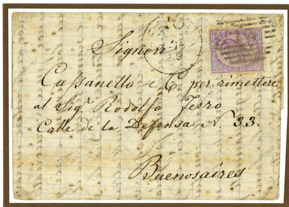
13 March 1879 . Single rate letter from Genoa to Buenos Aires (Argentina), prepaid 60 centesimi in accordance with the rate introduced by the General Postal Union, effective from 1 April 1878 to 31 March 1879.