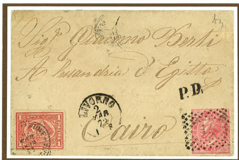
2 March 1872. Single rate letter from Leghorn to Cairo (Egypt), prepaid 40 centesimi to the disembarkation port of Alexandria of Egypt and charged 1 piaster on delivery, for the domestic fee from Alexandria to Cairo. The letter was placed on board on an Italian packet of the "Rubattino" Company to Alexandria of Egypt and then carried by the Egyptian Post to Cairo, where the letter was charged 1 piaster on delivery.