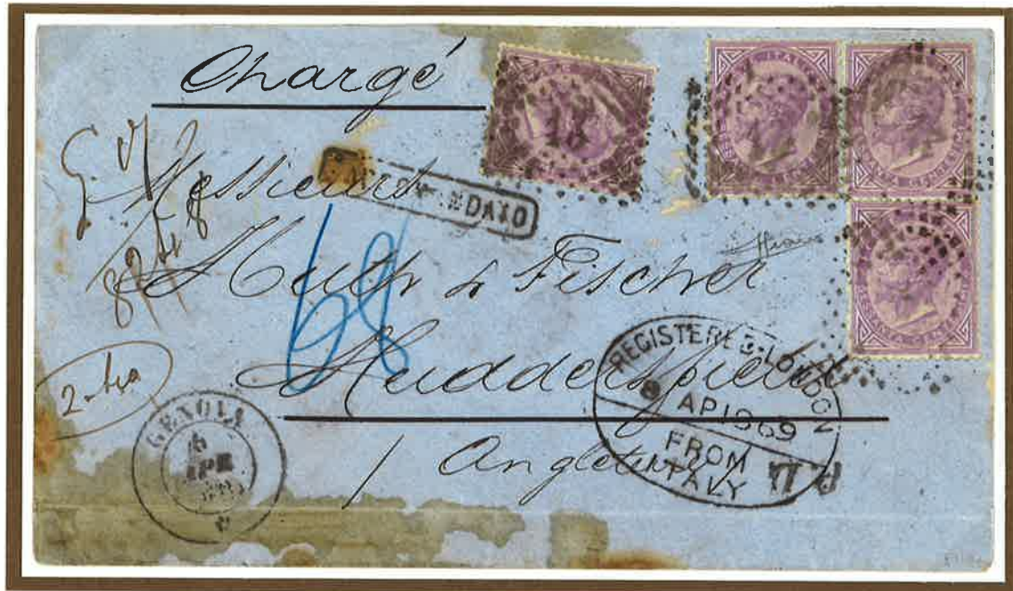
6 April 1869. Triple rate registered letter from Genoa to Huddersfield (United Kingdom), prepaid 2,40 Lire : 1,80 Lire triple letter rate, 60 centesimi registration fee. The letter was carried in closed mail through France to London (transit on 8 April) and then taken to Huddersfield, where it arrived on 9 April.