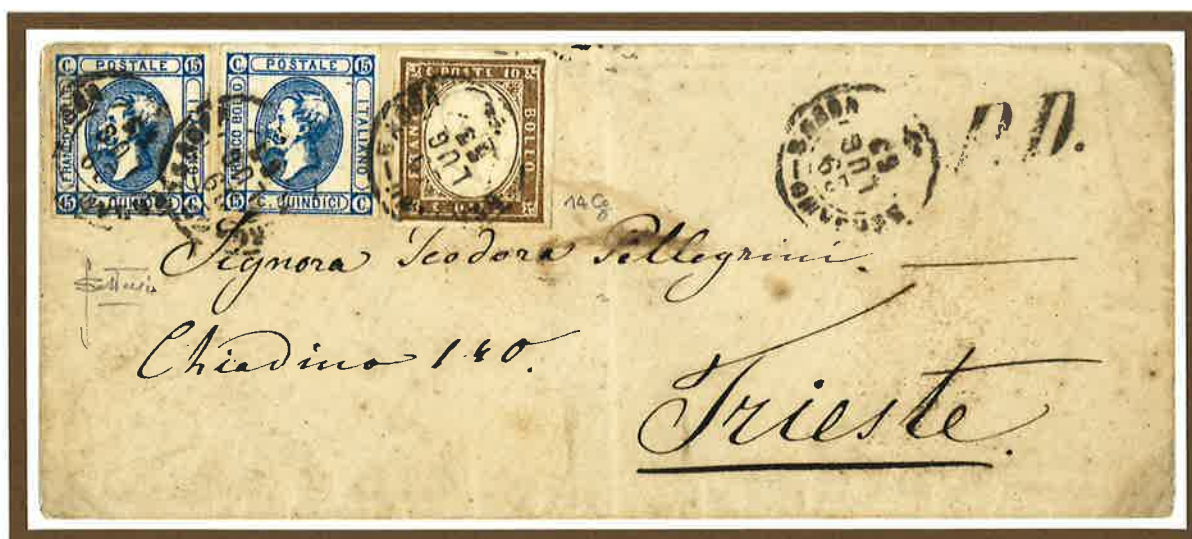
29 July 1863 . Single rate letter from Bergamo to Trieste (Austrian Empire), where arrived on 31 July, prepaid 40 centesimi to destination, from the 1 st Italian distance to the 2 nd Austrian distance.