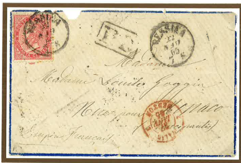
22 January 1865 . Single rate letter from Messina to the Principality of Monaco, prepaid 40 centesimi to destination. The French Exchange Office of Nice struck the red datestamp "ITALIE/2 MENTON 2". On the reverse the delivery datestamp of Monaco dated 29 January.

Up to 1875, when the Principality of Monaco agreed the GPU Convention, rates to Monaco were equal to rates to France.