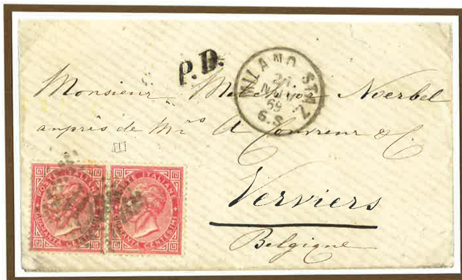
21 November 1869. Double rate letter from Milan to Verviers (Belgium), prepaid 80 centesimi to destination. The same day the letter reached Turin, where the closed bag to Belgium was prepared, it arrived in Verviers on 24 November.