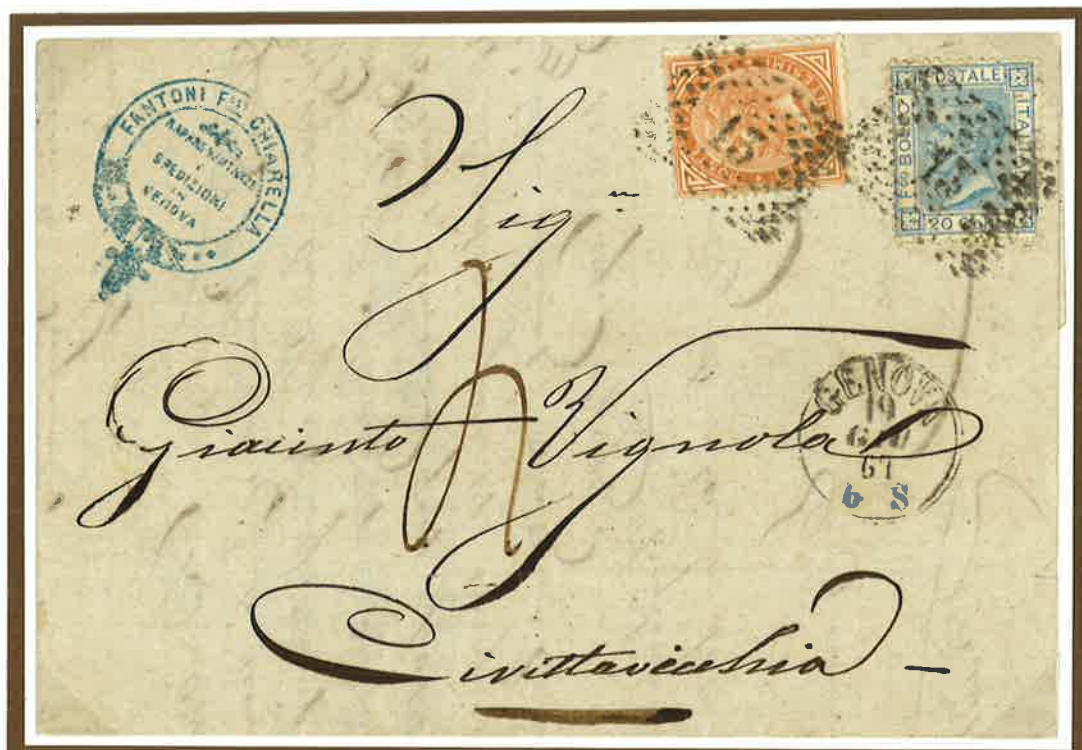
19 June 1866 . Single rate letter from Genoa to Civitavecchia (Papal States), prepaid 30 centesimi to be carried by sea up to destination, but was disembarked to Leghorn on 19 June (in this case were enough 25 centesimi), to continue by land with railroad to Civitavecchia, where it arrived on 21 June and it was charged 4 bajocchi on delivery.