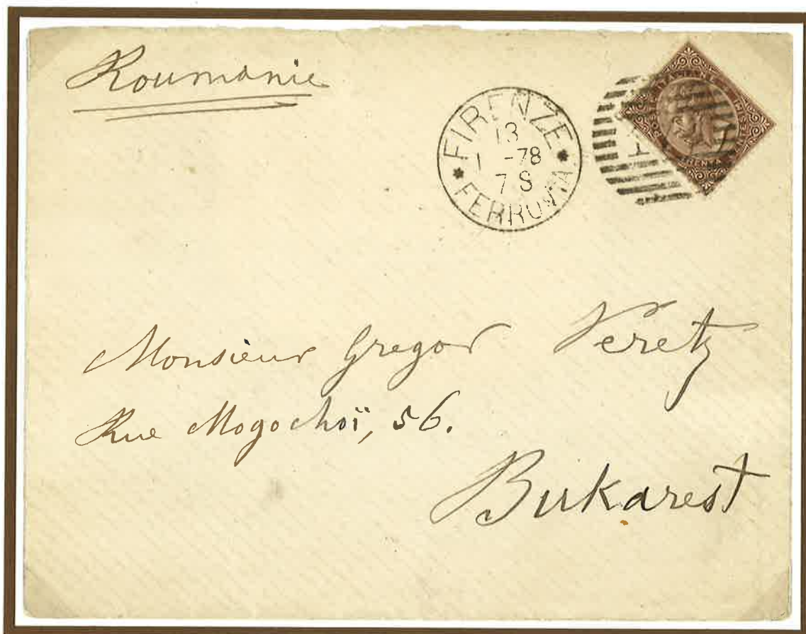
13 January 1878 . Single rate letter from Florence to Bukarest (Romania) prepaid 30 centesimi, in accordance with the rate introduced by the General Postal Union.