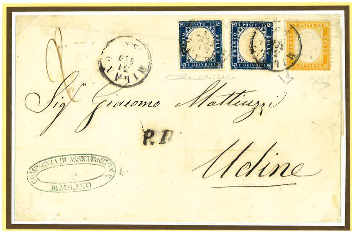
31 January 1863. Double rate letter from Milan to Udine (Austrian Empire), prepaid 1,10 Lire to destination, from the 2 nd Italian distance to the 2 nd Austrian distance.