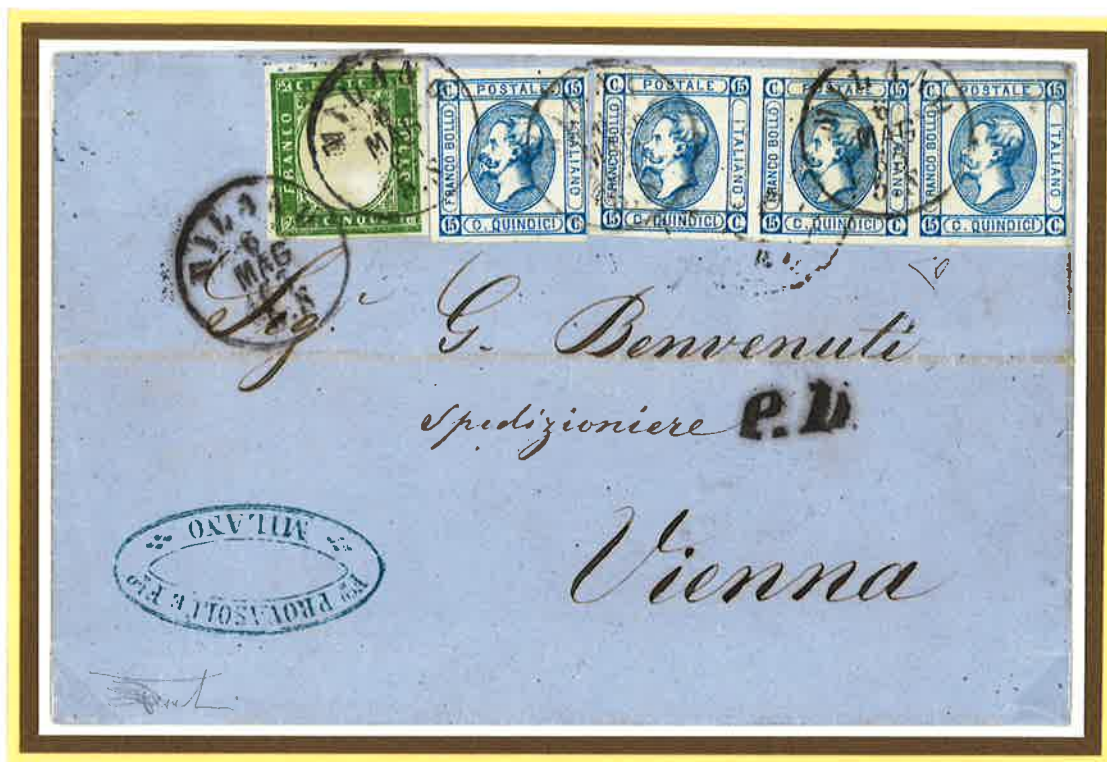
6 May 1863 . Single rate letter from Milan to Vienna (Austrian Empire), where arrived on 9 May, prepaid 65 centesimi to destination, from the 2 nd Italian distance to the 3 rd Austrian distance.

The rates to the Austrian Empire up to 30 September 1867 were equal to the rates presented in section 1.3 for Austrian Venetia.