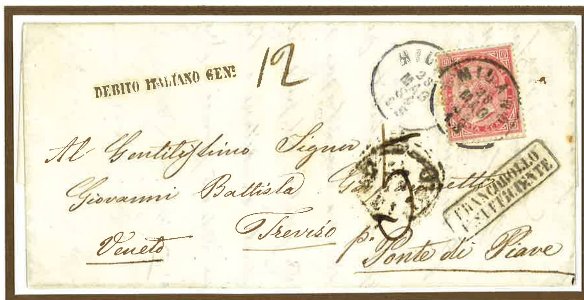
28 May 1864 . Single rate letter from Milan to Ponte di Piave (Austrian Venetia), insufficiently prepaid 40 centesimi instead of the 50 centesimi, it bears the handstamp "DEBITO ITALIANO" of 12 centesimi (equal to 5 Kreuzer) because the Italian share (from 2 nd distance) was equal to 28 centesimi. The Austrian share for a letter addressed in the 2 nd distance was 10 Kreuzer, then 5 Kreuzer had to be charged on delivery.