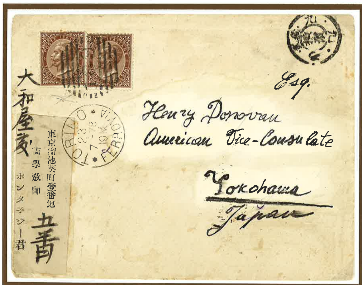
23 July 1878. Single rate letter from Turin to Yokohama (Japan), prepaid 60 centesimi to destination. The letter was taken by train to Naples where it was embarked on 30 July on the French packet "SINDH" that disembarked the letter in Hong Kong, where it was transferred to the French packet "VOLGA" that disembarked the letter in the French Post Office of Yokohama, that handed the letter to the Japanese postal system for the final delivery.

After the crossing of the isthmus the letter was carried from Suez by the British P&O packets, with transit from Singapore, Hong Kong, Shanghai to Yokohama, where it was delivered on 15 October.