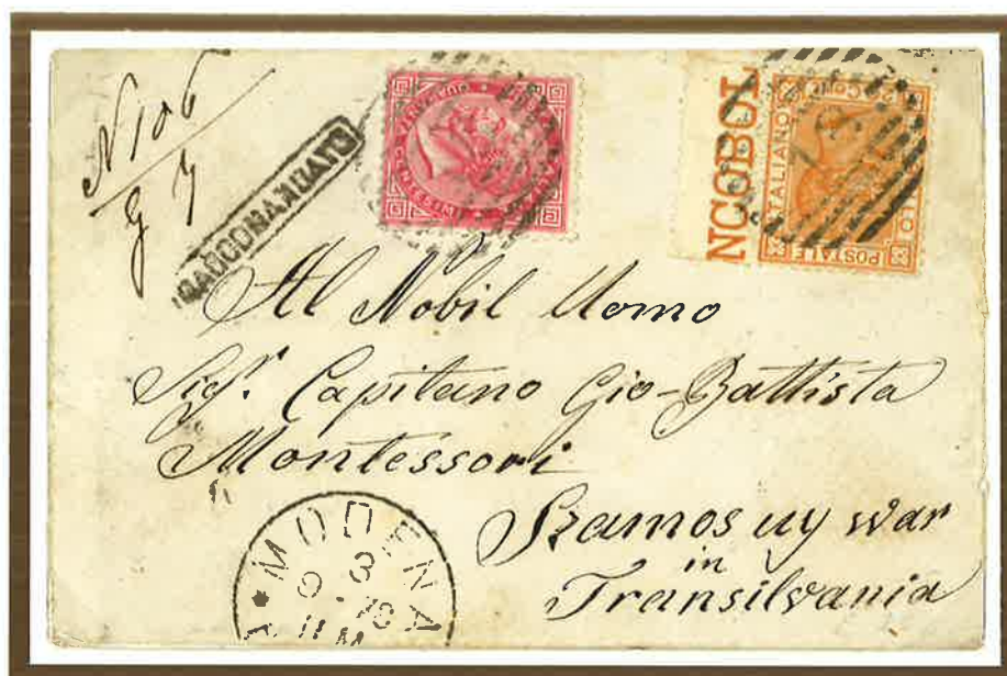
3 September 1878 . Single rate registered letter from Modena to Transylvania (Austrian Empire), prepaid 60 centesimi : 30 centesimi single rate letter and 30 centesimi registration fee.