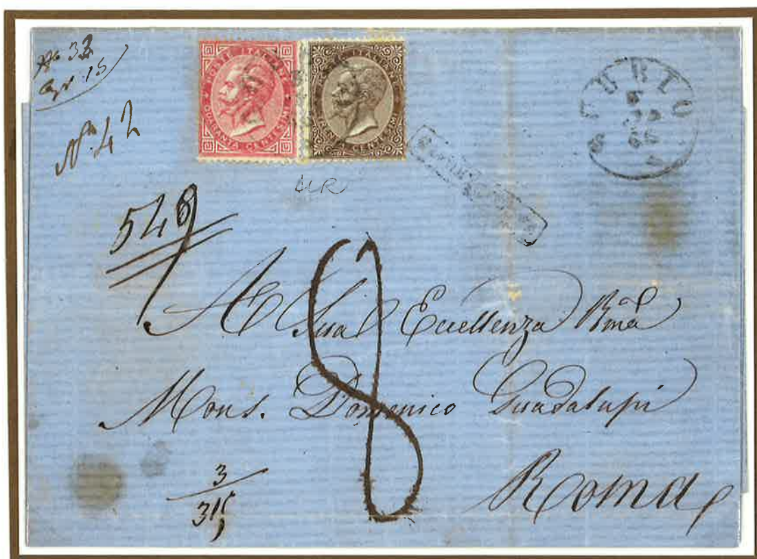
5 February 1866. Double rate registered letter from Gubbio to Rome, prepaid 70 centesimi to the Papal border, charged 8 bajocchi on delivery, (2 bajocchi for each 10 grams and 4 bajocchi registration fee).