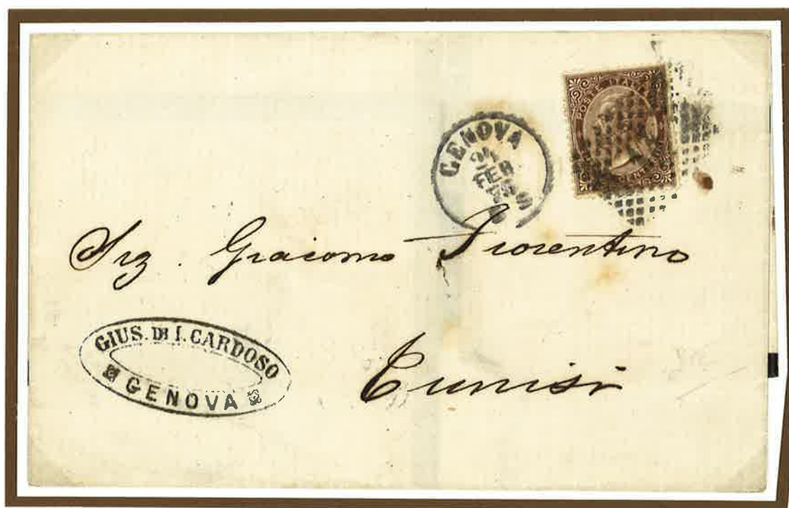
24 February 1876. Single rate letter from Genoa to Tunis, prepaid 30 centesimi to destination, after the transit from Leghorn on 25 February and Cagliari on 27 February, in accordance with the rate introduced by the General Postal Union, effective from 1 st January 1876.