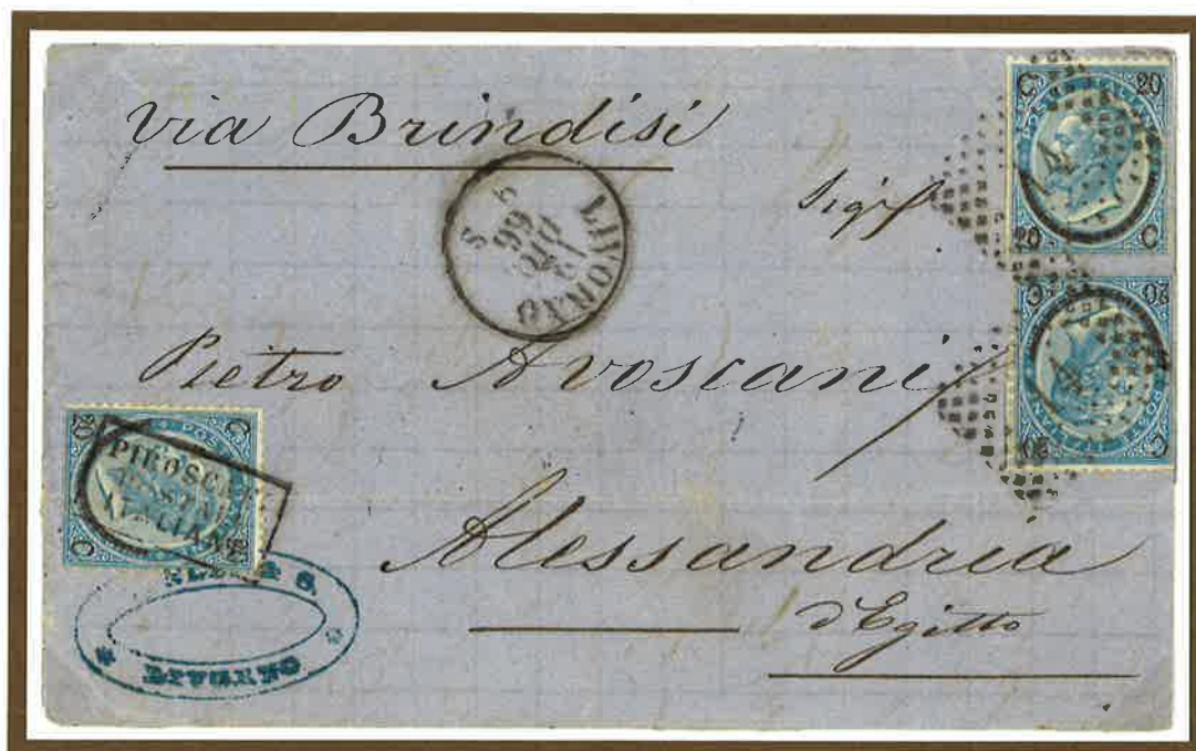
12 December 1866. Single rate letter from Leghorn to Alexandria (Egypt), prepaid 60 centesimi to destination. The letter was placed on board on a packet of the Adriatic-Oriental Italian Company in Brindisi on 16 December and it was disembarked in Alexandria of Egypt on 26 December.

The Italian post office of Alexandria was officially opened on 1 March 1863 for exchanging the mail with the Italian offices by the mean of the Italian packets via Ancona and then via Brindisi at the rate of 60 centesimi for each 10 grams, by French packets of the Egypt Line via Messina at the rate of 80 centesimi for each 7,5 grams of weight and by British packet via Marseille at the rate of 60 centesimi for each 10 grams of weight. Letters addressed beyond Alexandria were delivered by the "Posta Europea" up to 31 March 1865, by the "Poste Vicereali Egiziane" thereafter. Letters delivered beyond Alexandria were charged on delivery for the domestic rate.