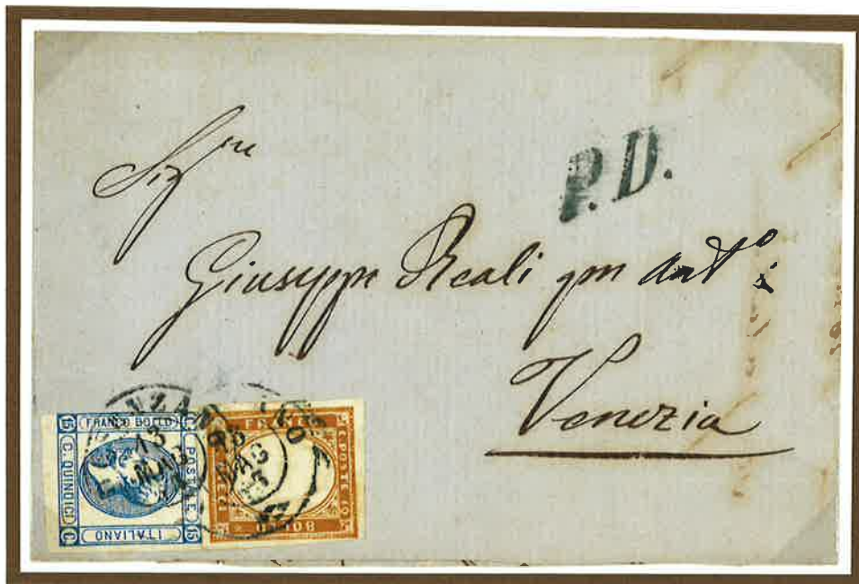
13 May 1863 . Single rate letter from Desenzano to Venice (Austrian Venetia), where it arrived the following day, prepaid 25 centesimi from the 1 st Italian distance to the 1 st Austrian distance.