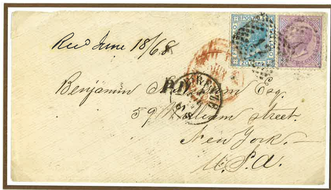
1 June 1868. Single rate letter from Florence to New York (U.S.A.), prepaid 80 centesimi to destination. The letter transited Turin, where was prepared the closed mail bag, that, after crossing the France, was embarked in Liverpool on the British packet of the Cunard Line "AUSTRALIAN". The letter was disembarked in New York on 17 June.

The direct Italian-American Convention, effective from 1 April 1868, established a letter rate of 80 centesimi for each 7,5 grams. An additional act to the Convention, effective from 15 February 1870, decreased the rate to 55 centesimi for each port of 15 grams. Letters were carried in closed mail through France, the closed mail bag was directly placed, in a British port, on board of the British or the American packets that disembarked the closed mail bag in an American port.