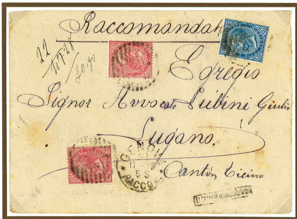
20 November 1878 . Double rate registered letter from Genoa to Lugano (Switzerland), prepaid 90 centesimi : 60 centesimi double rate letter and 30 centesimi registration fee.