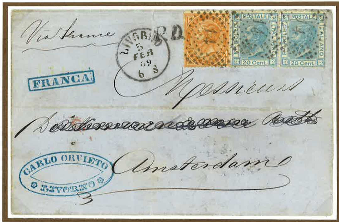
5 February 1869 . Single rate letter from Leghorn to Amsterdam, prepaid 50 centesimi to destination. The letter was carried in closed mail through France and Belgium.

The direct Italian-Dutch Convention, effective from 1 October 1868 established a letter rate of 50 centesimi for each 10 grams of weight, later the rate was reduced to 40 centesimi for each 15 grams. Letter were carried in closed mail through France, Switzerland or Austria.