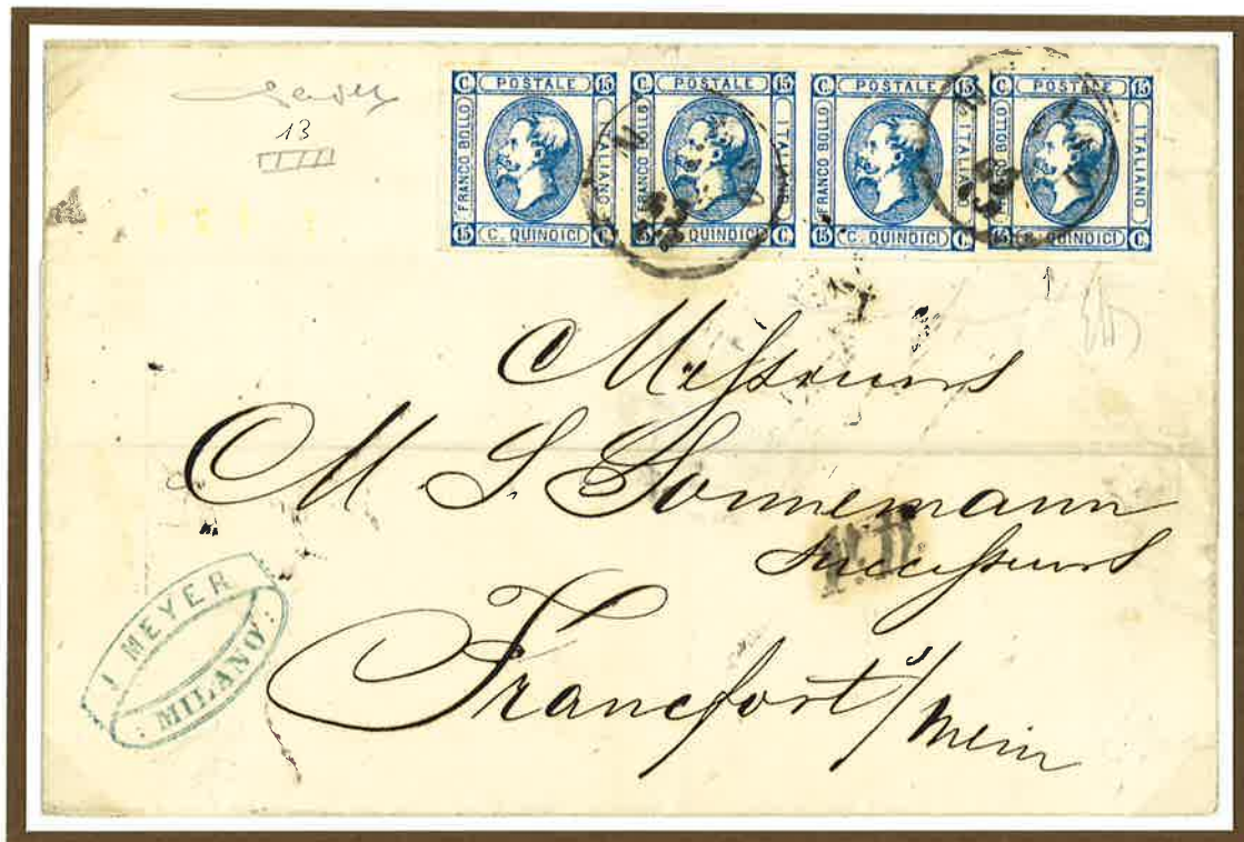
3 December 1863. Single rate letter from Milan to Frankfurt am Main (German States), prepaid 60 centesimi to destination. The letter carried with the Swiss mediation, as confirmed by the Chur transit, arrived in Frankfurt am Main on 5 December.

Up to 1 April 1869, when the direct Convention with Prussia, Bavaria, Württemberg and Baden was signed. Mail to the German States was delivered with the mediation of Switzerland, Austria or France. Up to 1867 letters were mainly sent with the Swiss mediation at a rate of 60 centesimi for each 10 grams of weight and a fixed registration fee of 60 centesimi. Mail from Sicily was mainly sent with the French mediation at a rate of 60 centesimi for each 7,5 grams.