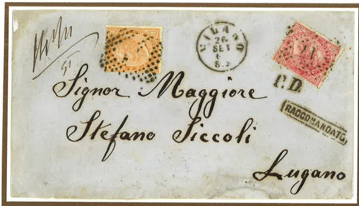
26 September 1866. Double rate registered letter from Milan to Lugano, prepaid 50 centesimi to destination : 20 centesimi double reduced letter rate (locations less than 45 km distant from the Exchange Office) and 30 centesimi registration fee.

A reduced rate of 10 centesimi was established for locations less than 45 km distant from the Exchange Post Offices. The fixed registration fee was established in 30 centesimi.