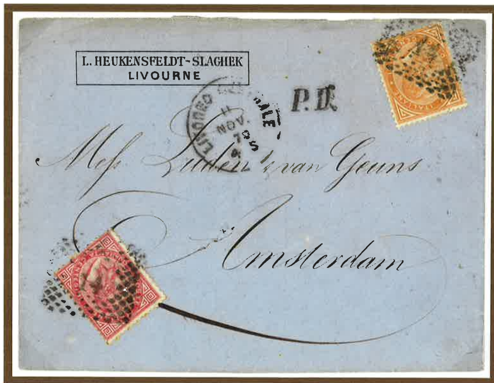
11 Novembre 1870 . Single rate letter from Leghorn to Amsterdam, prepaid 50 centesimi to destination. The letter was carried in a closed mail through France and Belgium and arrived to Amsterdam on 14 November. From 16 July 1870 the Austrian mediation required a rate of only 40 centesimi.