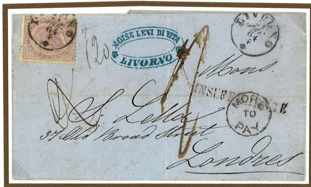
21 March 1864. Double rate letter from Leghorn to London (United Kingdom), underpaid 60 centesimi and charged 12 pence on delivery : 6 pence integration to the double rate and 6 pence the fixed fee due on unpaid or insufficiently prepaid letters.

In Turin, on 22 March, was prepared the closed mail bag to be opened in London, where it arrived on 24 March.