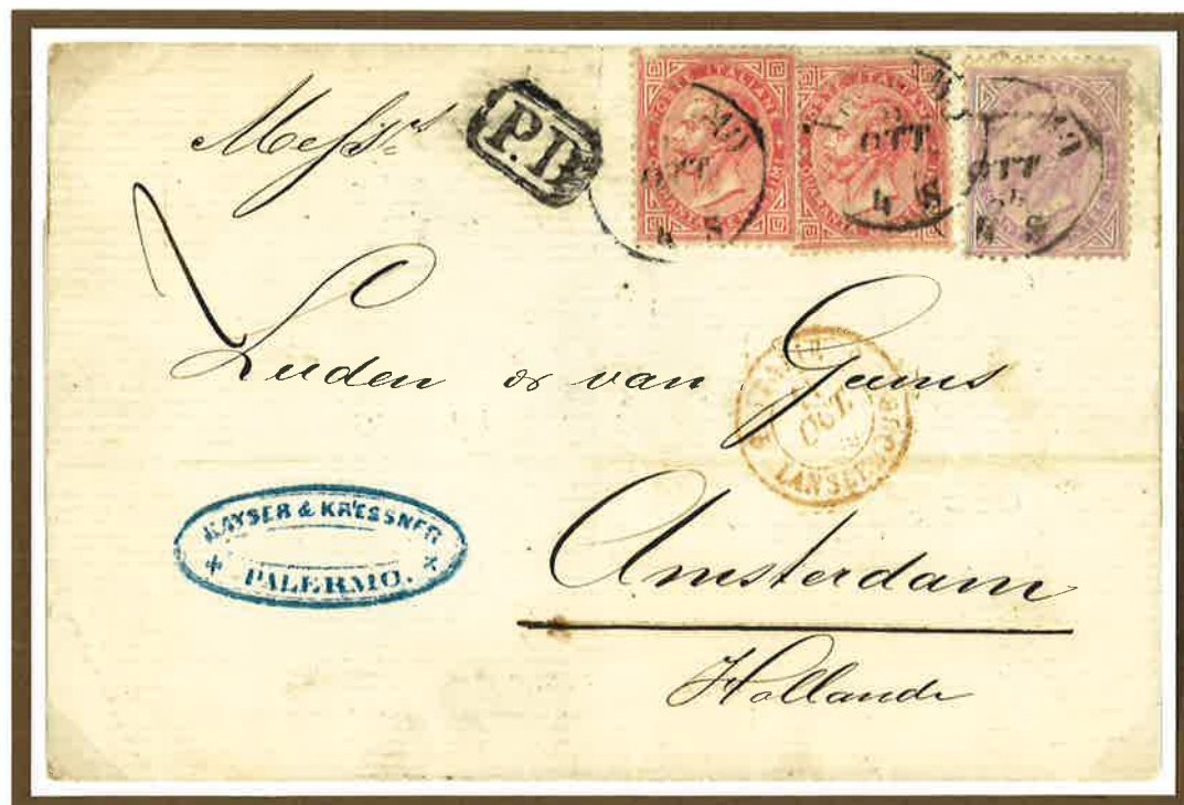
6 October 1864. Double rate letter from Palermo to Amsterdam, prepaid 1,40 Lire to destination. The letter was carried through France in the open mail and received in the Exchange Office in Paris the handstamp "ITALIE/ 5 LANSLEBOURG 5" and it arrived in Amsterdam on 12 October.