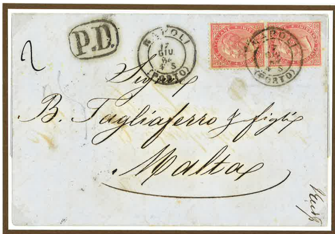
17 June 1864. Double rate letter from Naples to Malta, prepaid 80 centesimi to destination. The letter was carried to Malta by an Italian packet of the Florio lines.

Rates of letters addressed to Malta were indicated in the Anglo-Sardinian Convention of 1858 : 40 centesimi for each 7,5 grams of weight : 12,5 centesimi to Italy, 12,5 centesimi to Malta and 15 centesimi for the sea carriage. The sea carriage was credited to Malta when it was made by the French packets, was credited to Italy when made by the Italian packets of the Florio lines. Printed matter was rated 10 centesimi for each 40 grams.