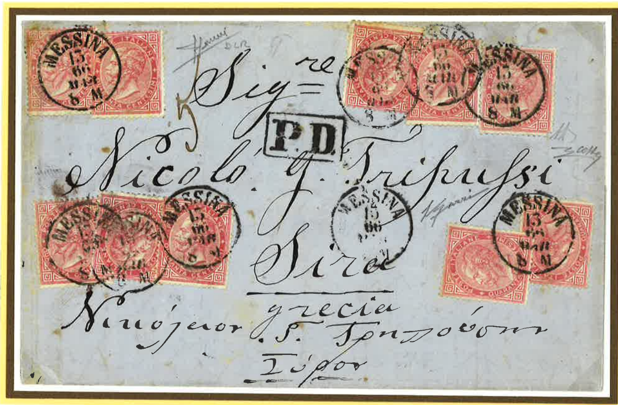
13 March 1866. Five times rate letter from Messina to the island of Syra (Greece), prepaid 4 Lire to destination. The letter was embarked on 20 March in Messina on the French packet "GODAVERY" of the Syria Line that disembarked the letter in Syra on 23 March (11 March of the Julian calendar).

From 1 February 1865 was effective a new Convention that reduced the rate to 60 centesimi for letters carried by Italian and Austrian packets and to 80 centesimi for letters carried by French packets. This Convention was effective until 30 June 1875, when the Convention of the General Postal Union was introduced.