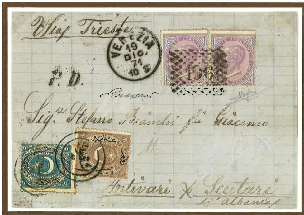
19 December 1871 . Double rate letter from Venice to Shkoder of Albania (Turkey) prepaid 1,20 Lire to the disembarkation port of Antivari and charged 4 piaster on delivery in Shkoder. The letter was on 20 December embarked in Trieste on an Austrian Lloyd packet and it was disembarked in Antivari.