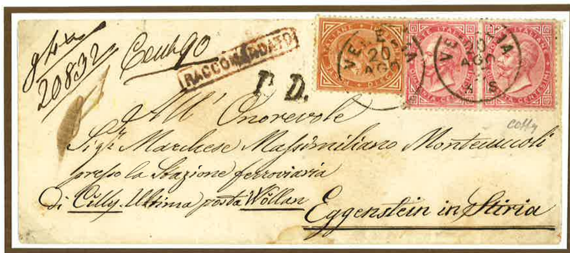
20 August 1867. Single rate registered letter from Venice to Eggenstein in Styria (Austrian Empire), prepaid 90 centesimi to destination : 50 centesimi from the 1 st Italian distance to the 3 rd Austrian distance and 40 centesimi registration fee.