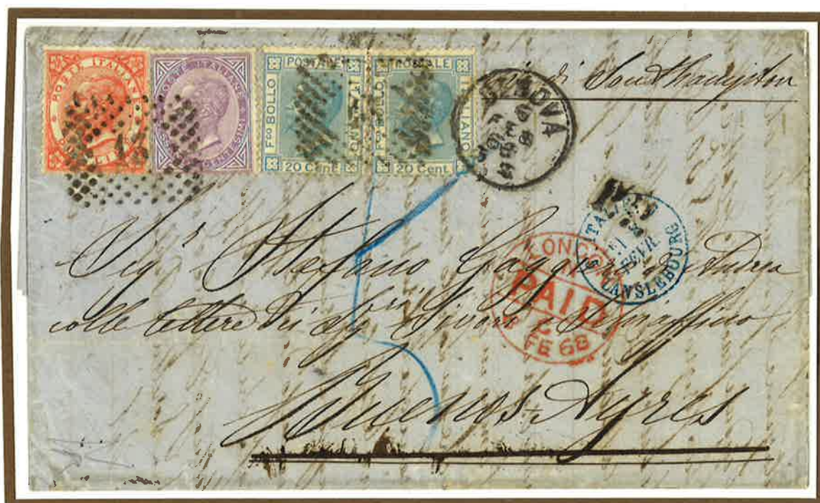
6 February 1868. Triple rate letter from Genoa to Buenos Aires (Argentina), prepaid 3 Lire to the port of disembarkation of Buenos Aires.

The letter was carried via Mont Cenis to Southampton and then on 10 February placed on board on the British RMSP packet "ONEIDA" that disembarked in Buenos Aires on 16 March, charged 5 centavos on delivery.