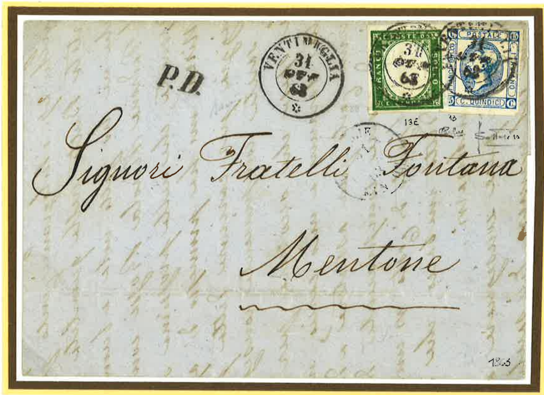
31 October 1863. Single rate letter from Ventimiglia to Menton (France), prepaid 20 centesimi to destination, reduced rate for locations less than 30 km distant. The only letter recorded franked with a 5 centesimi Sardinia and a 15 centesimi lithographic Kingdom of Italy, to compose the reduced rate to France.