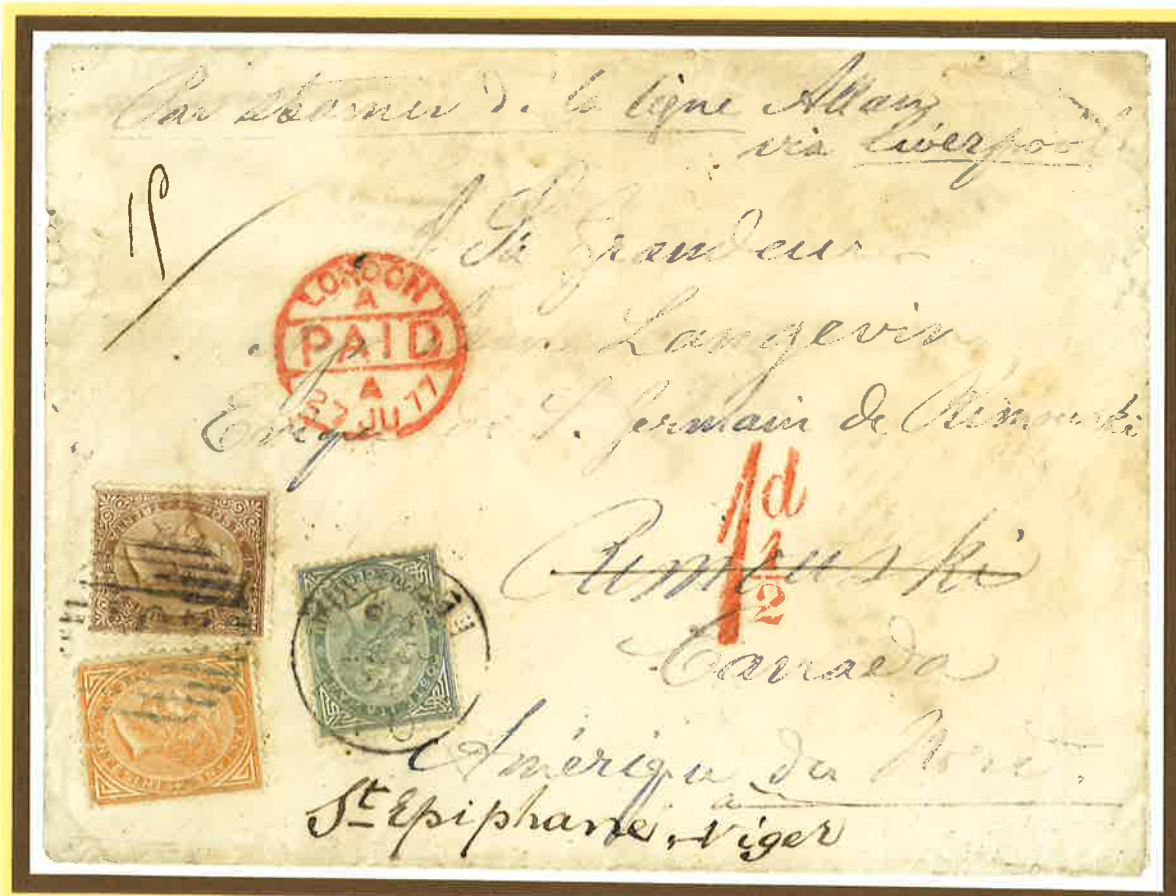
24 June 1877. Single rate letter from Rome to Rimouski (Quebec, Canada), and then readdressed to St. Epiphane, prepaid 45 centesimi to destination. The letter was carried in the closed mail to London and then carried to Liverpool and embarked on a Canadian packet of the Allan Lines that disembarked the letter in Quebec.