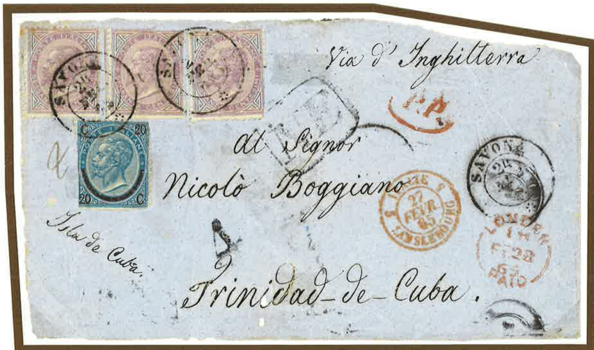
26 February 1865. Front of double rate letter from Savona to Trinidad de Cuba, prepaid 2 Lire to the port of disembarkation, charged 4 reales on delivery for double rate letter.

The letter after the Paris and London transit, was embarked on 2 February on the British packet "TASMANIAN" of the Royal Mail Steam Packet Company in Southampton and it was disembarked in St. Thomas on 17 February, in the same day it was embarked on the RMSP Company packet "EIDER" that disembarked the letter in Havana on 24 February. On the reverse the transit handstamp of Havana and the delivery datestamp of Trinidad de Cuba struck on 25 February.