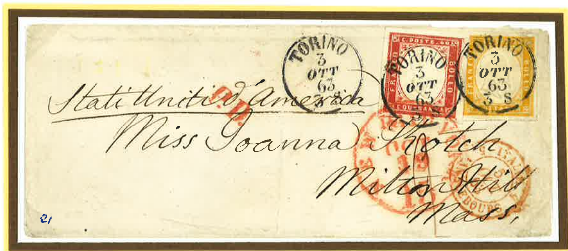
3 October 1863. Single rate letter from Turin to U.S.A., prepaid 1,20 Lire to destination. The letter was carried to Paris through the Mont Cenis and arrived in Paris on 5 October and received the handstamp "ITALIE/5 LANSLEBOURG 5".

Up to 1 April 1868, when the direct Italian-American Convention became effective, rates of letters prepaid to destination in the U.S.A. were determined by the French mediation in 1,20 Lire for each 7,5 grams. Letters were disembarked in the U.S.A. ports (New York, Boston or Portland) from the British packets of the Cunard Line sailing from Liverpool or by the American packets sailing from Liverpool or Southampton (indirect service). Letters could be also carried by the American packets from the French port of Le Havre (direct service).