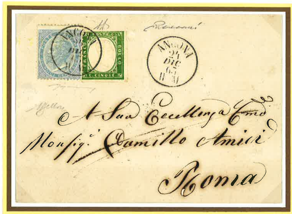
24 December 1863. Single rate letter from Ancona to Rome (Papal States), prepaid 20 centesimi to the Papal border. No charges on delivery because the addressee enjoyed free postage.

The reduction to 15 cents of the domestic rate from 1 st January 1863, was not applied to the letters to the Papal States, which continued to be franked for 20 centesimi to the Papal border, sometimes creating confusion among users.