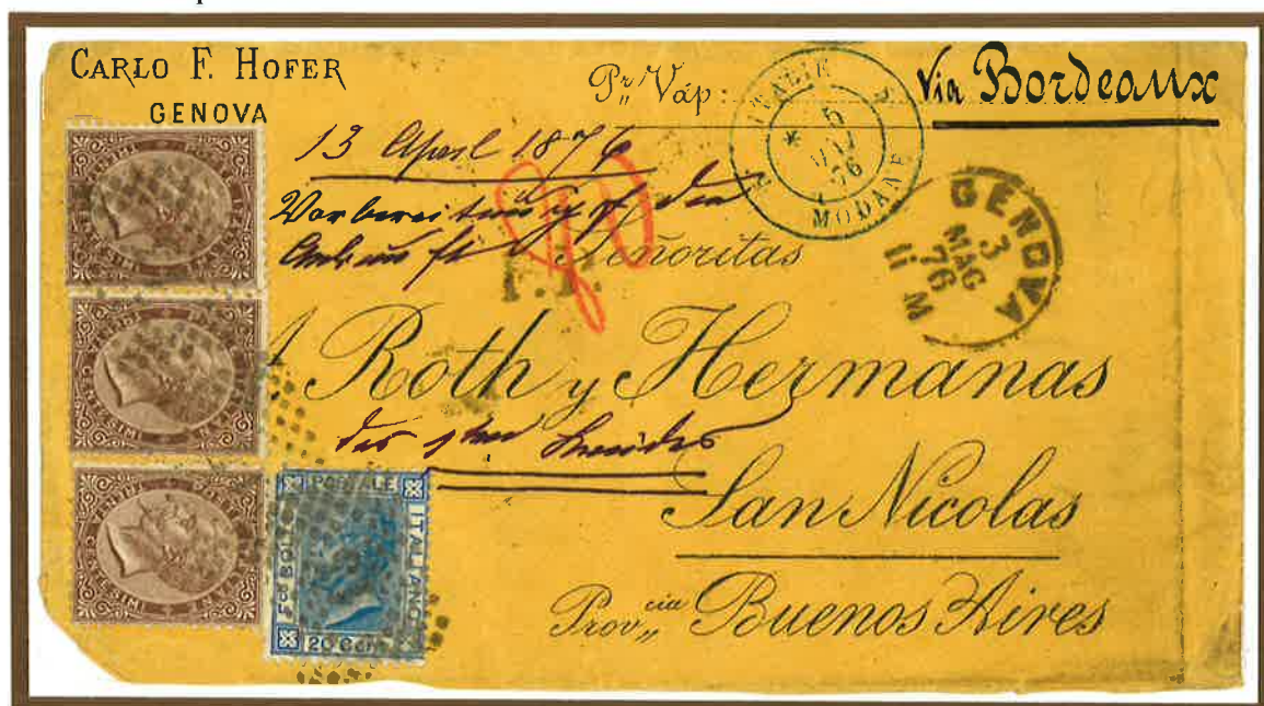
3 May 1876. Single rate letter from Genoa to San Nicolas (Argentina), prepaid 1,10 Lire to the port of disembarkation of Buenos Aires. On the cover indication of the 80 centesimi of the "prix de livraison" due to France. The letter was carried via France as confirmed to the handstamp "5 ITALIE 5/MODANE" struck in Modane on 5 May. The letter was, in Bordeaux, placed on board of the French packet "NIGER" and it was disembarked in Buenos Aires on 30 May.