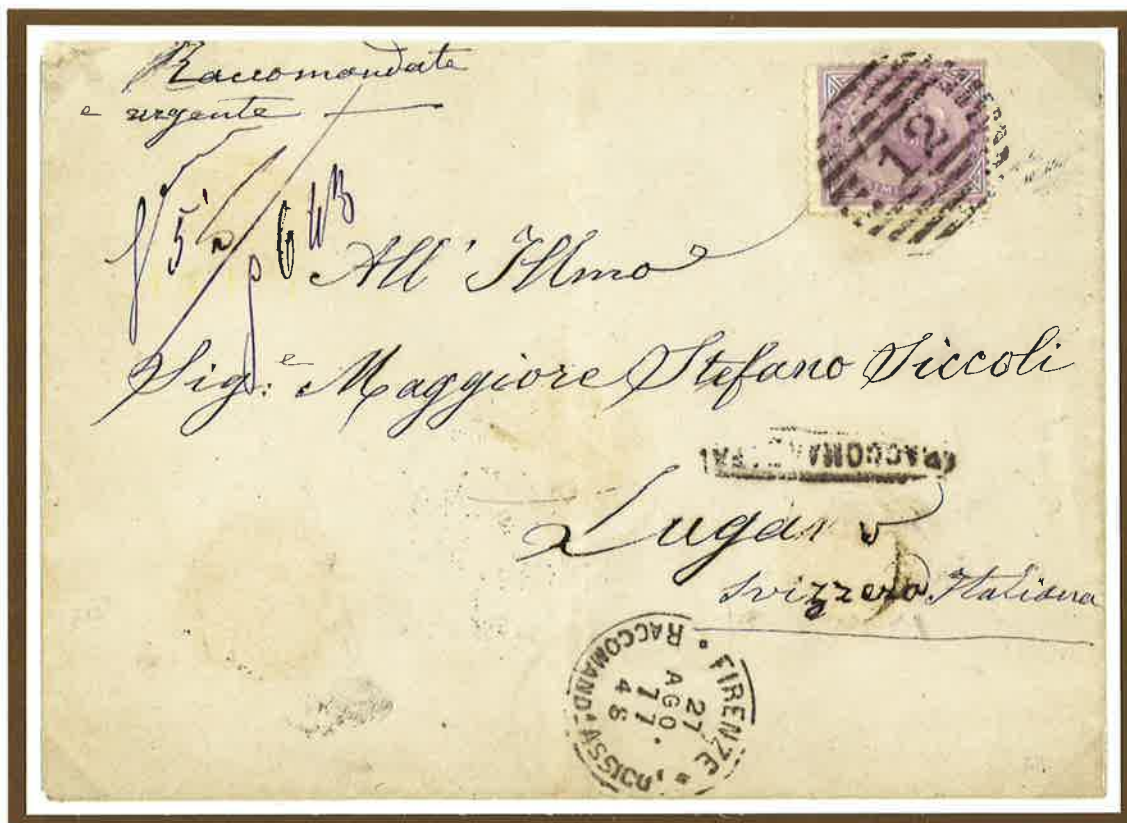
22 August 1877 . Single rate registered letter from Florence to Lugano (Switzerland), prepaid 60 centesimi : 30 centesimi single rate letter and 30 centesimi registration fee.

The Convention of General Postal Union in effect from 1 st July 1875 indicated that the rate of letters had to be established between 25 and 32 centesimi. The Italian Administration adopted the rate of 30 centesimi equal to the rate indicated by the Italian-Swiss Convention.