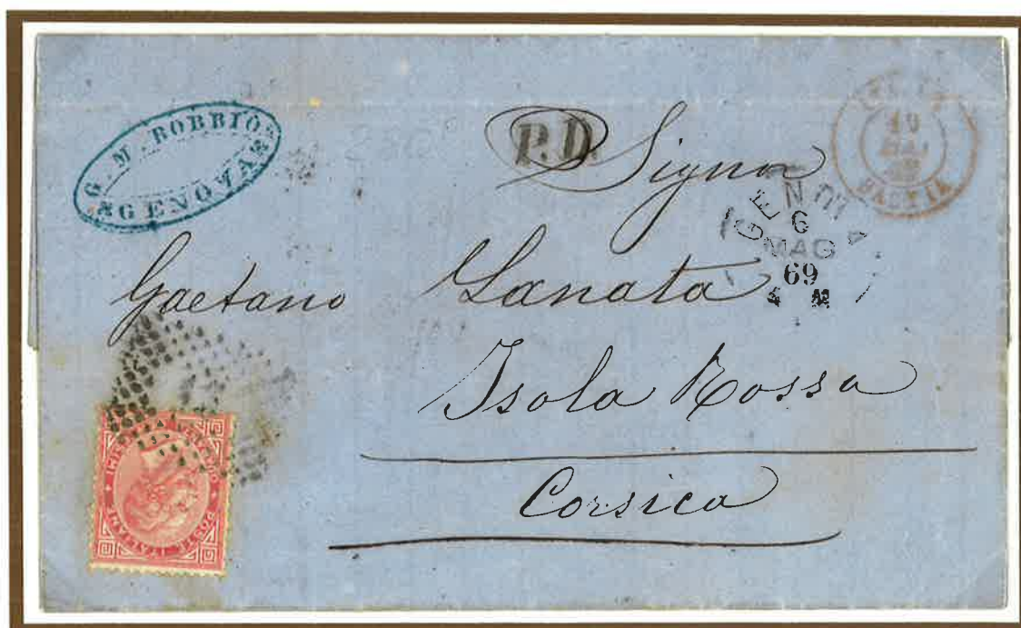
6 May 1869 . Single rate letter from Genoa to Isola Rossa (Corsica), prepaid 40 centesimi to destination. The letter was carried by a French packet from Leghorn to Bastia.