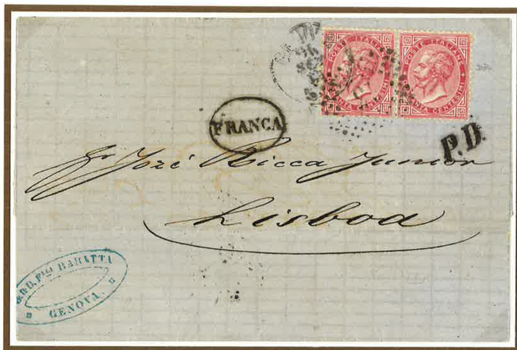
26 September 1867. Single rate letter from Genoa to Lisbon (Portugal), prepaid 80 centesimi to destination. The letter was carried in closed mail through France and Spain.

The direct Italo-Portuguese Convention, effective from 1 st September 1863, established a rate of 80 centesimi for each 10 grams for letters prepaid to destination. Letters were carried in closed mail through France and Spain. A new Convention effective from 1 st October 1871 reduced the rate of letters prepaid to destination to 60 centesimi. The fixed registration fee was determined in 50 centesimi. On 1 st July 1875 Portugal entered in the General Postal Union.