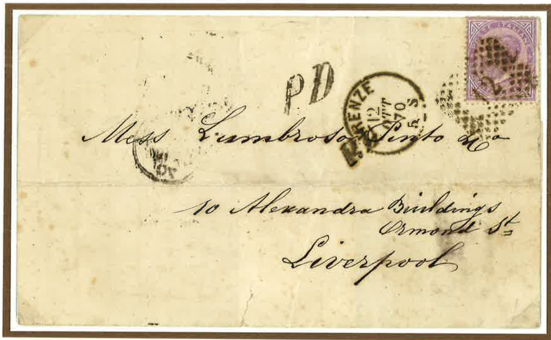
12 October 1870. Single rate letter from Florence to Liverpool (United Kingdom), prepaid 60 centesimi to destination. The letter was carried in closed mail through Germany.

Even though it is not indicated on the letters, because they were carried to UK in closed mail, from September 1870 letters to UK, due to the Franco-Prussian war were routed via Germany.