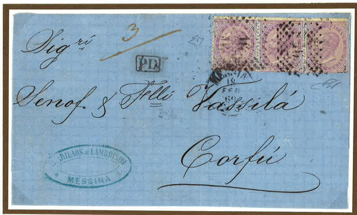
18 February 1869. Triple rate letter from Messina to Corfu (Greece), prepaid 1,80 Lire to destination. The letter was placed on board the Austrian Lloyd packet of the Greek-Oriental Line in Brindisi on 21 February. The letter was disembarked in Corfu on 22 February 1869 (10 February of the Julian calendar).