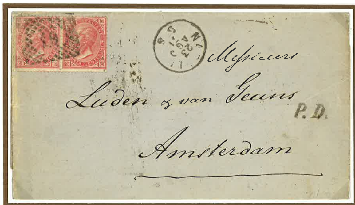
23 August 1871. Double rate letter from Naples to Amsterdam, prepaid 80 centesimi to destination. The letter transited Verona where the closed mail to be carried through the Brenner Pass was prepared.