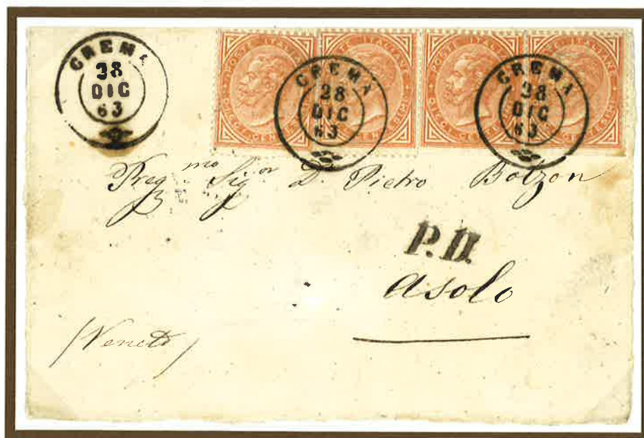
28 December 1863 . Single rate letter from Crema to Asolo (Austrian Venetia), prepaid 40 centesimi from the 1 st Italian distance to the 2 nd Austrian distance.