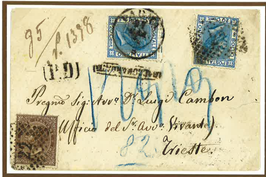
27 March 1868. Single rate registered letter from Parma to Trieste (Austrian Empire), prepaid 70 centesimi to destination : 40 centesimi single letter rate and 30 centesimi registration fee.

From 1 st October 1867 a uniform rate, independent from distance, of 40 centesimi for each 15 grams, was introduced. A reduced rate of 15 centesimi, was introduced for location less than 30 km distant. These rates were in effect up to 30 June 1875 when the GPU rates were introduced.