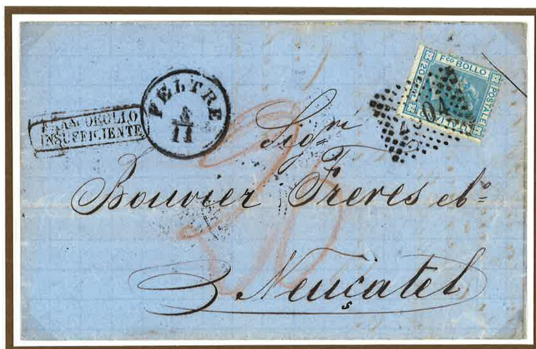
5 November 1868. Single rate letter from Feltre to Neuchâtel (Switzerland), insufficiently franked 20 centesimi and charged 20 centesimi on delivery : 40 centesimi for the unpaid letter rate decreased by the value of the insufficient franking.