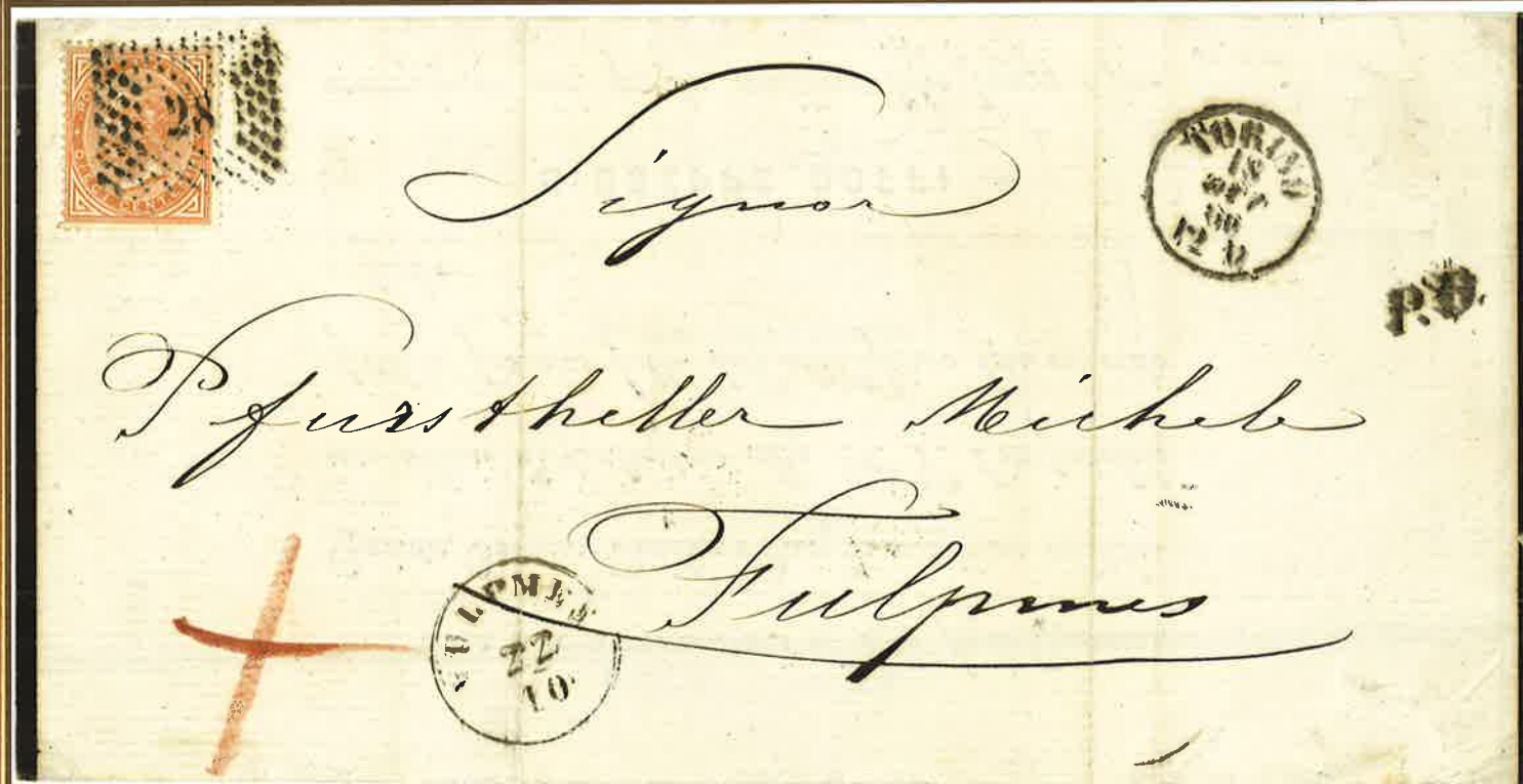
18 October 1866. Printed matter from Turin to Fulpmes (Austrian Empire), prepaid 10 centesimi to destination, carried via Switzerland, after the Chiavenna transit on 19 October and Feldkirch transit on 20 October.