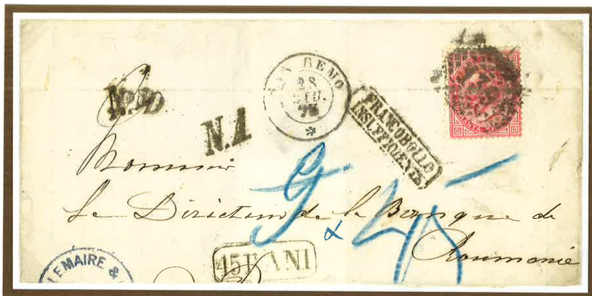
20 June 1875 . Single rate letter from San Remo (Imperia) to Romania, insufficiently prepaid 40 centesimi, as noted on the cover. The Italian Administration struck "N.A." to indicate that the Italian postal rights were paid. Austria debited Romania 9 Nkr, corresponding to 22,5 Romanian bani, 45 bani was charged on delivery

Romania up to 1878, when became fully independent, was formally part of the Ottoman Empire. Letters to Romania were mainly exchanged with the Austrian mediation. Romania joined on 1 July 1875 the GPU.