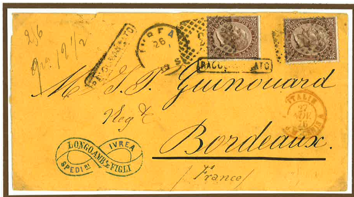
26 November 1876. Single rate registered letter from Ivrea to Bordeaux (France), prepaid 60 centesimi to destination : 30 centesimi single rate letter and 30 centesimi registration fee.