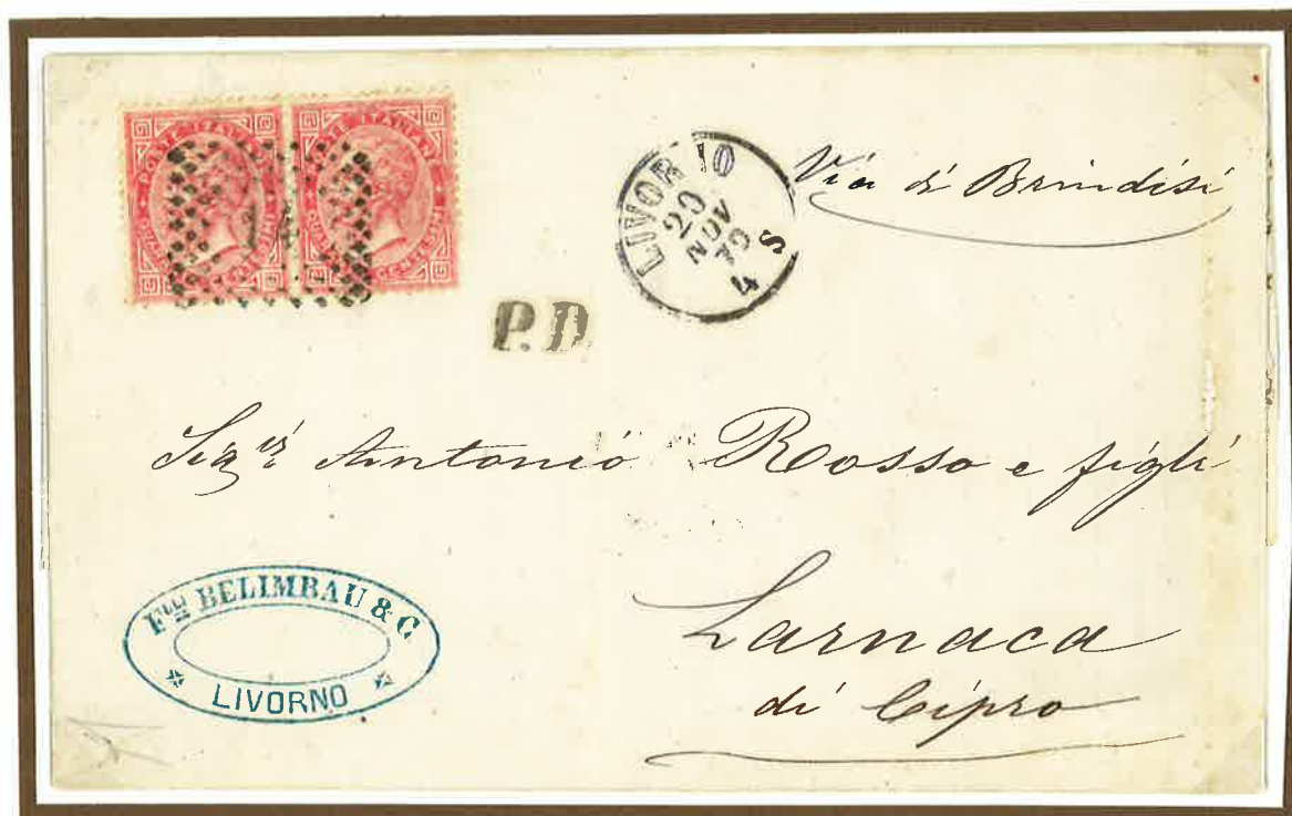
20 November 1870. Single rate letter from Leghorn to Larnaca (Cyprus, Ottoman Empire), prepaid 80 centesimi to destination. The letter was in Brindisi on 22 November placed on board of Italian packet of the Egypt Line to Alexandria and then it was embarked on a Austrian Lloyd packet of the Syria Line to destination.