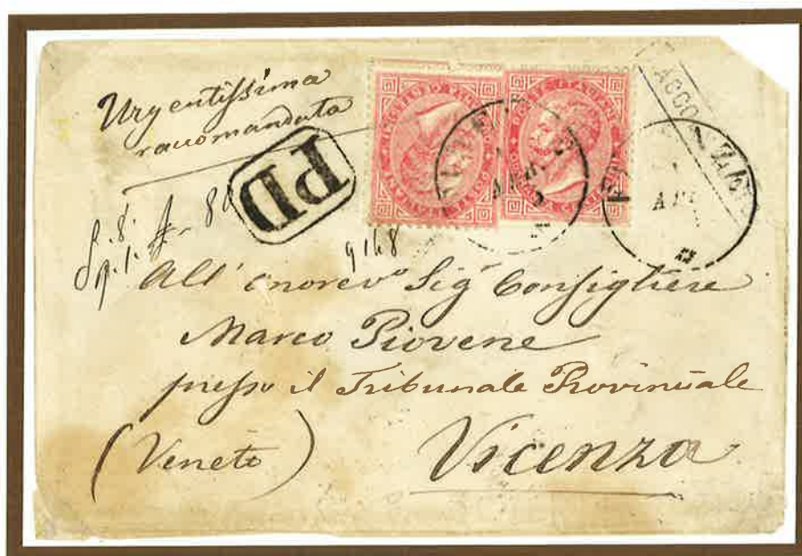
1 April 1865 . Single rate registered letter from Florence to Vicenza (Austrian Venetia), prepaid 80 centesimi to destination : 40 centesimi letter rate from the 2 nd Italian distance to the 1 st Austrian distance, 40 centesimi registration fee.