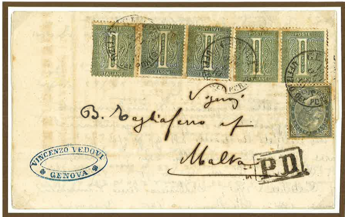
15 October 1864. Single rate printed matters from Genoa to Malta, prepaid 10 centesimi to destination. The printed matters was carried to Malta by an Italian packet of the Florio line.