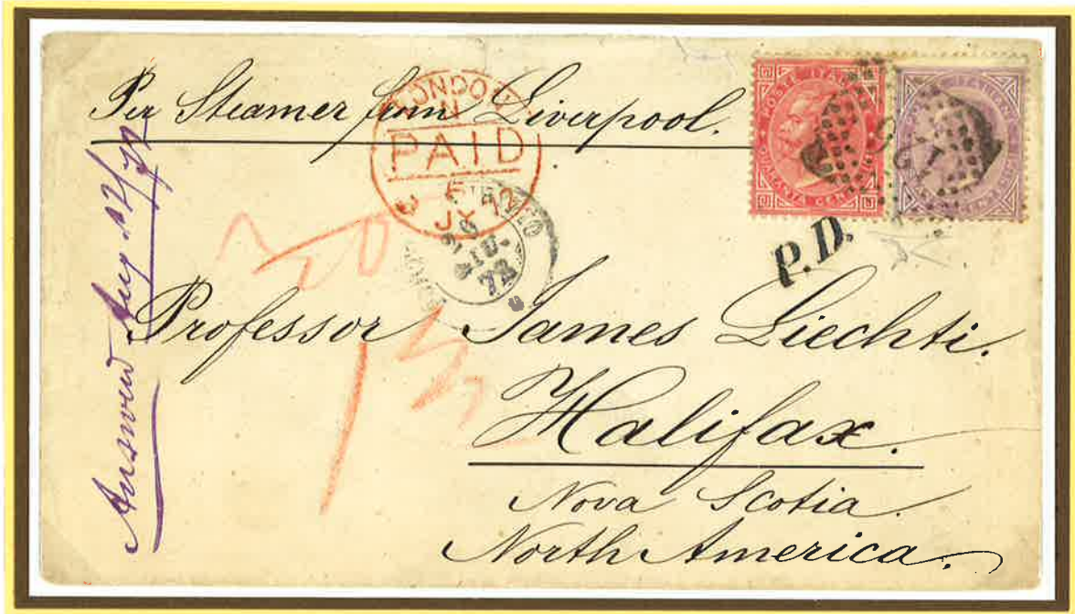
29 June 1872. Single rate letter from Porto Maurizio to Halifax (Nova Scotia), prepaid 1 Lira to destination (over franked 30 centesimi, because the rate was changed on 1 April 1872). The letter was carried in the closed mail to London and then carried to Queenstown where was embarked on a Canadian packet of the Allan Lines to Halifax.

The correspondences with the Canadian territories were exchanged with the British mediation.