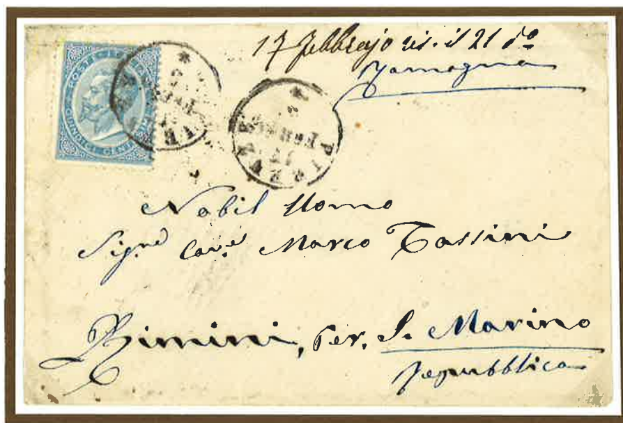
17 February 1864 . Single rate letter from Florence to San Marino prepaid 15 centesimi to destination (Italian domestic rate effective up to 31 December 1864).

Rates of letters addressed to San Marino were equal to the Italian domestic rates, this was maintained also after that San Marino signed, in 1875, the Convention with the GPU. The Italian Exchange Office with San Marino was the Italian Post Office of Rimini.