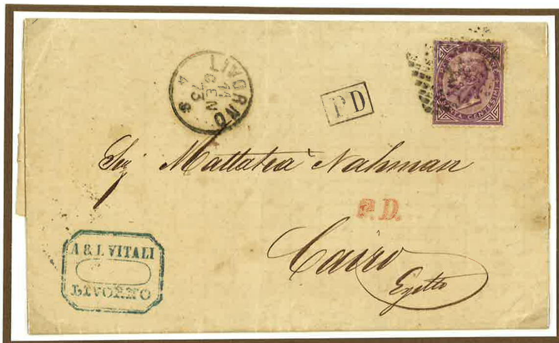
11 January 1873 . Single rate letter from Leghorn to Cairo (Egypt), prepaid 60 centesimi to destination.

The letter after the Brindisi transit on 12 January, was embarked on the Italian packet to Alexandria of Egypt, where it arrived on 16 January.