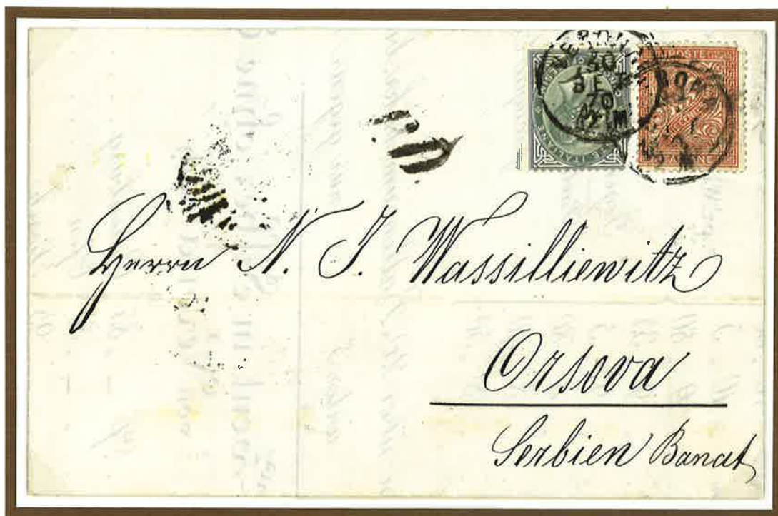
30 September 1870. Single rate printed matter from Verona to Orsova (Serbia), prepaid 7 centesimi to destination. Even though belonging to the Serbian Banat, in 1870 Orsova was part of the Austrian Empire, therefore the printed matters could have been prepaid only 5 centesimi.

Serbia became independent from the Ottoman Empire in 1867. No direct convention between the Kingdom of Italy and Serbia was in effect, therefore the letters had to be delivered with the Austrian mediation. The letter rate was set at 45 centesimi (85 para) for each 15 grams, while the printed matters rate was established in 7 centesimi (15 para) for each 40 grams.