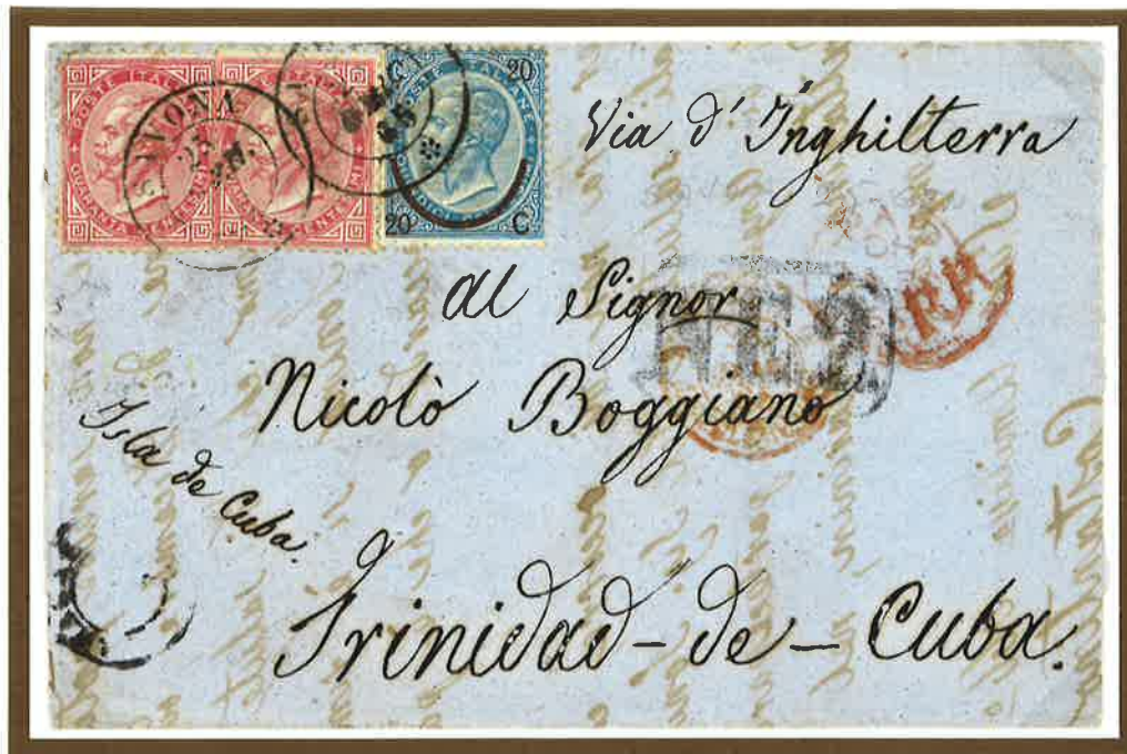
25 January 1865. Single rate letter from Savona to Trinidad de Cuba, prepaid 1 Lira to the port of disembarkation, charged 2 reales on delivery as indicated of the handstamp "NE2" (Northern Europe 2).

The letter after the Paris and London transit, was embarked on 2 February on the British packet "TASMANIAN" of the Royal Mail Steam Packet Company in Southampton and it was disembarked in St. Thomas on 17 February, in the same day it was embarked on the RMSP Company packet "EIDER" that disembarked the letter in Havana on 24 February. On the reverse the transit handstamp of Havana and the delivery datestamp of Trinidad de Cuba struck on 25 February.