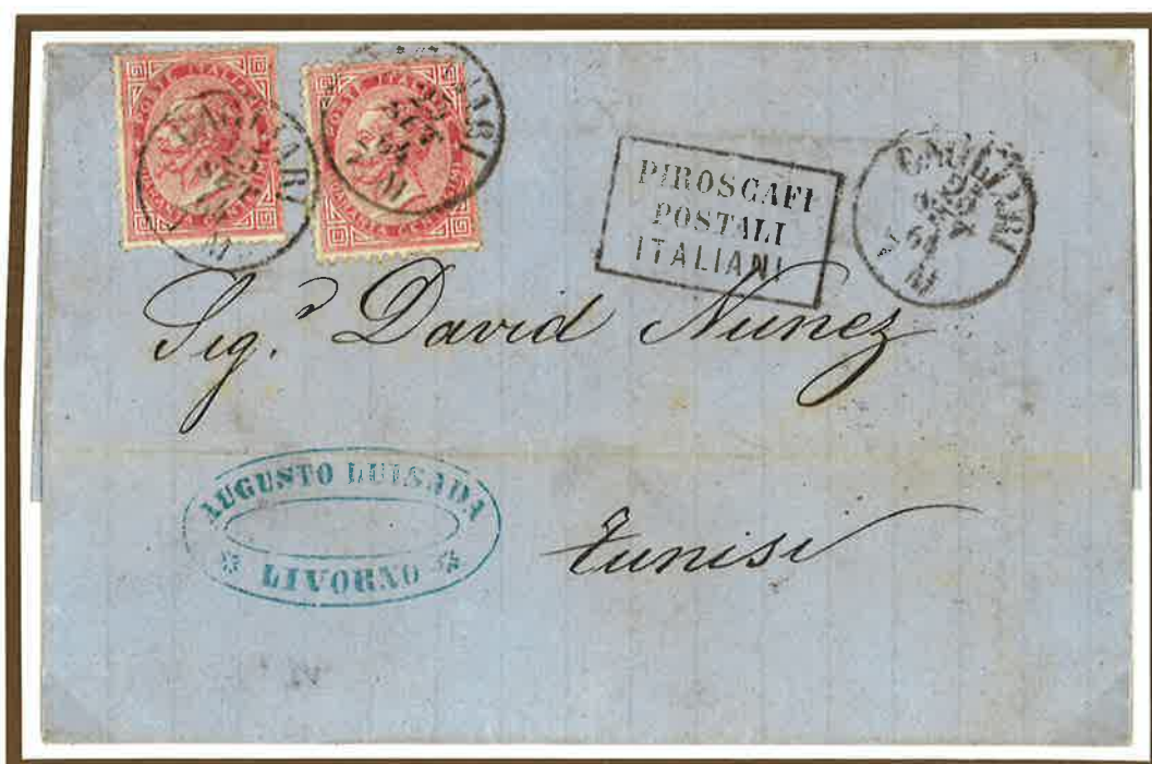
25 September 1864. Double rate letter from Cagliari to the Italian Post Office of Tunis, prepaid 80 centesimi to destination.