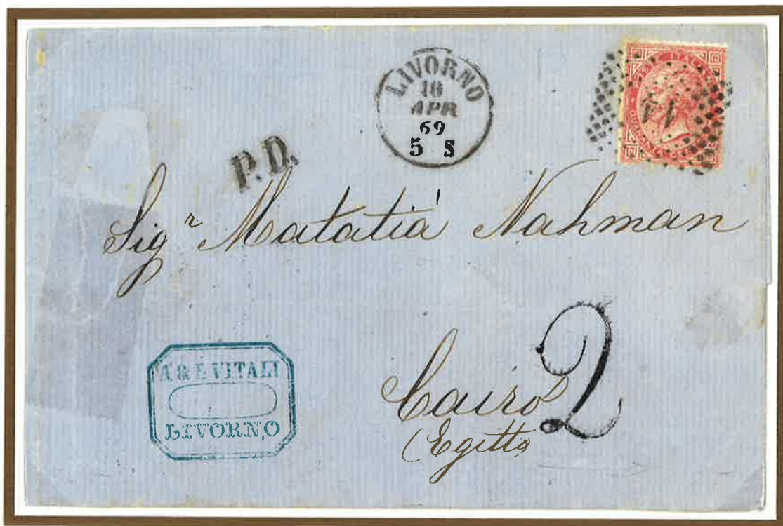
10 April 1869. Single rate letter from Leghorn to Cairo (Egypt), prepaid 40 centesimi to destination. The letter was placed on board on a packet of the Adriatic-Oriental Italian Company in Brindisi on 12 April and it was disembarked in Alexandria of Egypt on 16 April and then carried by the Vice-Royal Egyptian Postal Service to Cairo that charged 2 piaster on delivery.