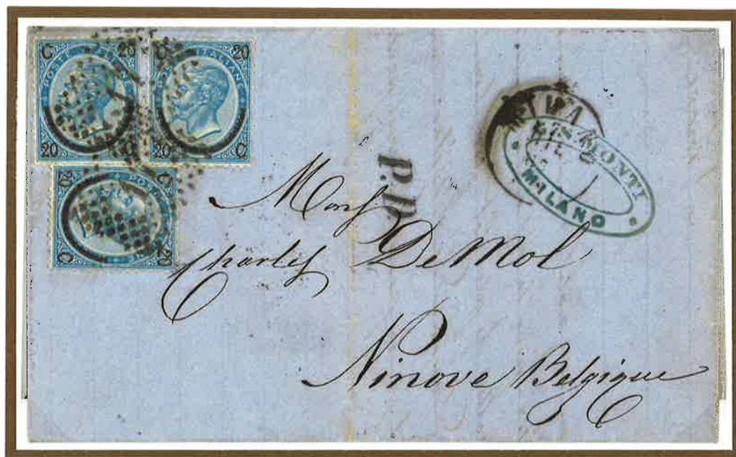
7 June 1867 . Single rate letter from Milan to Ninove (Belgium), prepaid 60 centesimi to destination. 40 centesimi would have been sufficient to prepay postage. The letter was carried in closed mail through France.

The Sardinian-Belgian Convention of 1851 was updated with effect from 1 October 1863. The updating decreased the rate of letters to 40 centesimi for each 10 grams of weight. A new Convention effective from 1 May 1871 increased the weight progression of letters to 15 grams and reduced the rates of printed matters and of the samples without value.