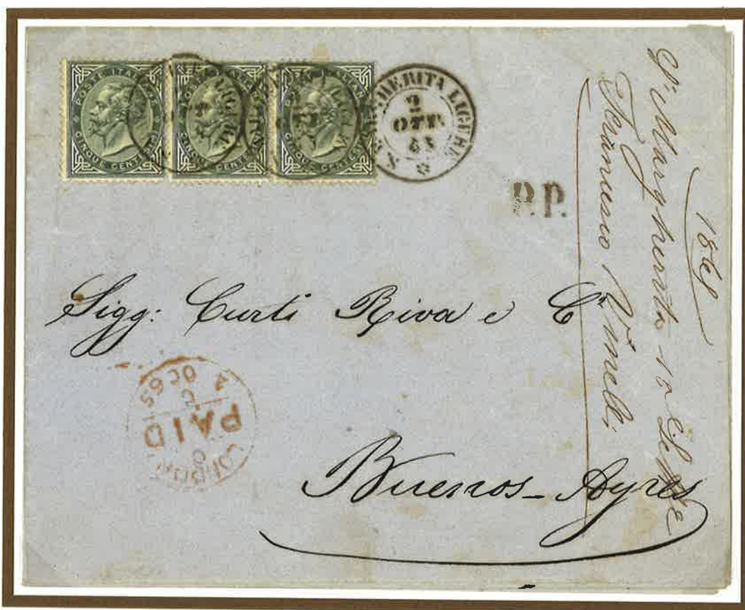
2 October 1865. Single rate printed matter from S. Margherita Ligure to Buenos Aires (Argentina), prepaid 15 centesimi to the port of disembarkation. The printed matter, with transit Genoa, was carried to London where it arrived on 5 October. In Southampton, on 9 October, the letter was placed on board on the English packet "RHONE" and it was disembarked in Buenos Aires on 13 November.