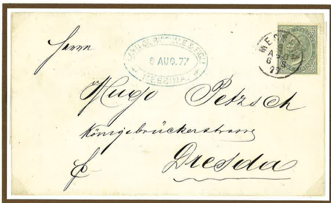
9 August 1877 . Printed matters from Messina to Dresden (German States), prepaid 5 centesimi to destination, in accordance with the rate introduced by the General Postal Union.