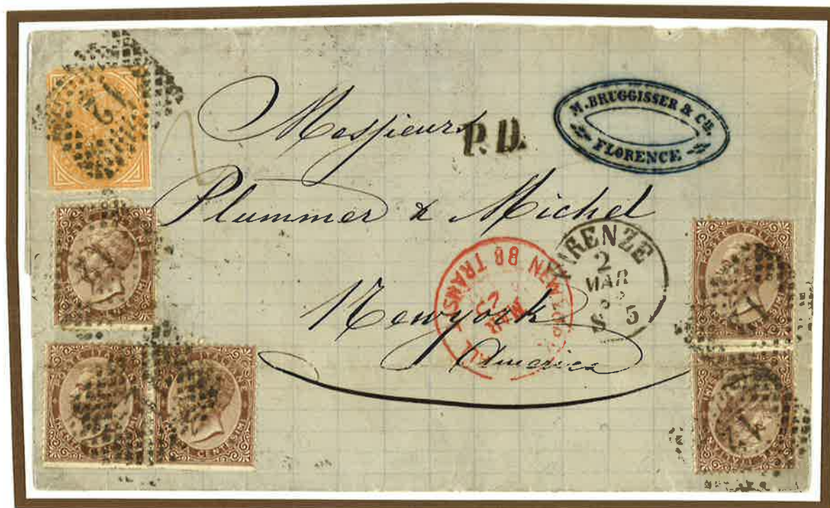
2 March 1869. Double rate letter from Florence to New York (U.S.A.), prepaid 1,60 Lire to destination. The letter transited Milan, where was prepared the closed mail bag, that after crossing the France, was embarked in Queenstown on the British packet of the Cunard Line "HECLA" that disembarked in Boston on 24 March and then carried to New York where on 25 March, the circular stamp "NEW YORK BR: TRANSIT - PAID ALL - MAR 25" was struck.