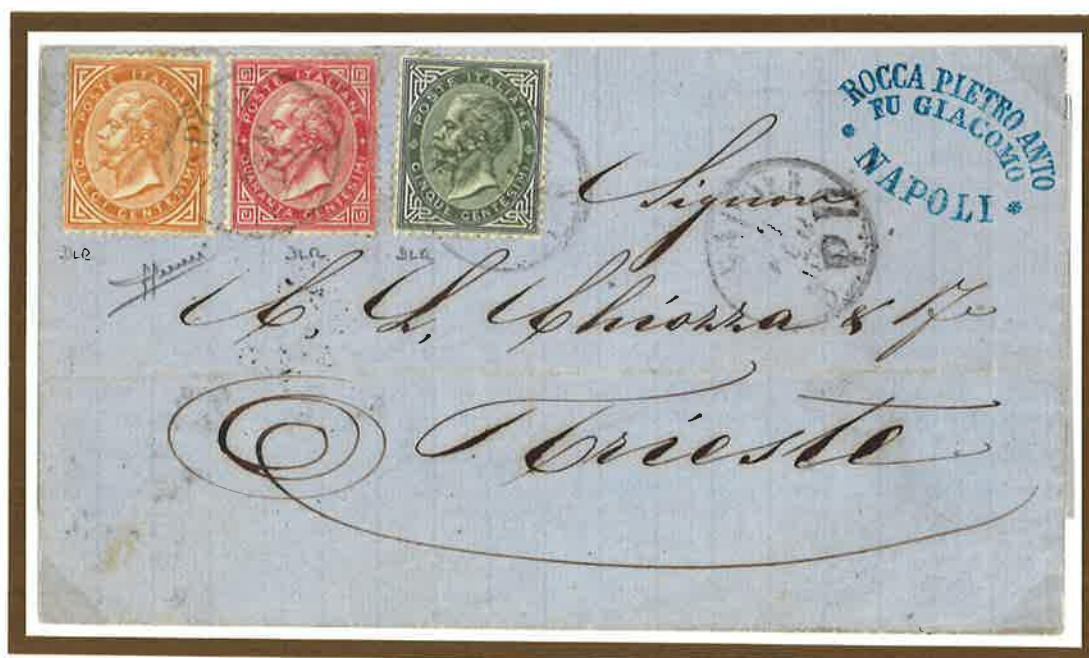
4 February 1865. Single rate letter from Naples to Trieste (Austrian Empire), prepaid 55 centesimi to destination, from the 2 nd Italian distance to the 2 nd Austrian distance.