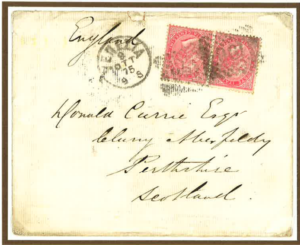
9 October 1875 . Double rate letter from Venice to Aberfeldy (United Kingdom), prepaid 80 centesimi to destination, as required for letters carried via France up to 31 December 1875.

The Convention of the General Postal Union was effective from 1 st July 1875. France joined the Convention only from 1 st January 1876. The rate of letters to the United Kingdom was reduced to 30 centesimi but when letters were carried through France the rate was 40 centesimi until 31 December 1875.