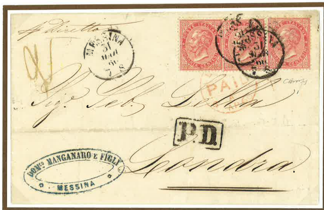
31 March 1866. Double rate letter from Messina to London (United Kingdom), where arrived on 6 April, prepaid 1,20 Lire (60 centesimi for each 7,5 grams) to destination.