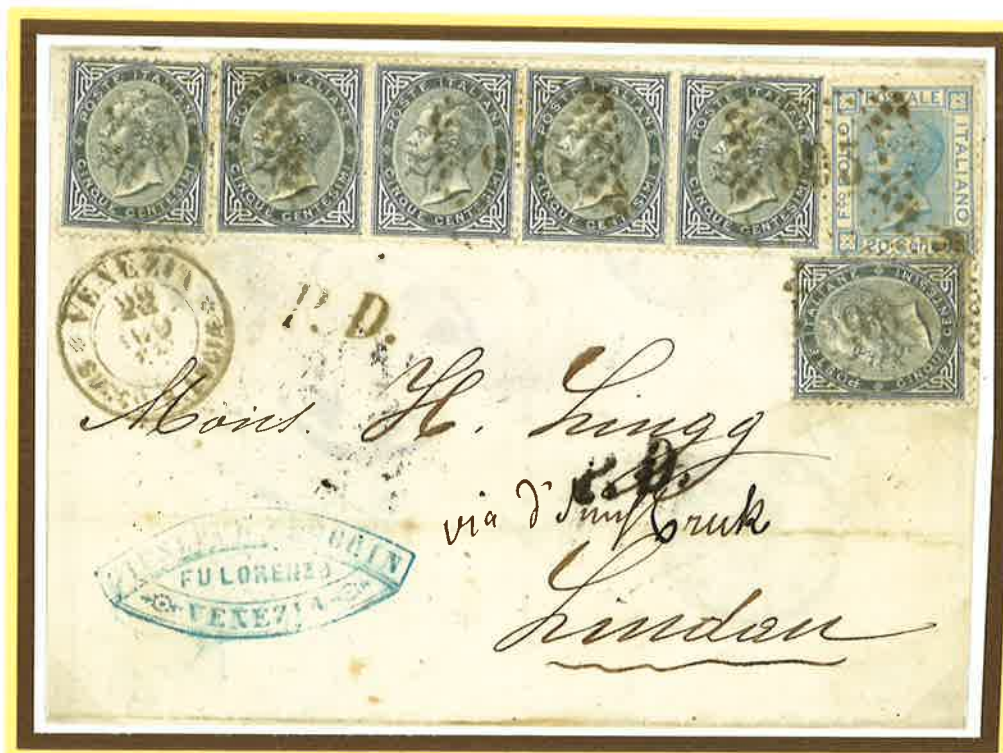
22 August 1867. Single rate letter from Venice to Lindau (Bavaria), prepaid 50 centesimi to destination, because Venice was less than 75 km distant from the Austrian border.

After the activation of the railroad through the Brenner Pass, mail to the German States was sent mainly with the Austria mediation. Up to 30 September 1867 rates were determined by the Austro-Sardinian Convention reinstated on 1862 : 50 centesimi for each 15 grams, for letters originating in Italian locations less than 75 km distant from the Austrian border, 65 centesimi for all the other Italian locations.