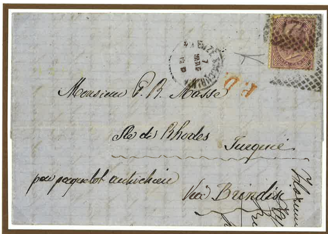
7 May 1873. Single rate letter from Florence to Rhodes (Ottoman Empire), prepaid 60 centesimi to destination. The letter was in Brindisi placed on board of Austrian Lloyd packet of the Egypt Line to Alexandria and then it was transferred to a packet of the Syria Line that reached Rhodes.

The letters sent to Rhodes in the Ottoman Empire could be carried by the Austrian packets via Brindisi and Alexandria of Egypt at the rate of 60 centesimi for each 15 grams, or with the French packets from Marseille and transit through Naples, Palermo and Messina, at a rate of 60 centesimi for each 10 grams.