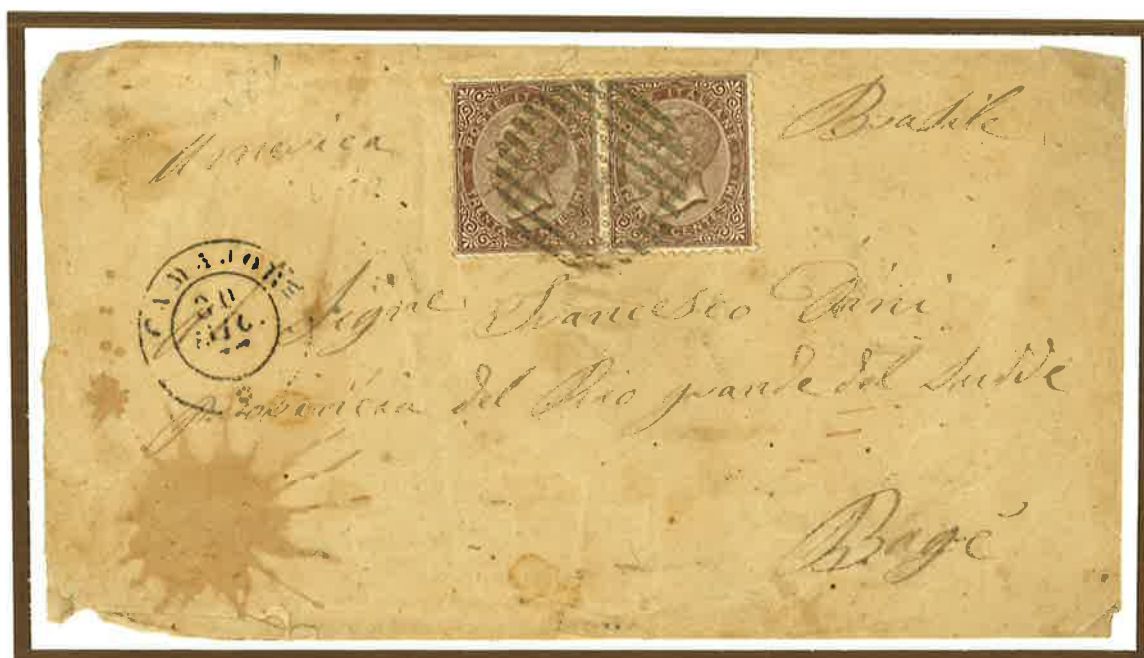
30 December 1877 . Single rate letter from Camajore (Lucca), prepaid 60 centesimi to destination. The letter, after the transit of Genoa on 31 December, was carried in a closed mail through England to Southampton, where on 9 January was embarked on the Royal Mail Steam Packet Company packet "NEVA" that disembarked it in Rio de Janeiro on 30 January 1878. The letter then carried to Bage in the region of Rio Grande do Sul (Brazil).