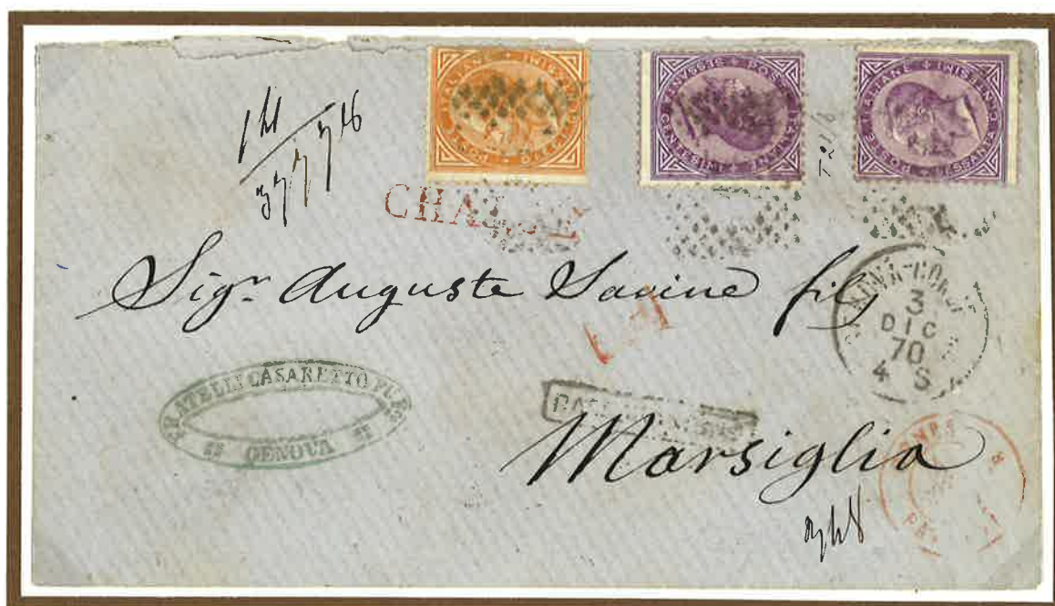
3 December 1870. Double rate registered letter from Genoa to Marseilles (France), prepaid 1,30 Lire to destination : 80 centesimi double letter rate and 50 centesimi registration fee. The letter was carried by a French packet from Genoa to Nice, where the datestamp "GENES/BAT. A VAPEUR " was struck. On the reverse the delivery datestamp of Marseille dated 5 December.