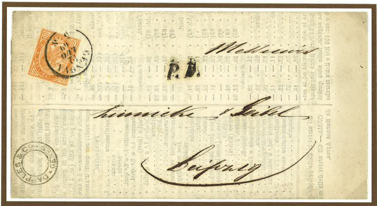
12 July 1869. Printed matters from Genoa to Leipzig (Saxony), prepaid 10 centesimi and carried in closed mail to destination, where it arrived on 14 July.