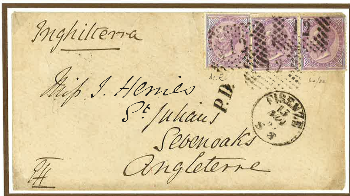
13 November 1867. Triple rate letter from Florence to Sevenoaks (United Kingdom), prepaid 1,80 Lire to destination. In Turin on 14 November, the closed bag that crossed France was prepared.