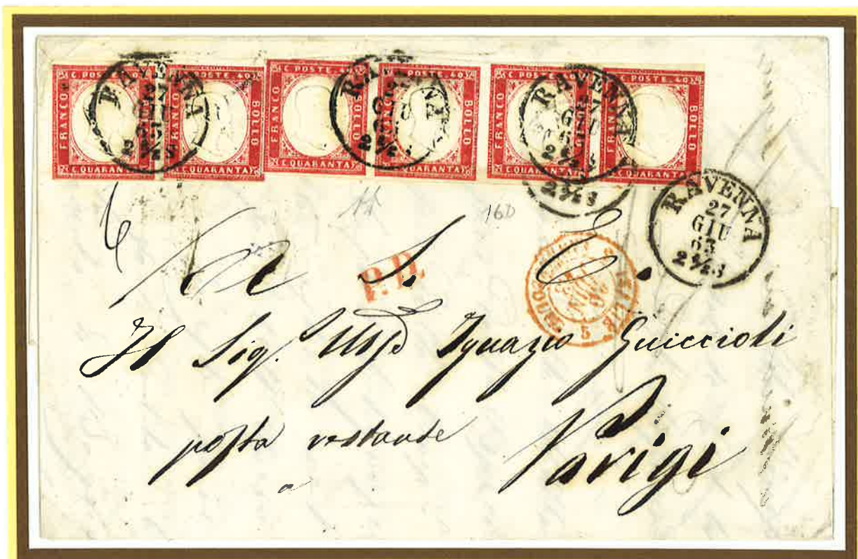
27 June 1863. Six times rate letter from Ravenna to Paris (France), prepaid 2,40 Lire to destination. The letter, after the Turin transit on 28 June, was carried in a closed mail through the Mont Cenis and arrived in Paris on 30 June, where it received the handstamp "ITALIE/5 LANSLEBOURG 5".