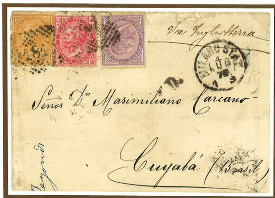
4 July 1876 . Single rate letter from Milan to Cuyabà (Brazil), prepaid 1,10 Lire to destination. The letter was carried in closed mail to Brazil through England and on 10 July it was placed on board in Southampton on the Royal Mail Steam Packet Company packet "DOURO" that disembarked the letter in Rio de Janeiro on 1 August and then it reached Cuyabà.