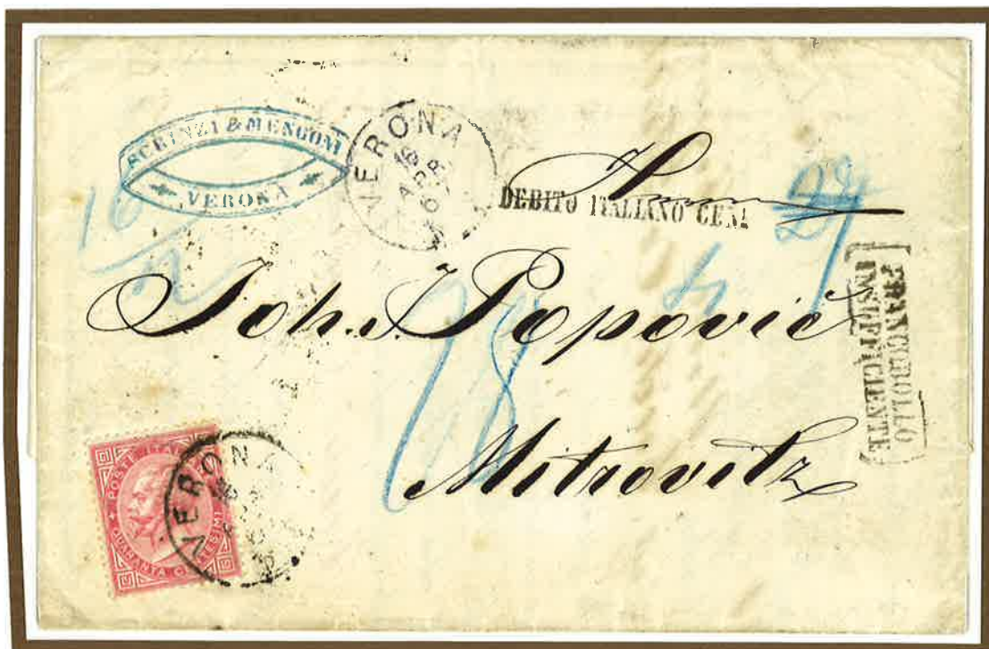
16 April 1870. Double rate letter from Verona to Mitrovitz (Serbia), insufficiently prepaid 40 centesimi. The letter, carried via Austria, resulted to be a double rate letter to Serbia then the Italian debit to Serbia was reduced to 4 centesimi (instead 27 centesimi) : 40 centesimi less 18 centesimi Italian and Serbian postage rights, that doubled to account for the double rate makes 36 centesimi. Postage due was 30 kreuzer that decreased by 2 kreuzer, corresponding to 4 centesimi, determined the 28 kreuzer charged on delivery.