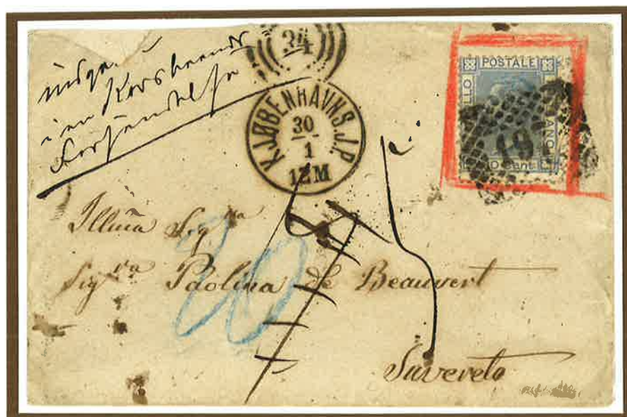
30 January 1869. Single rate letter from Copenhagen (Denmark) to Suvereto (Leghorn), prepaid 20 centesimi with a De La Rue stamp of 1867. The Italian stamp was framed with red pencil by the Danish postal Administration to indicate that it was not suitable for the franking in Denmark. The letter via Austria arrived in Verona on 3 February, where it was at first charged 70 centesimi, as required for unpaid letters, but subsequently the stamp of 20 centesimi was canceled with the numeral 197 of Verona and the taxation was reduced to 50 centesimi. With Leghorn transit the letter arrived in Suvereto on 6 February.