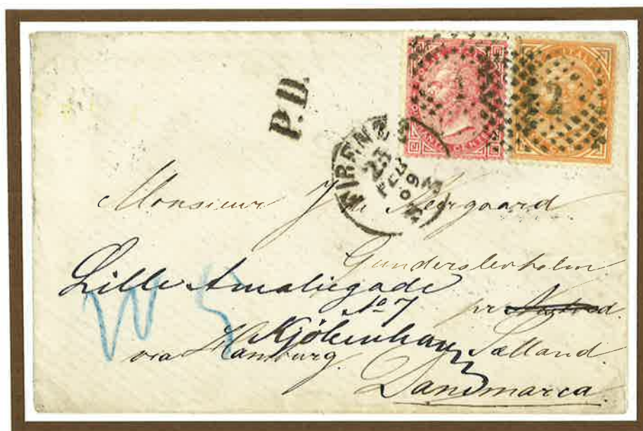
23 February 1869. Single rate letter from Florence to Copenhagen (Denmark), prepaid 50 centesimi to destination, as required by the Convention between Italy and the Austrian Empire. The letter after the Verona transit was carried in closed mail via Brennero through Austria and it arrived to Copenhagen after the Hamburg transit. The cover bears indication of the 5 rigbankskillings credited by the Union of the States of the North German to Denmark.

No direct Convention between Italy and Denmark existed, therefore letter had to be carried to destination with the mediation of a third country. The Convention between the Kingdom of Italy and the Austrian Empire effective from 1 April 1868 established a rate of 50 centesimi for each 15 grams for letters prepaid to destination and the rate of 70 centesimi for the unpaid letters.