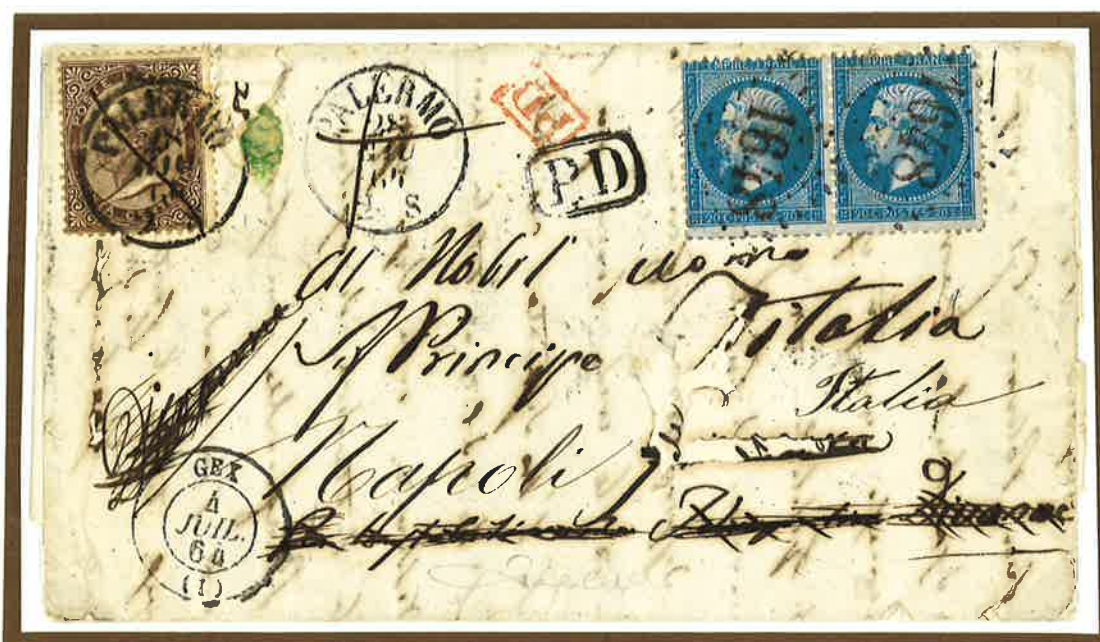
28 June 1864. Single rate letter from Palermo to a not readable Swiss location, prepaid 30 centesimi to destination. The letter was reposted in Gex (France), prepaid 40 centimes to destination in Naples