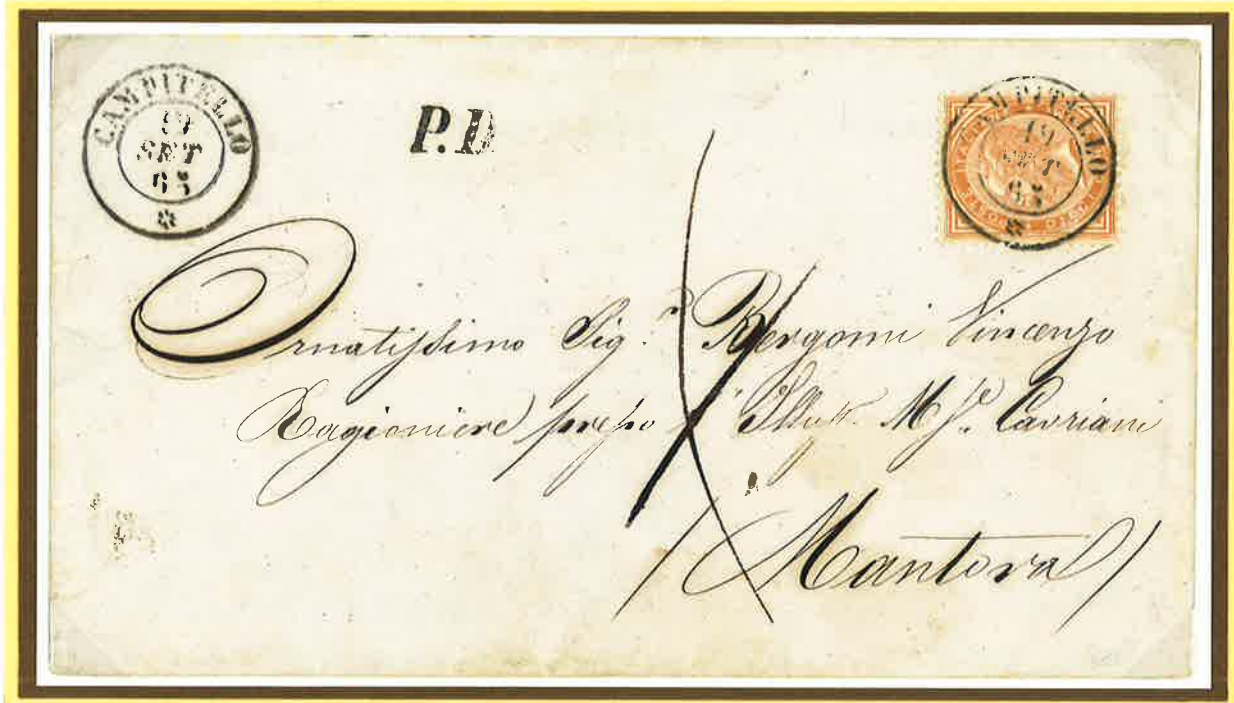
19 September 1865. Single rate letter from Campitello to Mantua (Austrian Venetia), prepaid 10 centesimi to destination, because the two locations were less than 15 km distant.

A special rate of 10 centesimi was established for the letters originating in Italian locations less than 15 km distant from the Austrian Venetia locations of destination (border zone rate).