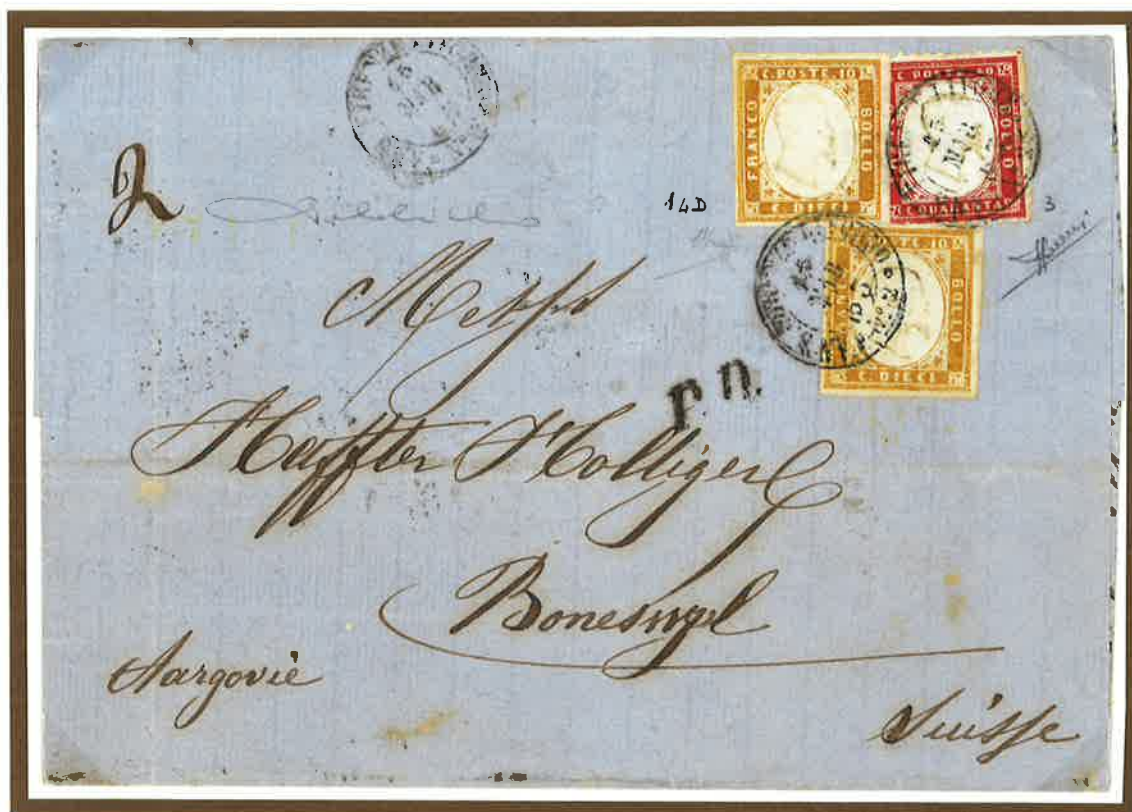
15 March 1863. Double rate letter from Signa to Boniswil (Switzerland), prepaid 60 centesimi to destination. The letter with transit Turin on 16 March, arrived to destination on 19 March.

The Italian-Swiss Convention, effective from 1 July 1862 established a rate of 30 centesimi for each 10 grams of weight.