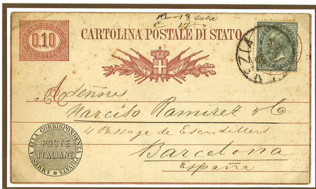
10 December 1878 . Postcard of 10 centesimi from Venice to Barcelona (Spain), with additional franking of 5 centesimi to destination, to meet the rate introduced by the General Postal Union.