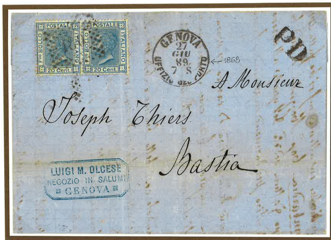
27 June 1868 . Single rate letter from Genoa to Bastia (Corsica), prepaid 40 centesimi to destination. The letter was in Leghorn placed on board a French packet and it was disembarked on 30 June in Bastia.

Letters addressed to the French Corsica were generally carried to Leghorn and then by steamer to Bastia.