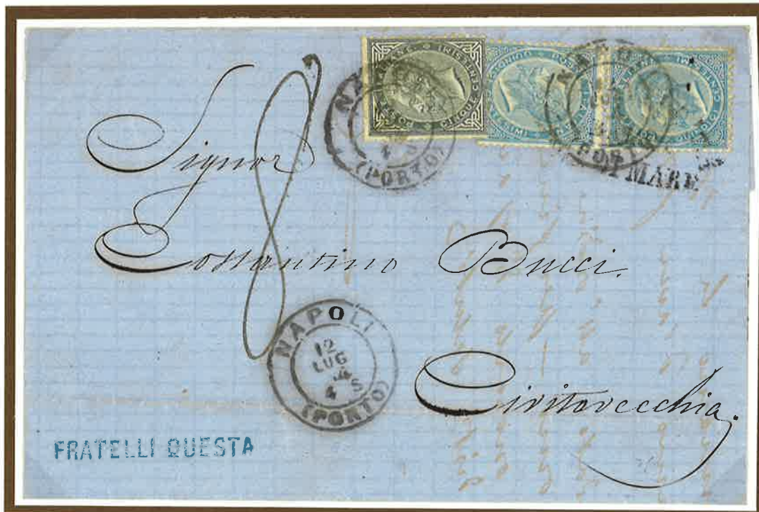
12 July 1864. Letter from Naples to Civitavecchia (Papal States), prepaid 35 centesimi (underpaid 5 centesimi) and charged 8 bajocchi on delivery. The letter embarked on 12 July on the French packet "HERMUS" of the Indirect Line of Italy, was disembarked in Civitavecchia on 13 July.