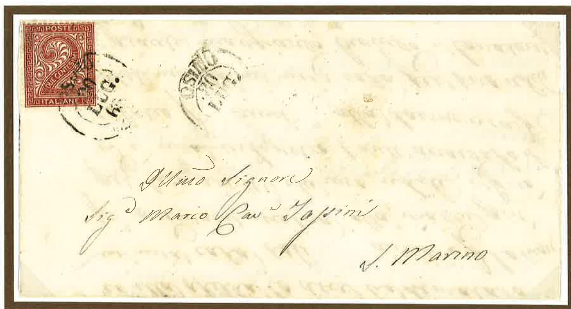
30 July 1865 . Single rate printed matters from Osimo to San Marino, prepaid 2 centesimi to destination (Italian domestic rate effective from 1 January 1863).