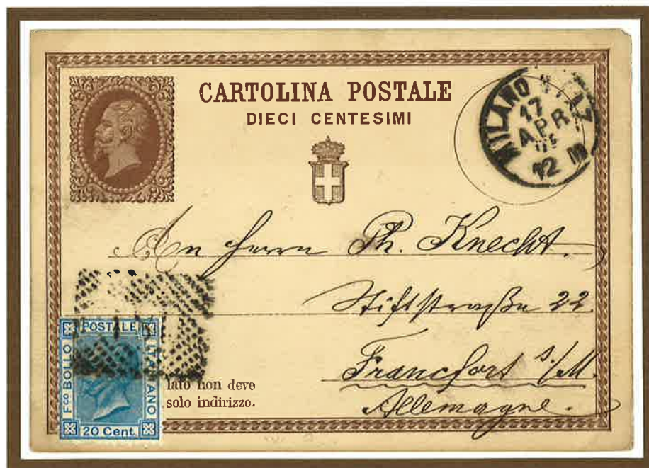
17 April 1875. Postcard of 10 centesimi with an additional franking of 20 centesimi to meet the rate to destination in effect from 1 st January 1874, carried in closed mail from Milan to Frankfurt am Main (German States),