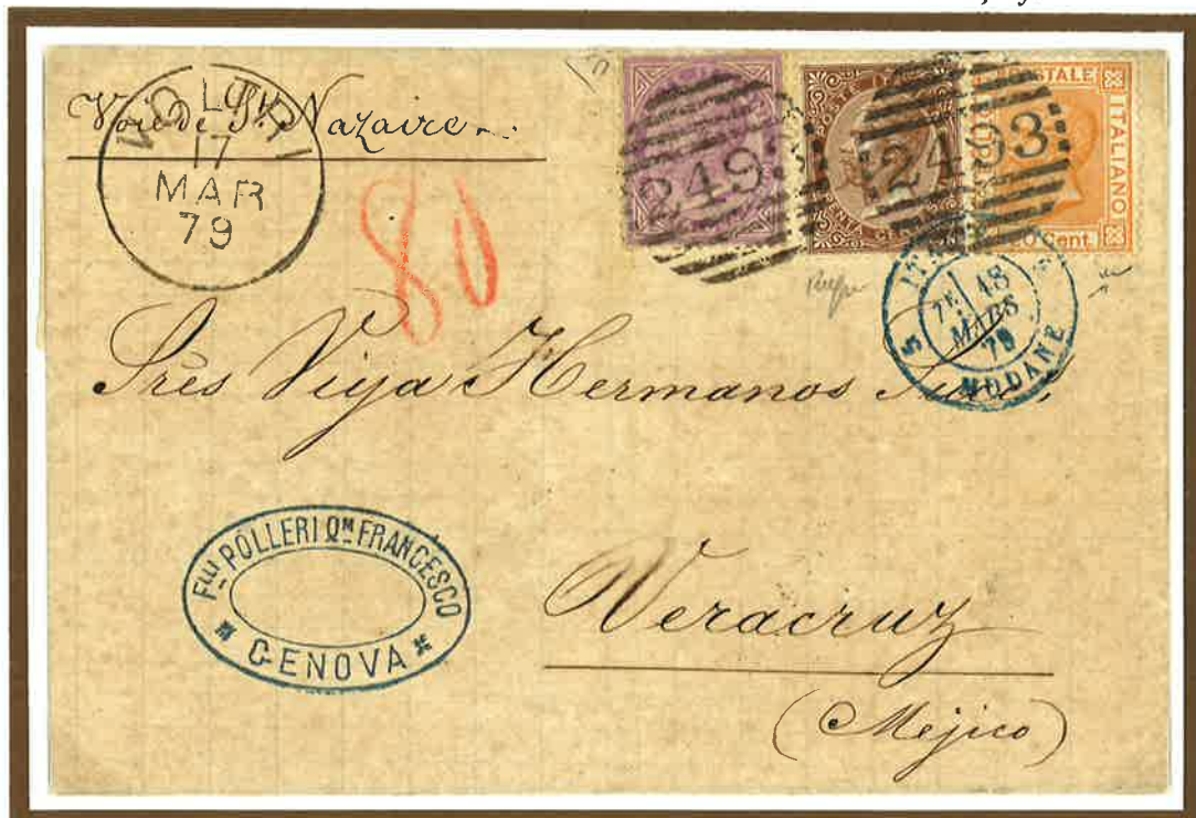
17 March 1879 . Single rate letter from Voltri (Genoa) to Vera Cruz (Mexico), prepaid 1,10 Lire to the port of disembarkation. The letter, was embarked in Saint Nazaire on 21 March on the French packet "VILLE DE ST. NAZAIRE" of the "B" Line and it was disembarked in Vera Cruz on 18 April. The covers bears indication of the 80 centesimi of the "prix de livraison" credited to France.