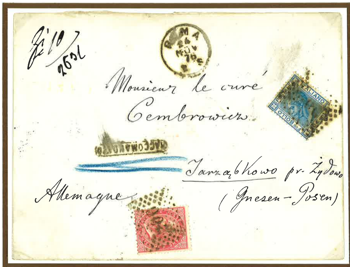
24 November 1876 . Single rate registered letter from Rome to Gnesen, in the province of Posen, at that time in Prussia, now in Poland, prepaid 60 centesimi (30 centesimi single rate letter and 30 centesimi registration fee), in accordance with the rates introduced by the General Postal Union.

The General Postal Union Convention in effect from 1 st July 1875, established in 30 centesimi the letter rate, unchanged with respect to the 1873 Convention with the German States.