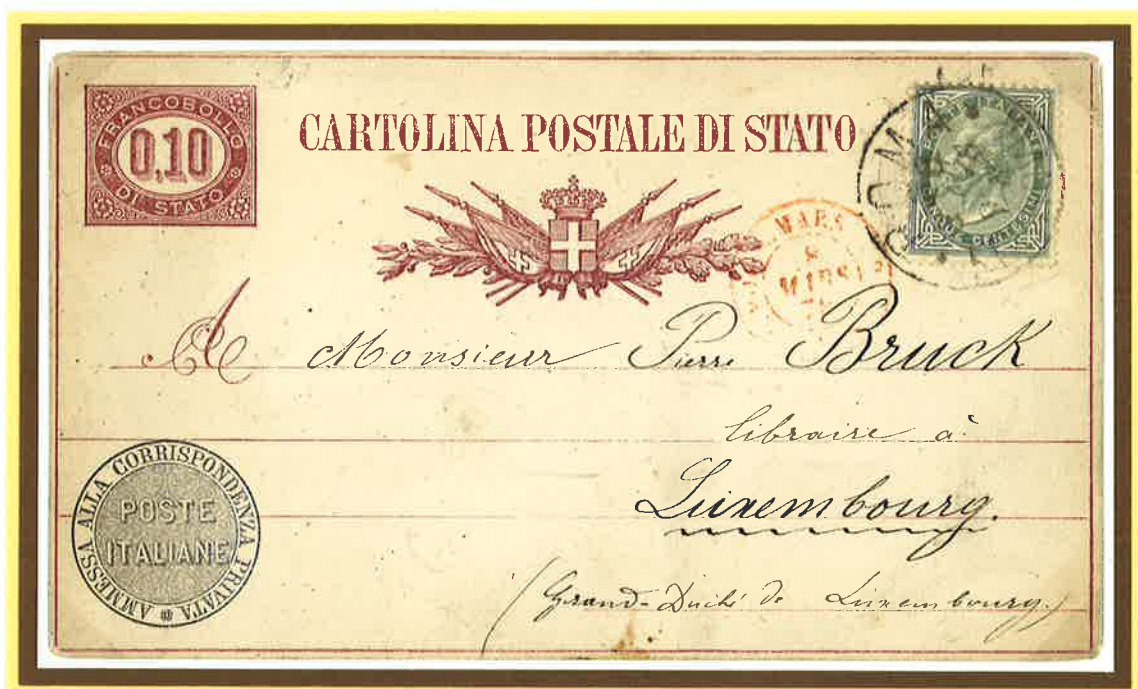
26 March 1878. Italian postcard of 10 centesimi from Rome to Luxembourg, integrated with a 5 centesimi postage stamp to match the rate of 15 centesimi to destination, introduced by the General Postal Union. The postcard was delivered in Luxembourg on 29 March 1878.

Up to 30 June 1875 when Luxembourg joined the GPU, letters could be prepaid to destination in Luxembourg with the French or the German mediation. The General Postal Union introduced a special rate for Postcard of 15 centesimi.