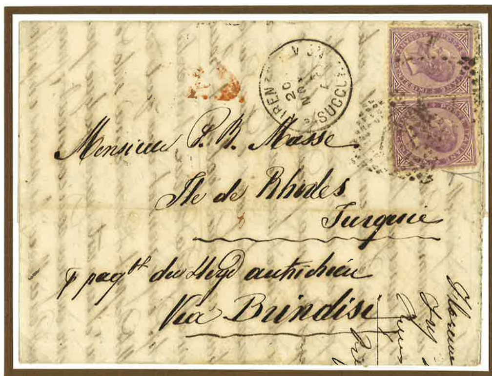
20 November 1872. Double rate letter from Florence to Rhodes (Ottoman Empire), prepaid 1,20 Lire to destination. The letter was in Brindisi placed on board of Austrian Lloyd packet of the Egypt Line to Alexandria where it was transferred to a packet of the Syria Line that reached Rhodes.