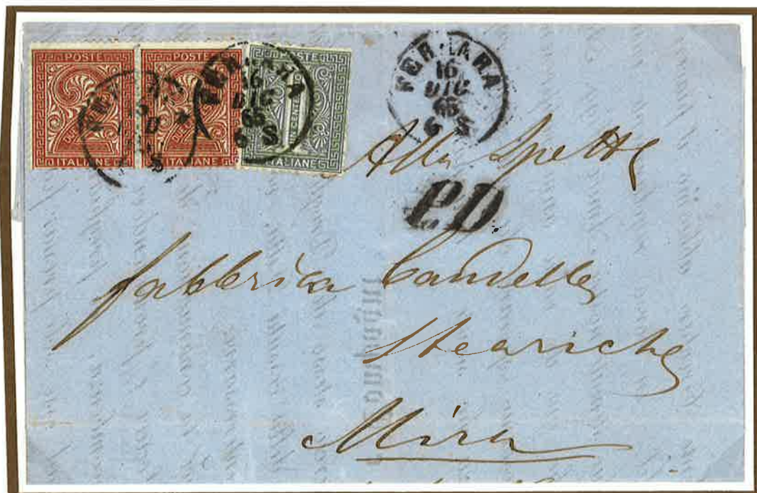
16 December 1865. Single rate printed matters from Ferrara to Mira, near Venice (Austrian Venetia), prepaid 5 centesimi to destination.

Only a few letters recorded sent to locations of the border zone.