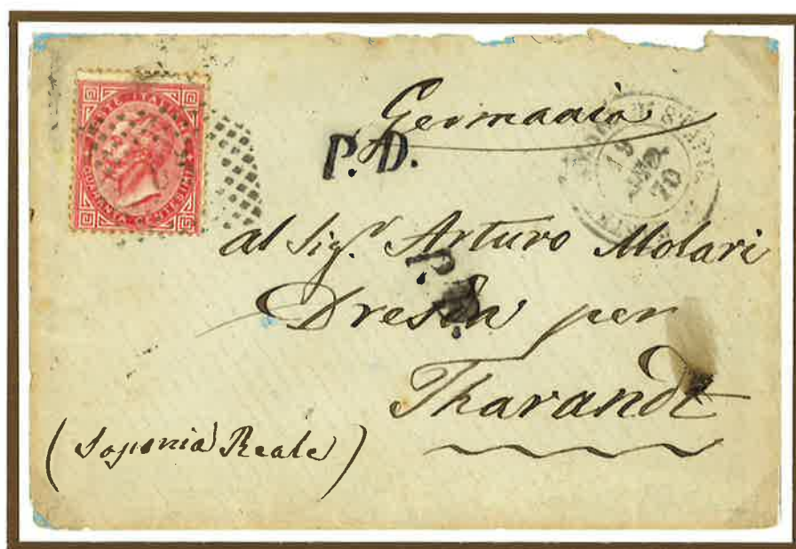
19 August 1870. Single rate letter from Castellammare to Tharandt (Saxony), prepaid 40 centesimi to destination. The letter was carried with the Austrian mediation, with transit Verona on 20 August, the letter arrived to destination on 23 August.

From 1 October 1867 the mail was carried to German States via Austrian Empire in accordance with the new Austro-Italian Convention that established a uniform rate of 40 centesimi for each 15 grams of weight.