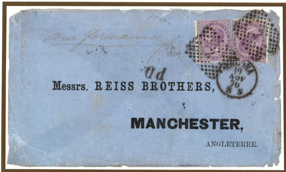
19 November 1870. Double rate letter from Ancona to Manchester (United Kingdom), prepaid 1,20 Lire (60c. x 2) to destination. The letter was carried in closed mail through Germany.