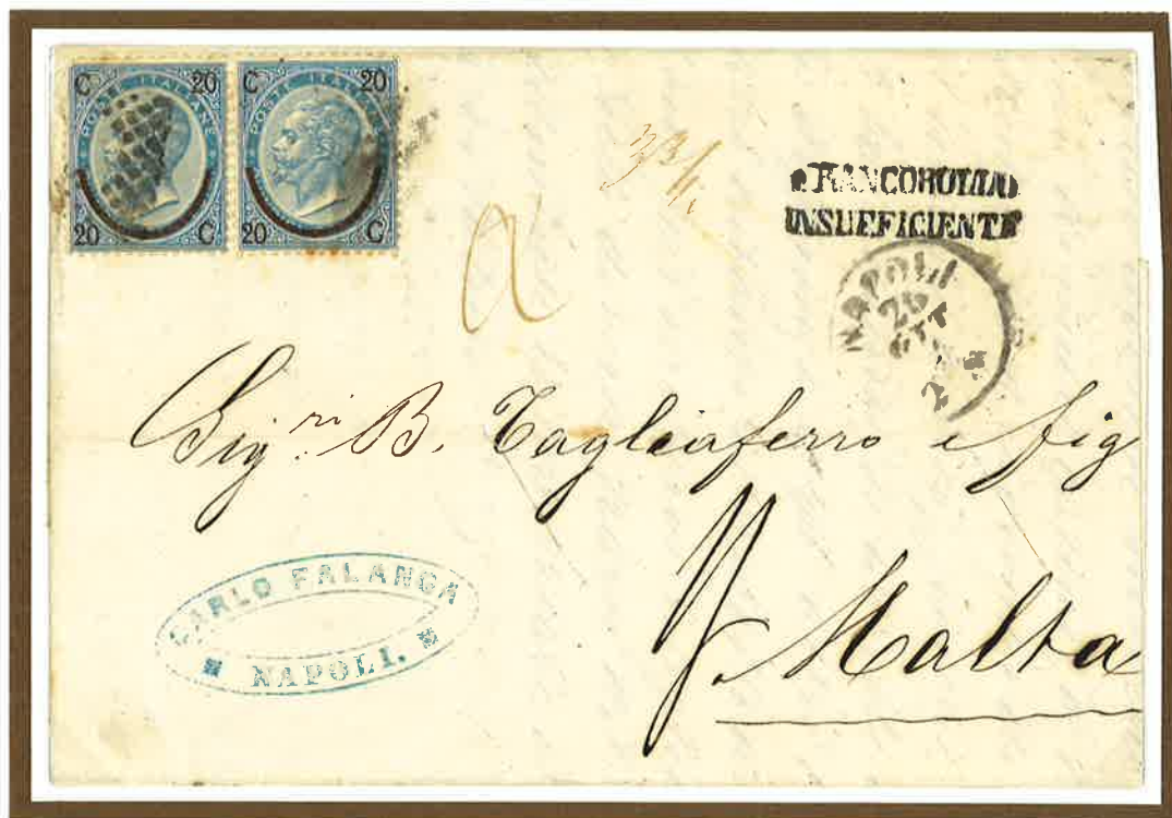
24 October 1866. Double rate letter from Naples to Malta, underpaid 40 centesimi and charged on delivery 1 shilling (pen notation). On the cover the indication of the 3 \frac{3}{4} pence debited to Malta : 2,5 pence for carriage by an Italian packet of the Florio lines, 1 \frac{1}{4} pence missing amount to complete the Italian postal rights.