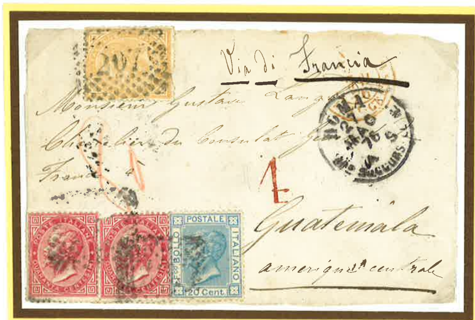
27 May 1876. Front of single rate letter (up to 15 gr.) from Rome for the Guatemala, prepaid 1,10 Lire to the port of disembarkation and charged 4 reales on delivery as required for the letter of the weight between 4 and 8 adarmes (from 7.2 to 14.4 grams). The letter was carried via France to London.

The letter was carried to St. Nazaire where it was embarked on 16 December, on the French packet "IMP.EUGENIE" of the "B" Line to Vera Cruz, that disembarked the letter in St. Thomas on 1 January 1867.