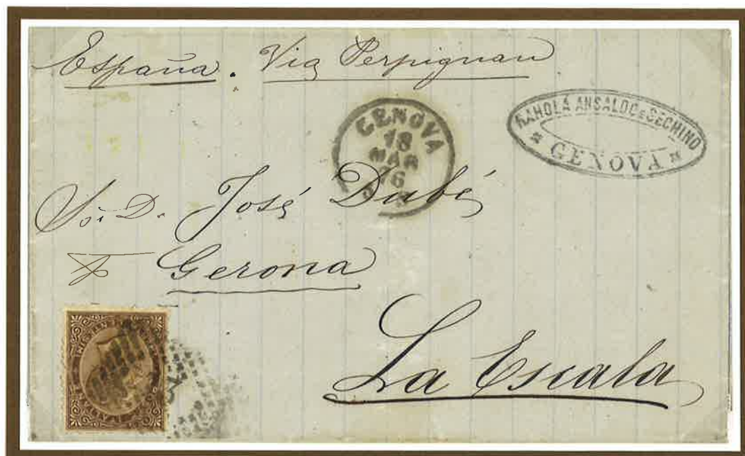
11 March 1876 . Single rate letter from Genoa to La Escala (Spain), prepaid 30 centesimi in accordance with the rate introduced by the General Postal Union.

Only from 1 st January 1876, when France joined in the General Postal Union, it was possible to extend the GPU rates to the Mail sent to Spain and Portugal.