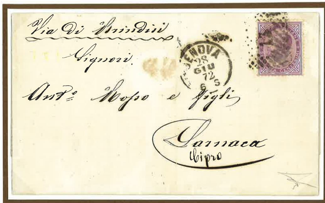
28 June 1872. Single rate letter from Genoa to Larnaca (Cyprus, Ottoman Empire), prepaid 60 centesimi to destination. The letter was in Brindisi placed on board of Austrian Lloyd packet of the Greek-Eastern Line to Smyrna and then to Cyprus by a Austrian Lloyd packet of the Syria Line.

From 1 st January 1867 the letter rate for Cyprus carried by the Austrian packet was 60 centesimi for each 15 grams of weight. From 1 st January 1870 an Italian service from Brindisi to Alexandria of Egypt was established, from Alexandria letters could be carried to Larnaca in Cyprus by the Austrian Lloyd packets at a rate of 80 centesimi for each 15 grams.