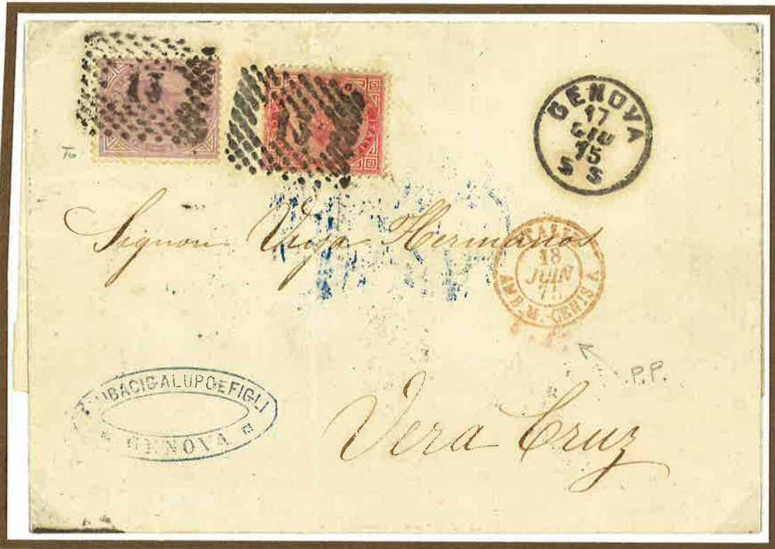
17 June 1875 . Single rate letter from Genoa to Vera Cruz (Mexico), prepaid 1 Lira to the port of disembarkation. The letter was, on 20 June in Saint Nazaire, embarked on the French packet "VILLE DE BREST" of the "B" Line and it was disembarked in Vera Cruz on 20 July.

The Franco-Italian Convention indicated in 1 Lira for each 7,5 grams, the letter rate prepaid to the port of disembarkation in Mexico, increased from 1 st January 1876 to the rate of 1,10 Lire for each 15 grams of weight. Mexico did not joined the General Postal Union, but only the Universal Postal Union on 1 st April 1879, up to that date the Franco-Italian Convention indicated a rate of 1,10 Lire, that included a "prix de livraison" to be credited to France.