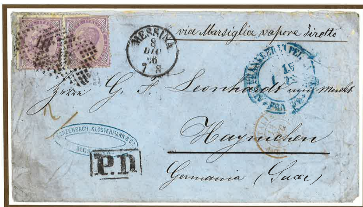
8 December 1866. Double rate letter from Messina for Saxony, prepaid 1,20 Lire to destination. The letter was placed on board the French packet "ERIDAN" of the U Levant Line and it was disembarked on 13 December in Marseille, then through Switzerland the letter arrived at destination on 16 December.