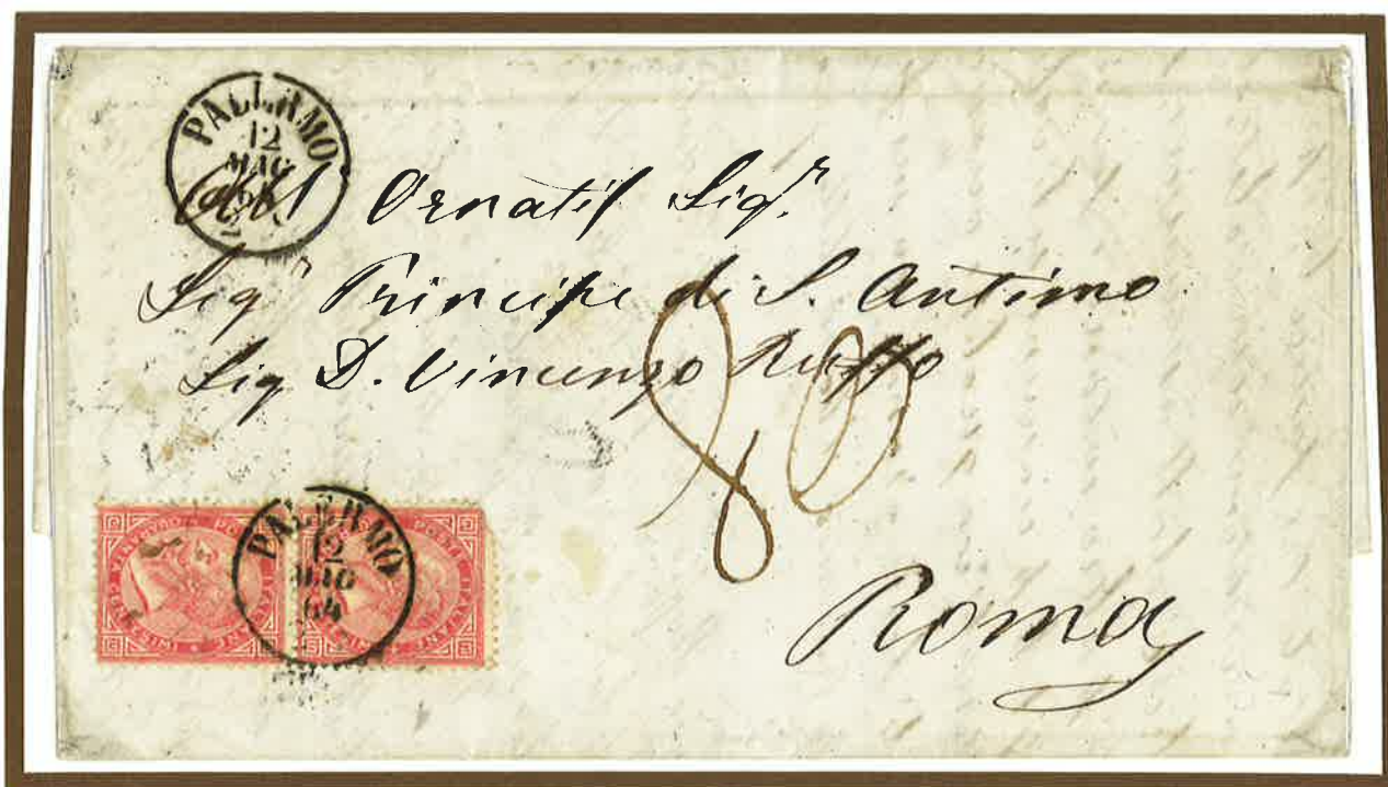
12 May 1864. Quadruple rate letter (from 30 to 40 grams) from Palermo to Rome, prepaid 80 centesimi to the Papal border. The letter was carried by sea to Naples (transit on 15 May), then overland to Rome where it was charged 80 bajocchi on delivery, 16 bajocchi for each port of 6 denari (corresponding to 7,1 grams).