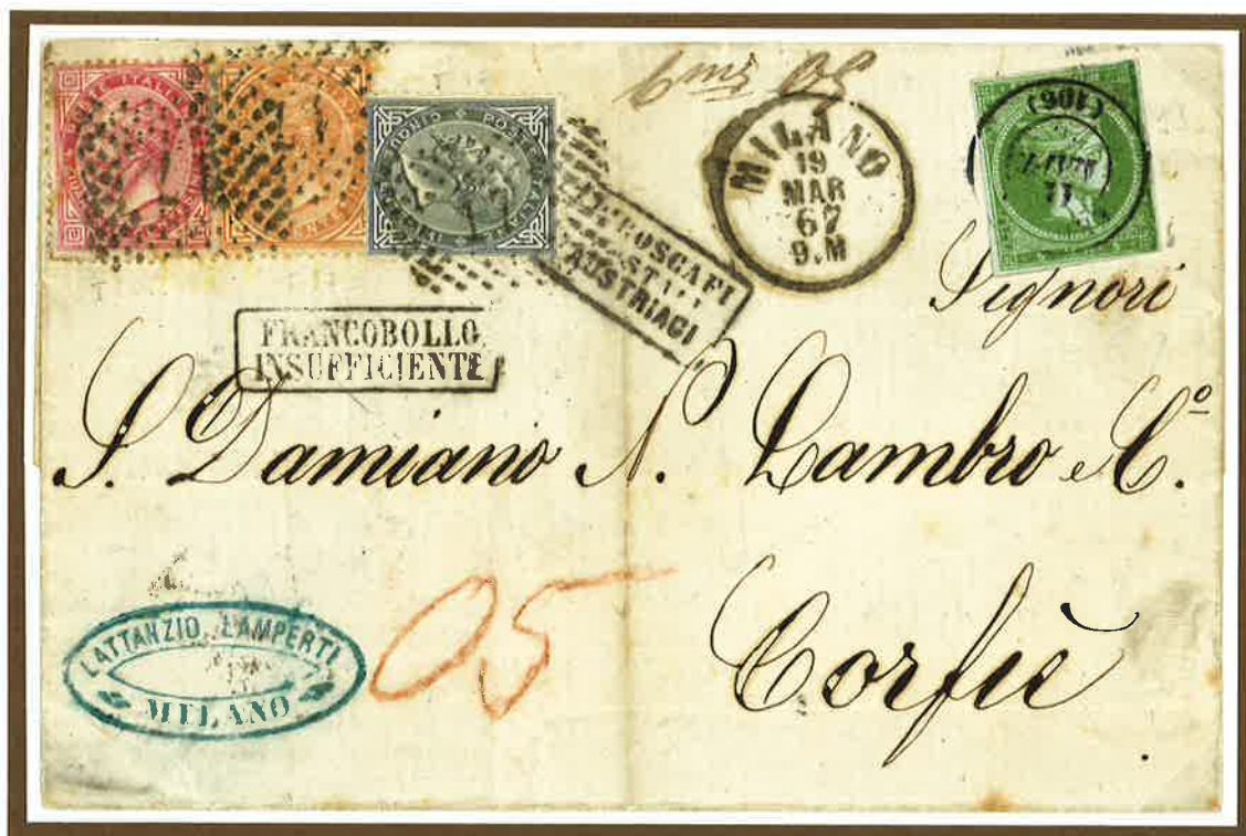
18 March 1867. Single rate letter from Milan to Corfu (Greece), insufficiently prepaid 55 centesimi. The missing amount of 5 centesimi was indicated then the letter was charged 5 lepta on delivery, as noted in red and confirmed by a 5 lepta used as a postage due stamp. The letter was carried to Corfu from Brindisi by a Austrian Lloyd packet of the Greek-Oriental line that arrived in Corfu on 23 March 1867 (11 March 1867 of the Julian calendar).

The Italian-Greek Convention allowed for the integration of the insufficient prepayment when it was indicated. Unpaid or insufficiently prepaid letters were charged on delivery in Greece the amount required to complete the franking. The missing amount was noted in red, in addition postage stamps utilized as a postage due stamp were applied for a value corresponding to this missing amount.