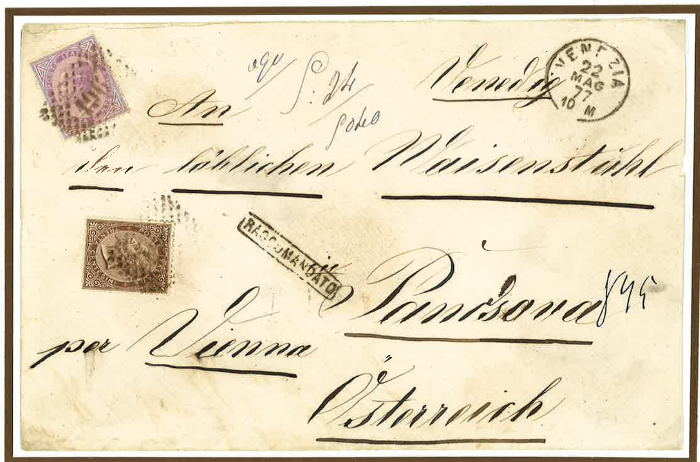
22 May 1877 . Double rate registered letter from Venice to Panisawa (Austrian Empire), prepaid 90 centesimi : 60 centesimi double rate letter and 30 centesimi registration fee.