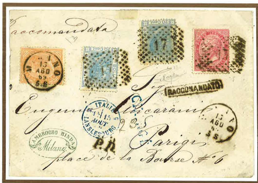
13 August 1869. Single rate registered letter from Milan to Paris (France), prepaid 90 centesimi to destination : 40 centesimi letter rate and 50 centesimi registration fee. The letter after the Turin transit, with routing Lanslebourg and Mont Cenis, arrived in Paris where the datestamp "ITALIE/ 5 LANSLEBOURG 5" was struck.

The fixed registration fee was set, by the 1861 Franco-Italian Convention, in 50 centesimi.