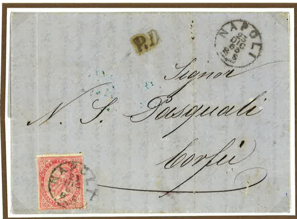
23 December 1863. Single rate letter from Naples to Corfu (Ionian Island), prepaid 40 centesimi to destination. The letter was carried via Messina (transit datestamp on 30 December) with an Italian packet of the Accossato e Peirano Company, that disembarked it in the port of Corfu on 1 January 1864.