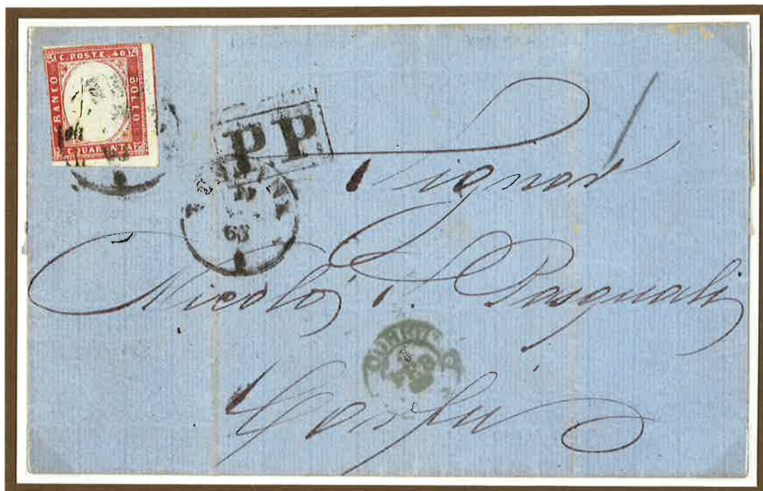
29 January 1863. Single rate letter from Messina to Corfu (Ionian Island), prepaid 40 centesimi to the port of disembarkation, charged 1 penny on delivery for the domestic rate.

Up to April 1863, the Italian packet of the Ancona-Alexandria of Egypt Line carried letters paid to the port of disembarkation of Corfu at a rate of 40 centesimi for each port of 7,5 grams. From 1 st May 1863 the Italian-Ionian Islands Convention indicated a rate of 40 centesimi for each port of 7,5 grams. With the annexation of the Ionian Islands to Greece, from 1 st February 1865, Italian-Greek Convention was extended to the Ionian Island.