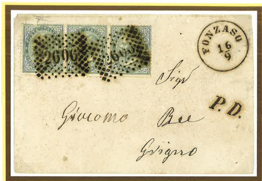
16 September 1871 . Single rate letter from Fonzaso near Belluno to Grigno (Austrian Empire), prepaid 15 centesimi to destination because origin and destination were less than 30 km distant.

The 1867 Convention allowed for the sending of insured letters with declared value. Insured letters, in addition to the registration fee, had to pay 25 centesimi each 100 lire or fraction of the declared value, up to a maximum of 3,000 lire. These conditions for the insured letters applied also after the introduction of the GPU rates in 1875.