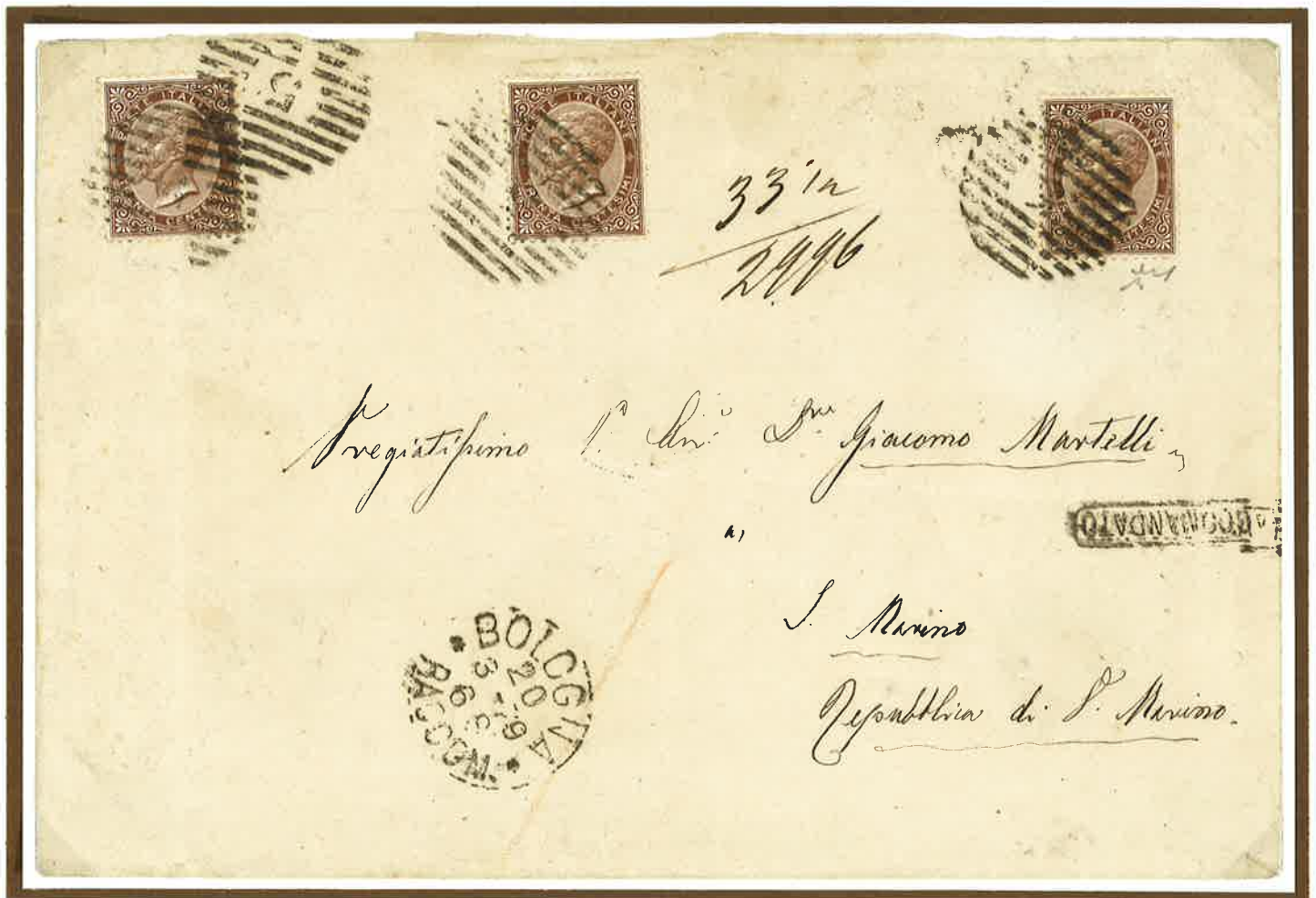
20 March 1879. Triple rate registered letter from Bologna to San Marino, prepaid 90 centesimi to destination (20 centesimi for each 15 grams and 30 centesimi registration fee).