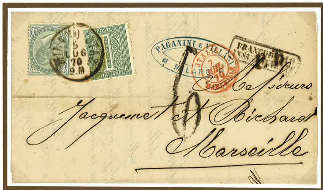
5 July 1870. Single rate letter from Milan to Marseille (France), insufficiently prepaid only 6 centesimi as a single rate printed matter. The letter was charged 6 décimes on delivery, as required for unpaid letters, because it contains an handwritten text.