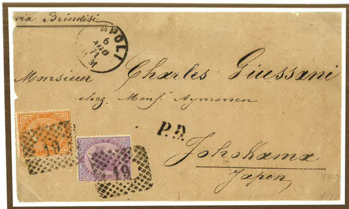
6 August 1871. Front of single rate letter from Naples to Yokohama, prepaid 70 centesimi to destination.

Letters were carried to Japan with the British mediation at a rate of 70 centesimi for each 15 grams. From 1 June 1877 Japan entered in the General Postal Union, the letter rate was set at 60 centesimi for each 15 gr.