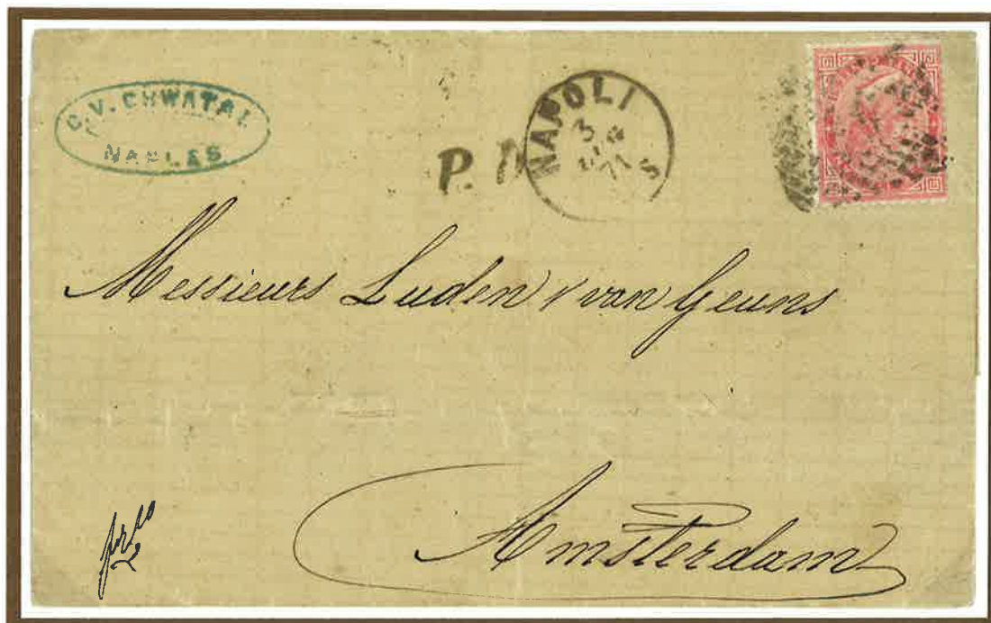
3 July 1871. Single rate letter from Naples to Amsterdam, prepaid 40 centesimi to destination. The letter was sent to Verona where on 5 July was prepared the closed mail to The Netherlands, that, through the Brenner Pass, arrived in Amsterdam on 7 July.

From 16 July 1870, Mail to the Netherlands could also be sent with the Austrian mediation that was cheaper than the French mediation.