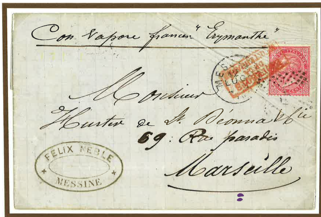
12 July 1875. Single rate letter from Messina to Marseille, prepaid 40 centesimi to destination. The letter was embarked on 12 July on the French packet "ERYMANTHE" of the Line of Syria, and it was disembarked in Marseille on 16 July.

The General Postal Union postal convention was effective 1 st July 1875, France joined only from 1 st January 1876. The rate of letters remained unchanged until 31 December 1875, the rate was reduced to 30 centesimi since 1 st January 1876.