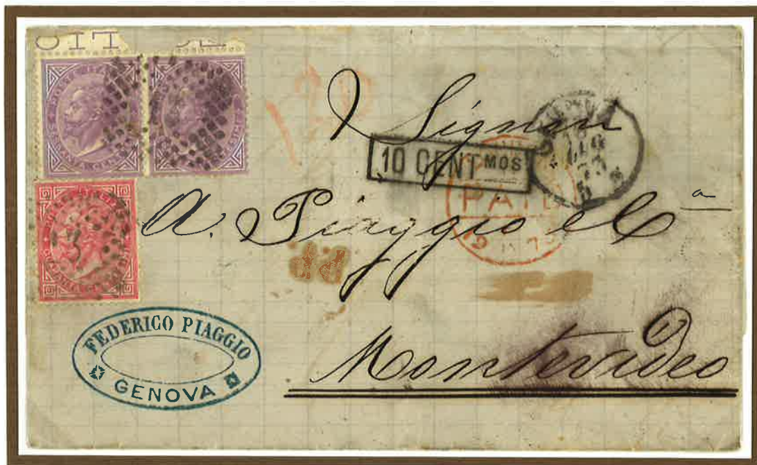
16 July 1873 . Single rate letter from Genoa to Montevideo (Uruguay), prepaid 1,60 Lire to the port of disembarkation and charged 10 centèsimos on delivery for the Uruguayan domestic rate. The letter, carried in closed mail through the France, with transit London, was embarked in Southampton on 9 August on the RMSP Company packet "NEVA" that disembarked the letter in Montevideo on 5 September.

Letters to Uruguay were carried with the English mediation at the rate of 1,60 Lire for each 15 grams of weight, decreased from 1 st July 1875 to the rate of 1,40 Lire.