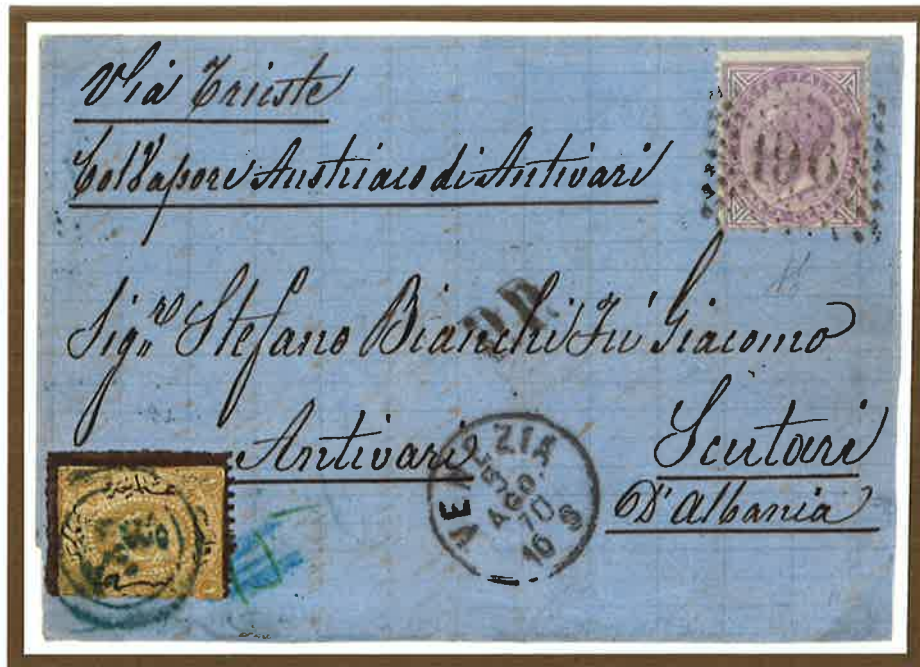
5 August 1870 . Single rate letter from Venice to Shkoder of Albania (Turkey) prepaid 60 centesimi to the disembarkation port of Antivari and charged 2 piaster on delivery in Shkoder. The letter was on 6 August embarked in Trieste on an Austrian Lloyd packet and it was disembarked in Antivari.