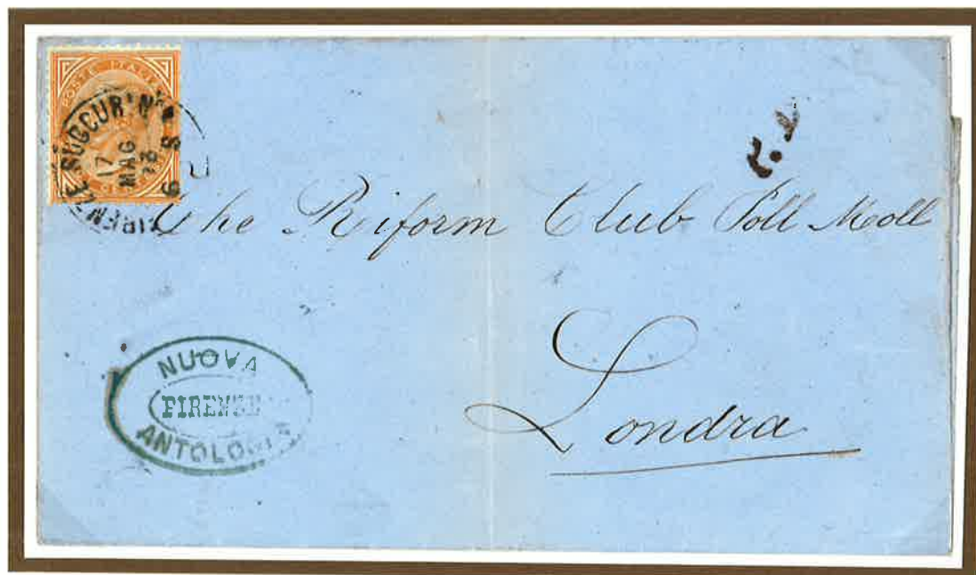
17 May 1873. Single rate printed matters sent in closed mail from Florence to London (United Kingdom), prepaid 10 centesimi to destination.