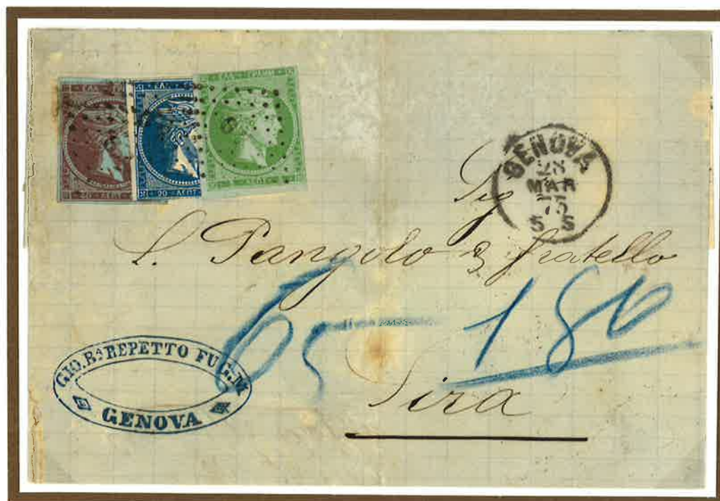
28 March 1873. Single rate unpaid letter from Genoa to Syra (Greece), charged 65 lepta on delivery, as noted in bleu and confirmed by 65 lepta used as a postage due stamp. The letter was carried to Syra from Brindisin by a Austrian Lloyd packet of the Greek-Oriental line that arrived in Syra on 2 April 1873 (21 March of the Julian calendar).