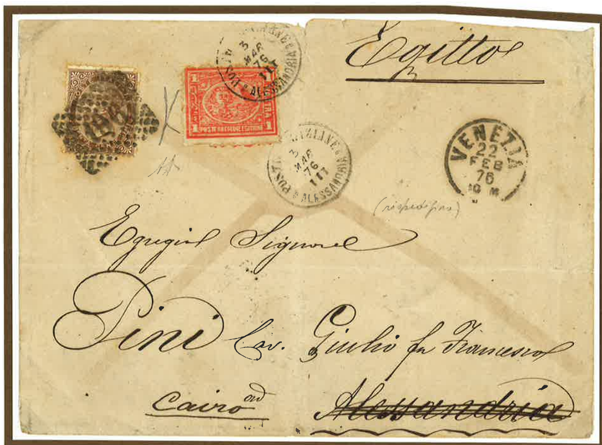
22 February 1876 . Single rate letter from Venice to Alexandria of Egypt, prepaid 30 centesimi to destination, in accordance with the rate introduced by the General Postal Union, effective from 1 st January 1876.

The letter was then delivered to Cairo, by the Vice-Royal Egyptian Postal Service that charged 1 piaster on delivery.