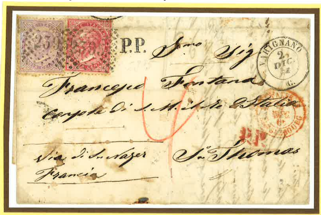
2 December 1866. Single rate letter from Varignano, near La Spezia to St. Thomas (Danish West Indies), prepaid 1 Lira to the port of disembarkation.

The Mail to St. Thomas were mainly carried with the English or the French mediation at a letter rate of 1 Lira for each 7,5 grams of weight. The Mail with Guatemala, were exchanged with the English and French mediation, with the British packets from Southampton or with the French packets from Saint Nazaire.