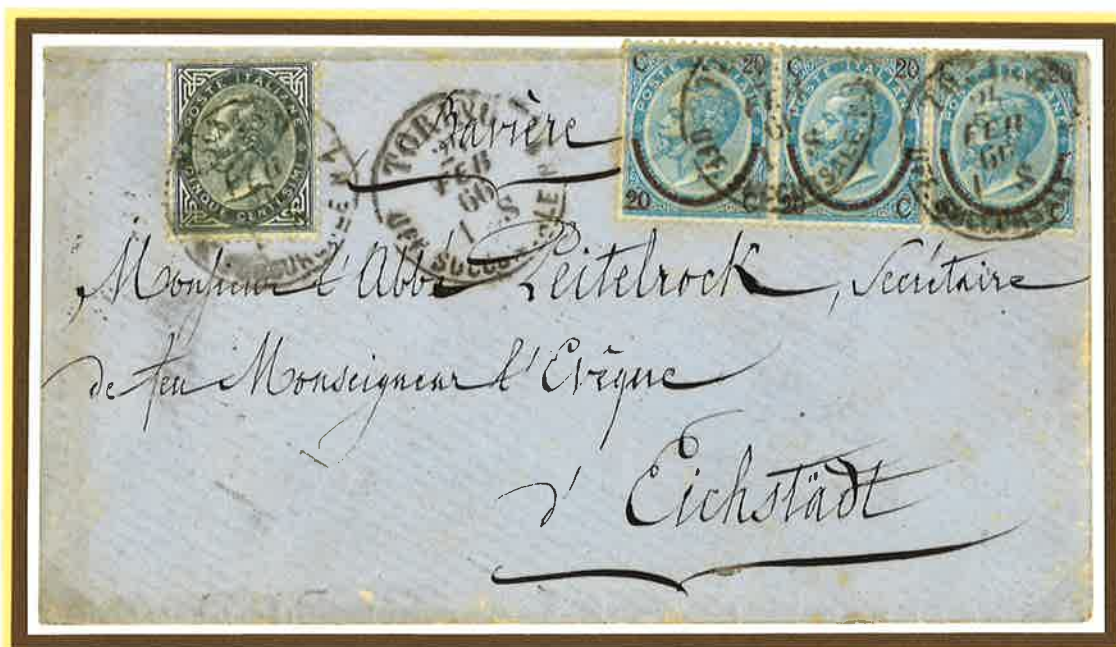
24 Februar 1866. Single rate letter from Turin to Eichstadt (Bavaria), prepaid 65 centesimi to destination, because Turin was more than 75 km distant from the Austrian border.