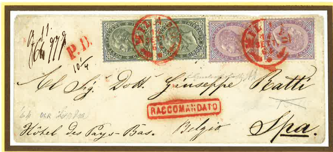
14 September 1864 . Double rate registered letter from Milan to Spa (Belgium), prepaid 1,30 Lire to destination (80 centesimi double rate letter and 50 centesimi registration fee). The letter, after the Turin transit, where was prepared the closed bag to Belgium, arrived in Spa on 17 September.