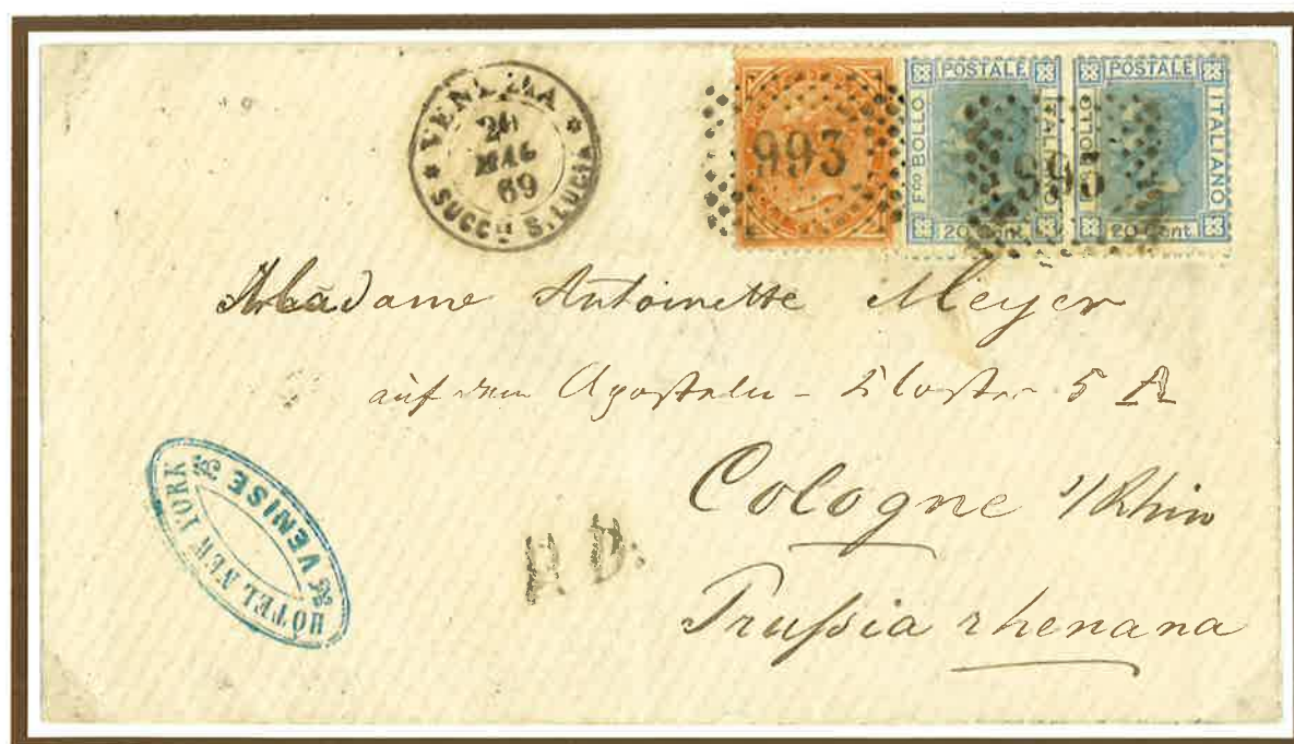
20 May 1869. Single rate letter from Venice to Colony, prepaid 50 centesimi to destination, overpaid 10 centesimi. The letter was carried with the Austrian mediation, with transit Verona on 21 May, it reached Colony on 22 May.