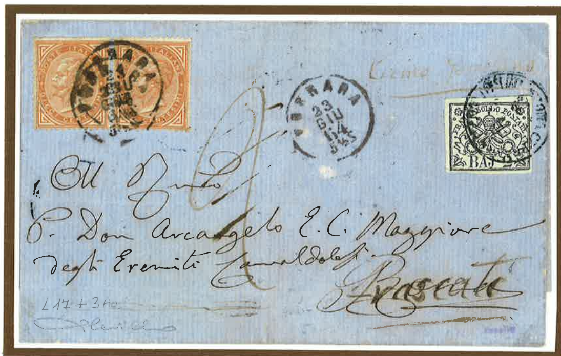
23 June 1864. Single rate letter from Ferrara to Rome (Papal States), prepaid 20 centesimi to the Papal border, charged 2 bajocchi on delivery as required for letters originating in former Papal territory. The letter was readdressed to Frascati prepaid the single domestic rate of 2 bajocchi.