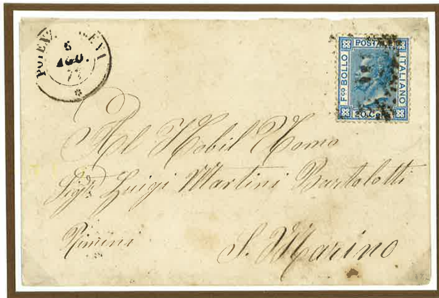
6 August 1872. Single rate letter from Potenza Picena to San Marino, prepaid 20 centesimi to destination (Italian domestic rate effective from 1 January 1865).