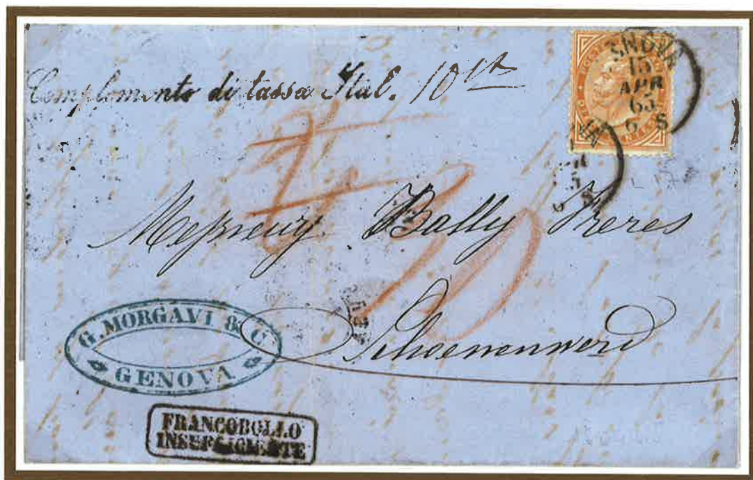
15 April 1865. Single rate letter from Genoa to Schönenwerd (Switzerland), insufficiently franked 10 centesimi and charged 30 centesimi on delivery : 40 centesimi for the unpaid letter rate decreased by the value of the franking. On the cover the indication of the Italian debit of 10 centesimi to complete the postage share due to Italy.

The letters insufficiently prepaid were charged on delivery with the unpaid letter rate decreased by the value of the postage stamps applied. These differences had to be counted for and were indicated by a manual annotation or a handstamp.