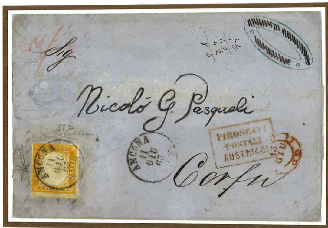
11 June 1863. Double rate letter from Ancona to Corfu (Ionian Islands), prepaid 80 centesimi to destination. The letter was embarked on an Austrian Lloyd packet of the Trieste-Constantinople Line that disembarked it in the port of Corfu on 13 June 1863.