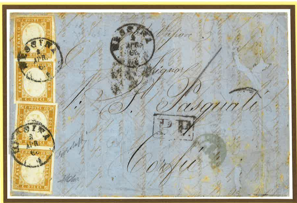
2 April 1863. Single rate letter from Messina to Corfu (Ionian Islands), prepaid 40 centesimi to the port of disembarkation, charged 1 penny on delivery for the domestic rate.