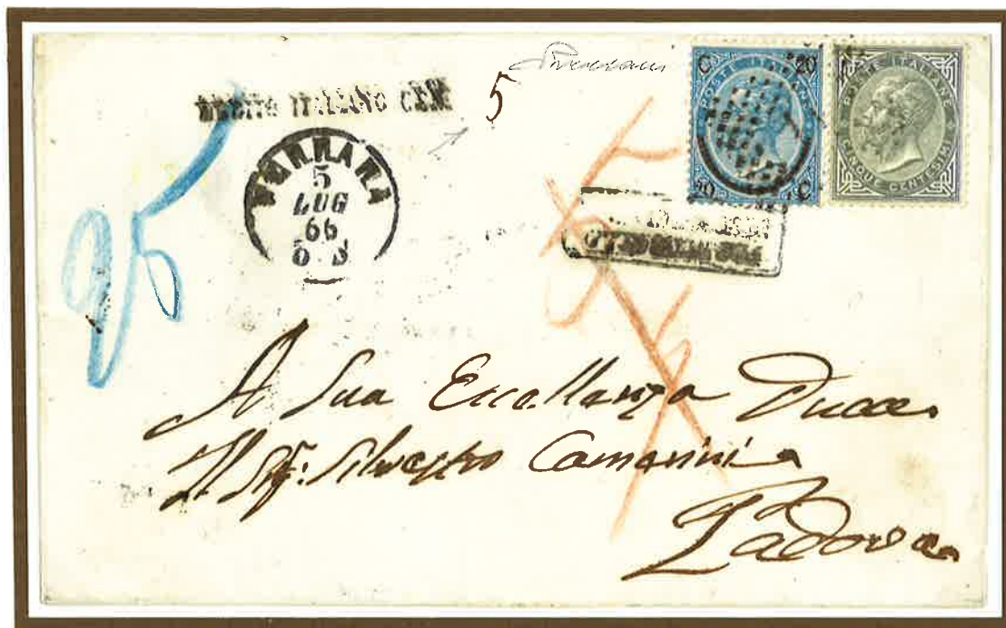
5 July 1866 . Single rate letter from Ferrara to Padua, prepaid 25 centesimi as required by the Convention with the Austrian Empire. The letter was routed via Switzerland as confirmed by the transit marking of Zurich. The letter was charged on delivery 25 kreuzer (10 kreuzer for Switzerland and 15 kreuzer for Austrian Empire). The indication "DEBITO ITALIANO CENT. 5" had no significance for letters transiting through Switzerland.

Due to the war events of 1866, the direct postal communications between the Kingdom of Italy and the Austrian Empire were interrupted, but it was possible to send letters in the Austrian Empire and in the Austrian Venetia with the Swiss mediation. The Swiss mediation allowed to prepay letters to destination at a rate of 60 centesimi for each 10 grams : 20 centesimi to the Kingdom of Italy, 15 cents to the Switzerland and 25 cents to the Austrian Empire.