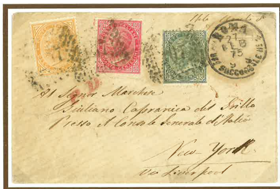
27 February 1875. Single rate letter from Rome to New York (U.S.A.), prepaid 55 centesimi to destination. The letter, crossed France in a closed mail, was put on board in Liverpool on the British packet of the Cunard Line "ABYSSINIA" that disembarked the letter in New York on 20 March where the circular stamp of the American Exchange Office of New York was struck.