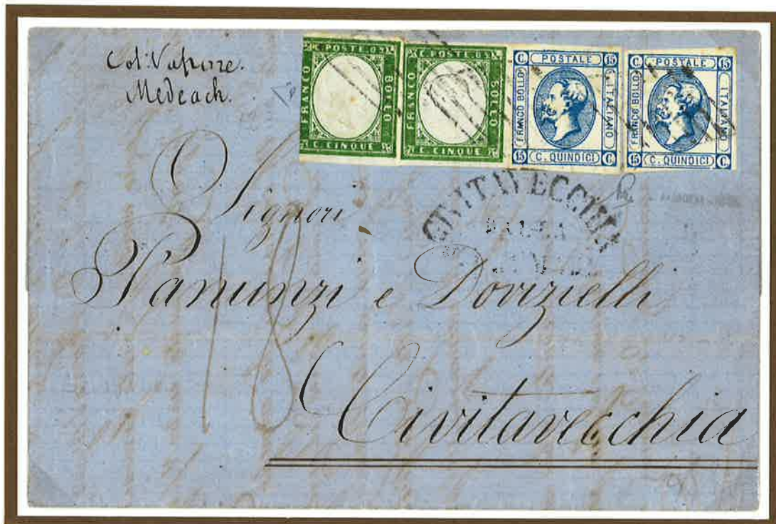
18 June 1863. Single rate letter from Genoa to Civitavecchia (Papal States), prepaid 40 centesimi to the port of disembarkation, 18 bajocchi was charged on delivery. The letter was embarked on 18 June on the French packet "MEDEAH" of the Fraissinet Company and it was disembarked in Civitavecchia on 20 June 1863.

Letters could be carried to the Papal States also by the French packets. The rate of the letters carried by the French packets was 40 centesimi for each 10 grams of weight. Due to the higher cost letters carried by the French packets are rare.