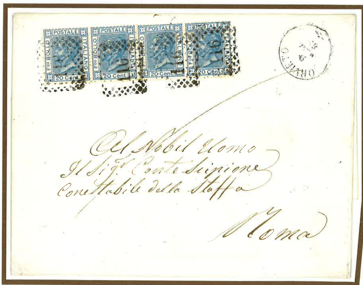
9 March 1869 . Four times rate letter from Orvieto to Rome (Papal States), prepaid 80 centesimi to destination.