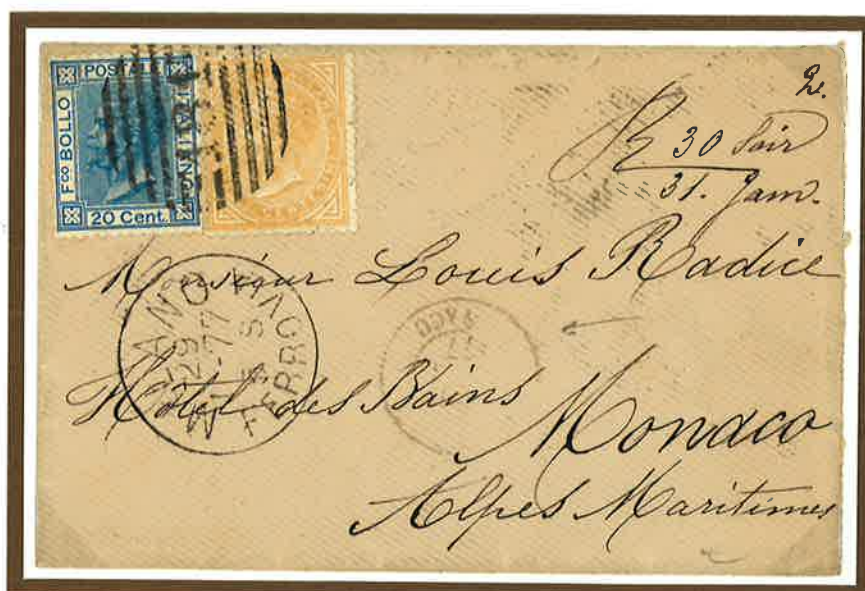
29 January 1877 . Single rate letter from Milan to the Principality of Monaco, prepaid 30 centesimi to destination, in accordance with the rates introduced by the General Postal Union.