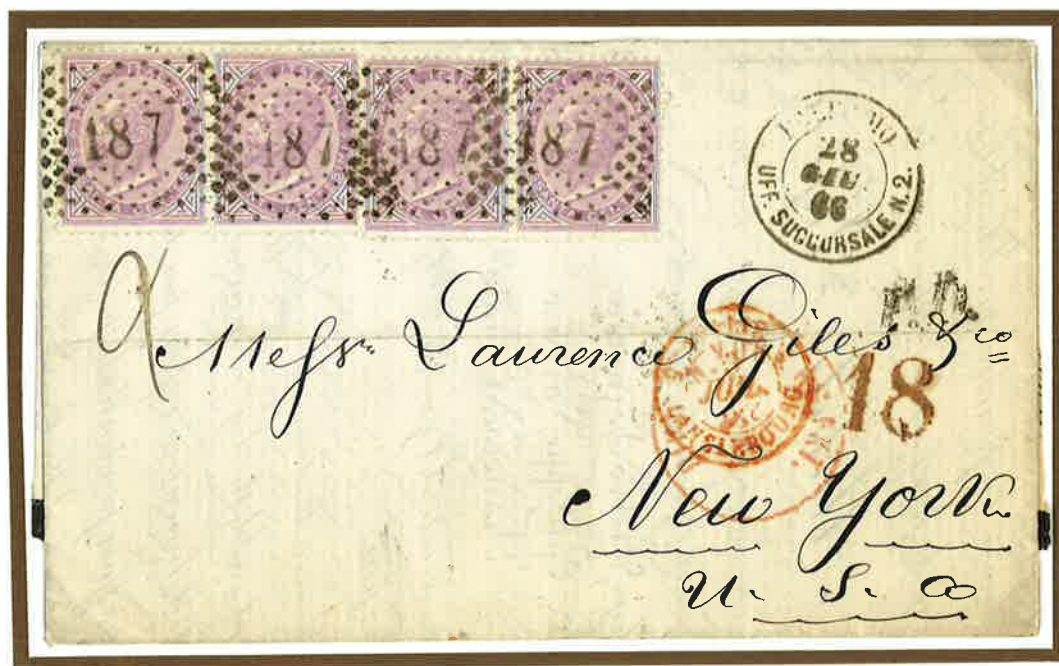
28 June 1866. Double rate letter from Palermo to New York (U.S.A), prepaid 2,40 Lire to destination. The letter was carried in the open mail to Paris where it was put in the closed bag that in Liverpool was embarked on the American packet "EDINBURGH" of the Inman Lines. Disembarked in New York on 19 July, as confirmed the hardly readable red datestamp that confirmed the carriage by an American packet. On the cover the red indication of 18 cents credited by France in case of carriage by an American packet from a British port : 6 cents (2x3 cents) American inland rate, 12 cents (2x6 cents) for transatlantic carriage (indirect service).

The letter continued in closed mail to Liverpool and on 7 October was placed on board the Steamer "CITY OF NEW YORK" of the Inman Line under American contract, that disembarked in New York on 19 October. The letter bears the notation of the 9 cents credited by France to the U.S.A. for the American carriage from a British port.