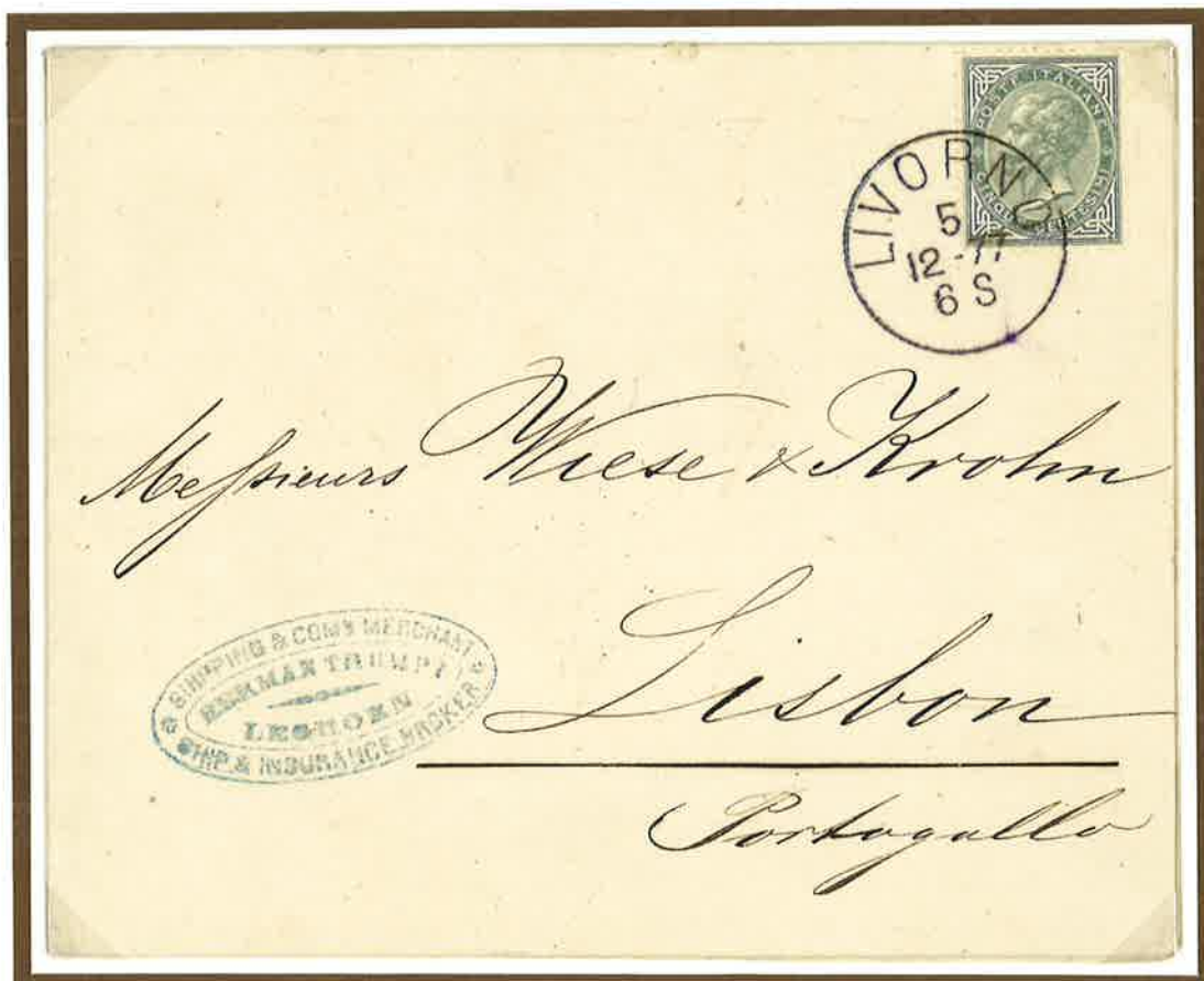
5 December 1877. Single rate printed matters from Leghorn to Lisbon (Portugal), prepaid 5 centesimi to destination, in accordance with the rate introduced by the General Postal Union, effective from 1 st January 1876.