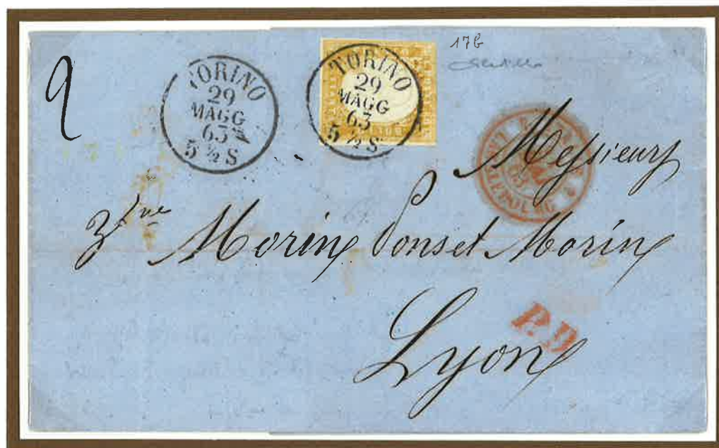
29 May 1863. Double rate letter from Turin to Lyon (France), prepaid 80 centesimi to destination. The letter was carried in a closed mail through the Mont Cenis and arrived in Lyon on 31 May, where received the handstamp "ITALIE/4 LANSLEBOURG 4".

The Franco-Italian Convention, effective from 1 January 1861, indicated a rate of 40 centesimi for each 10 grams of weight. A reduced rate of 20 centesimi for each 10 grams was introduced for letter exchanged between Italian and French locations distant less than 30 km straight line.