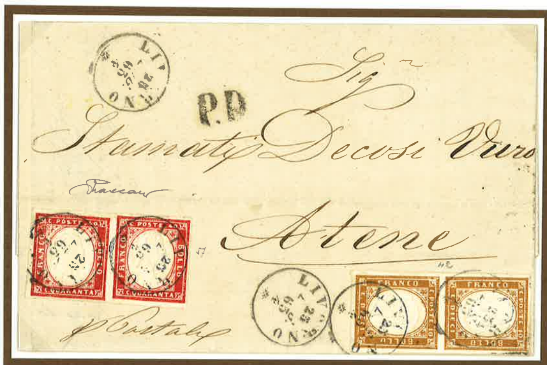
25 July 1863. Single rate letter from Leghorn to Athens (Greece), prepaid 1 Lira to destination. The letter was embarked in the same day on the French packet "AUNIS" of the Italian Line that disembarked it in Messina on 28 July and then the letter was embarked on the French packet "EUPHRATE" of the Levante Line that disembarked it in Pireo on 30 July (18 July of the Julian calendar).

The Italian-Greek Convention effective from 1 February 1862 established a letter rate of 1 Lira for each 10 grams of weight. The rate was independent from the nationality of the packets carrying the mail. On 1 February 1865 the letter rate was reduced to 60 centesimi.