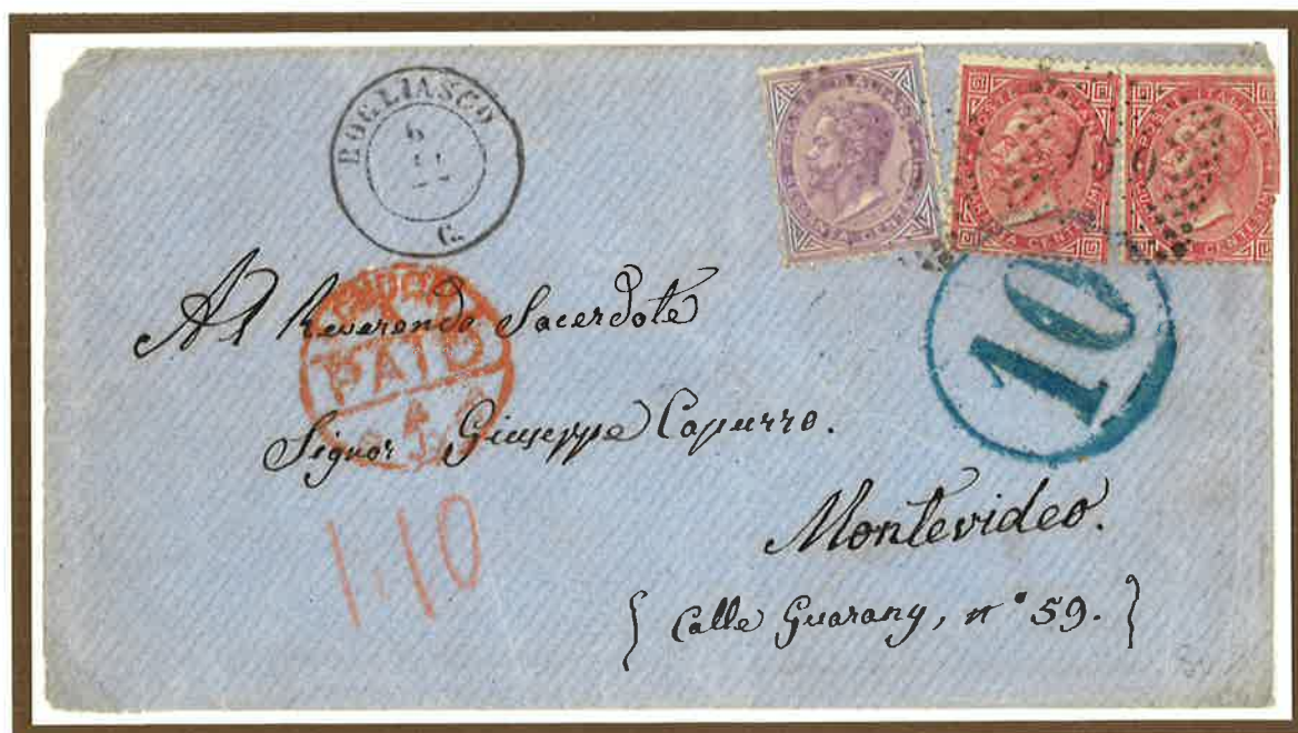
6 July 1877 . Single rate letter from Bogliasco to Montevideo (Uruguay), prepaid 1,40 Lire to the port of disembarkation and charged 10 centèsimos on delivery for the Uruguayan domestic rate. The letter, carried in closed mail through the France, with transit London, was embarked in Southampton on 9 July on the RMSP Company packet "NEVA" that disembarked the letter in Montevideo on 20 August.