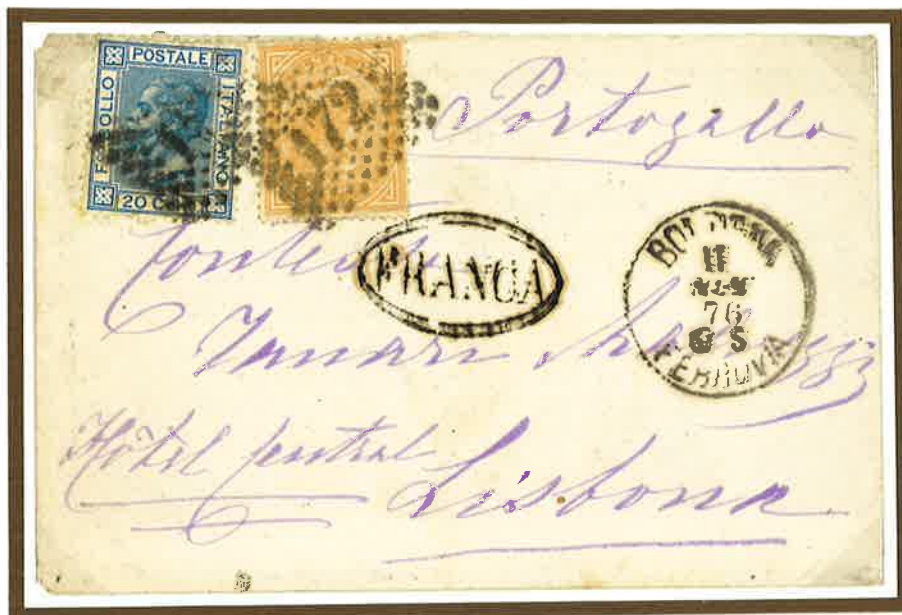
11 November 1876. Single rate letter from Bologna to Lisbon (Portugal), prepaid 30 centesimi in accordance with the rate introduced by the General Postal Union, effective from 1 st January 1876.

Only from 1 st January 1876, when France joined in the General Postal Union, it was possible to extend the GPU rates to the Mail sent to Spain and Portugal.