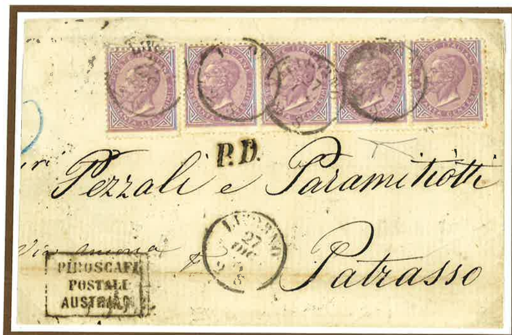
27 December 1864. Triple rate letter from Leghorn to Patras (Greece), prepaid 3 Lire to destination. The letter was embarked in Ancona on an Austrian Lloyd packet of the Greek-Oriental Line coming from Trieste that arrived in Patras on 3 January 1865 (22 December 1864 of the Julian calendar).