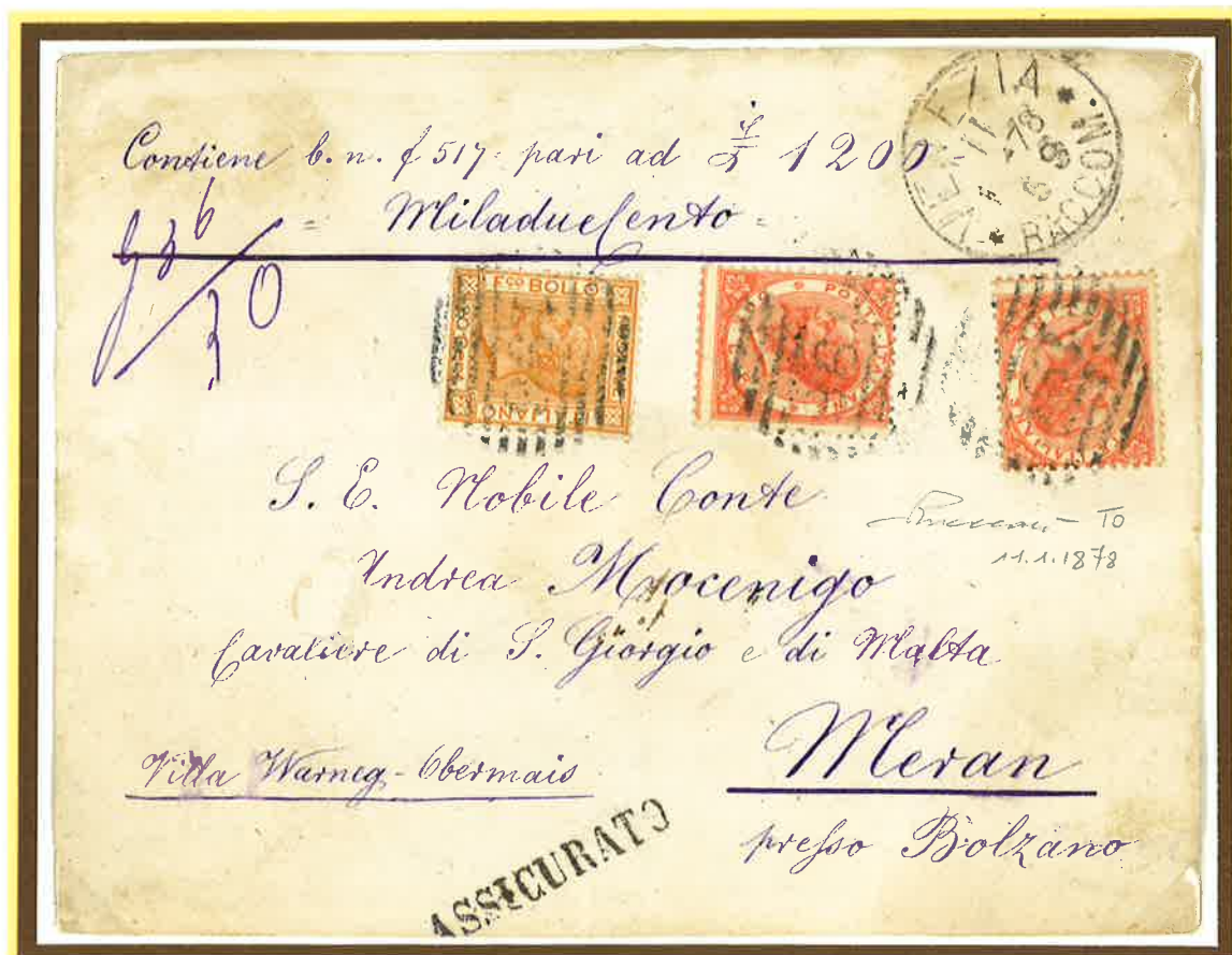
11 January 1878 . Insured triple rate letter from Venice to Meran (Austrian Empire), prepaid 4,20 Lire to destination : 90 centesimi triple GPU letter rate , 30 centesimi registration fee and 3 Lire insured fee for declared value of 1.200 Lire.