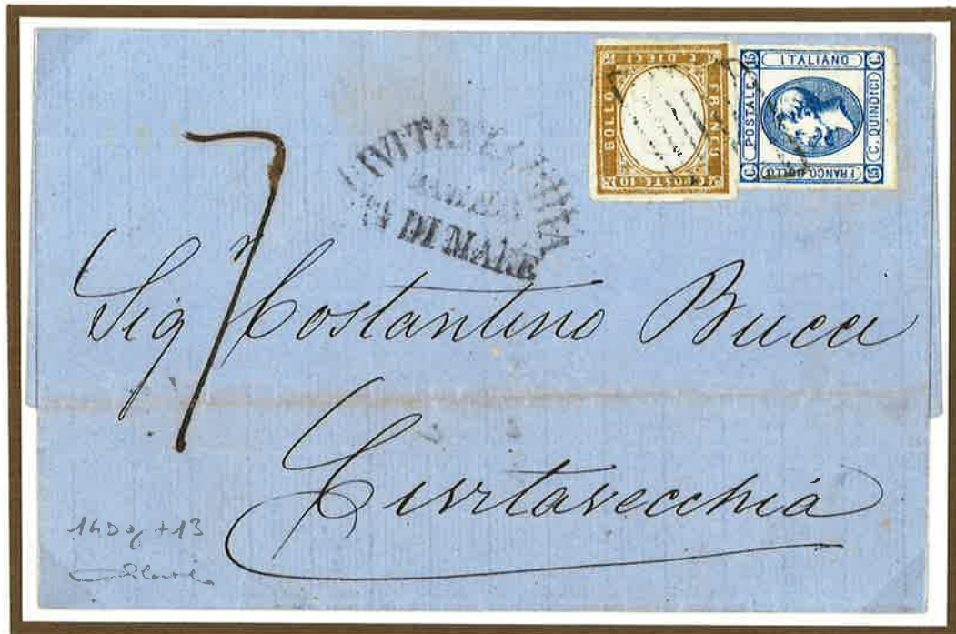
9 October 1863 . Single rate letter from Leghorn to Civitavecchia (Papal States), prepaid 25 centesimi, to the port of disembarkation, charged 7 bajocchi on delivery. The front bears the handstamp "CIVITAVECCHIA DALLA VIA DI MARE", struck in Civitavecchia.

The Postal Law of 1 st January 1863 established, for the letters carried by non contract ships, a rate of 25 centesimi for each port of 10 grams, that included 5 centesimi due to the captain for the sea carriage. When disembarked in the port of Civitavecchia the letters from Genoa were charged on delivery 12 bajocchi for each 7.5 grams of weight, while those carried from Leghorn by sea, were charged on delivery 7 bajocchi. From 6 July 1866 the new Papal rates indicated that letters originating in the Italian ports, had to be charged on delivery 4 baj for each 10 grams of weight.