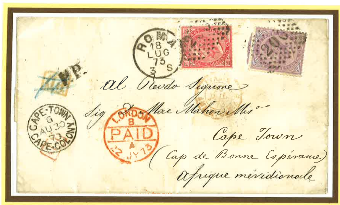
13 July 1873. Single rate letter from Rome to Cape Town (Cape of Good Hope), prepaid 1 Lira to destination as required by the French mediation. The letter was carried in the open mail trough France as confirmed by the Paris transit datestamp and it was in Plymouth placed on board of a British packet of the Union Steam Ship Company, that disembarked the letter in Cape Town.

Letters to the British colony of the Cape of Good Hope were carried either with the direct Anglo-Italian Convention or with the French mediation. Letters were carried by the British packet, in some period letters could be carried only be carried by the non contract ships.