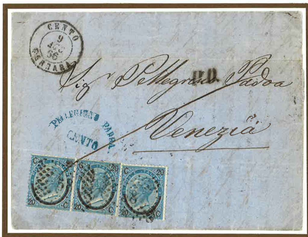
9 August 1866 . Single rate letter from Cento (Ferrara) to Venice, prepaid 60 centesimi to destination. The letter was carried through Switzerland, as confirmed by the transit marking of Zurich.