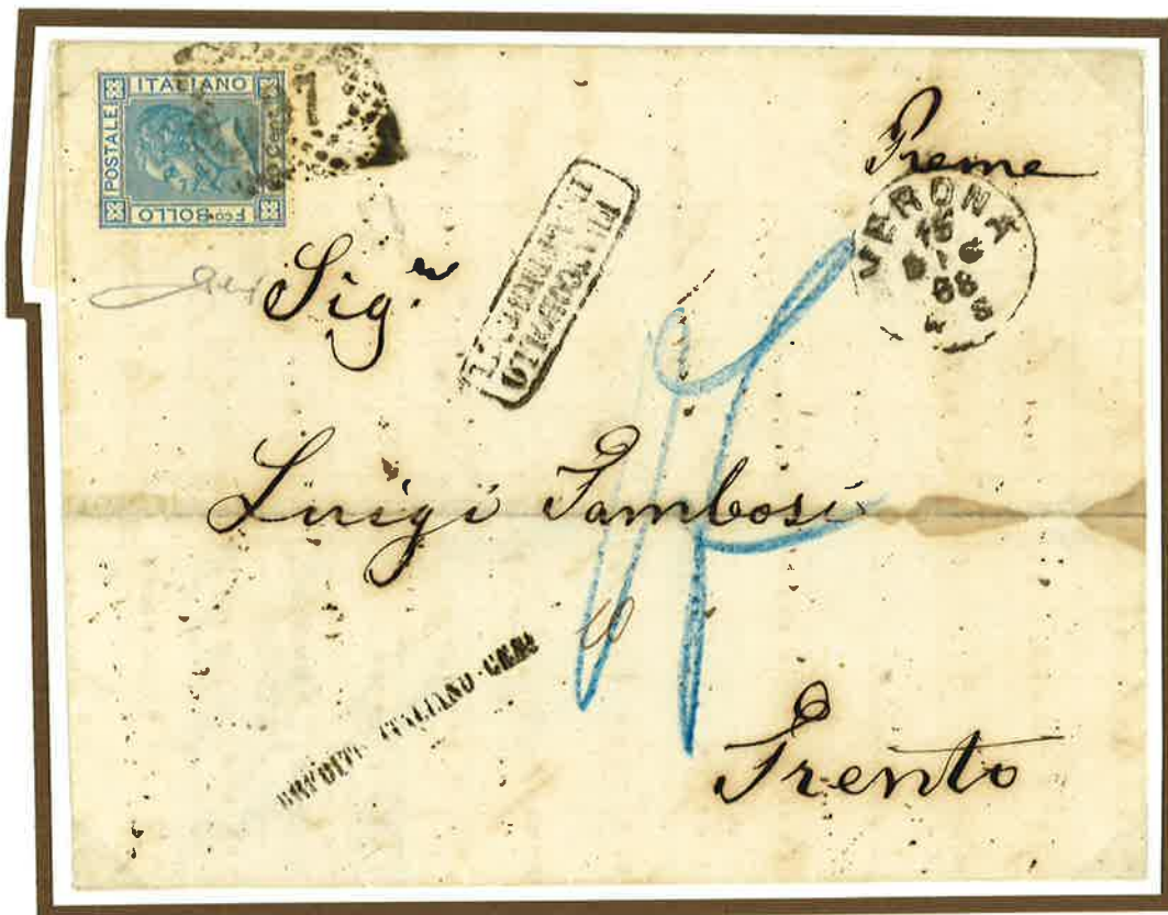
15 December 1868. Single rate letter from Verona to Trento (Austrian Empire), where arrived the following day, insufficiently franked 20 centesimi (equal to 8 Kreuzer) and charged on delivery 17 Kreuzer, the difference to the unpaid letter rate of 25 Kreuzer.