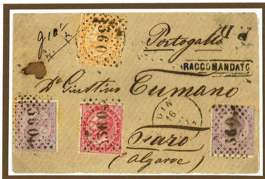
16 January 1875. Double rate registered letter from Udine to Faro in the Algarve (Portugal), prepaid 1,70 Lire to destination : 1,20 Lire double letter rate (60c. x 2) and 50 centesimi registration fee. The letter was carried in closed mail through France and Spain.