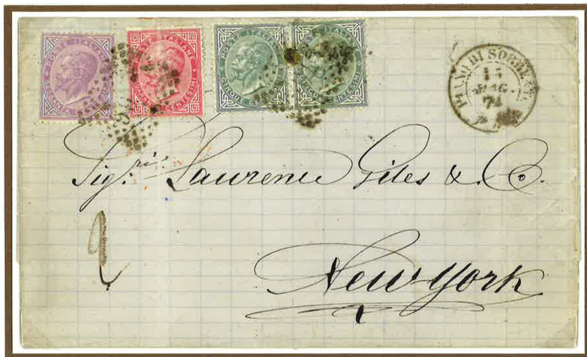
15 May 1874. Double rate letter from Piano di Sorrento to New York (U.S.A.), prepaid 1,10 Lire to destination. The letter transited Verona where the closed mail bag carried through France, was prepared. It was put on board of the British packet "ALGERIA" of the Cunard Line that disembarked the letter in New York on 7 June.