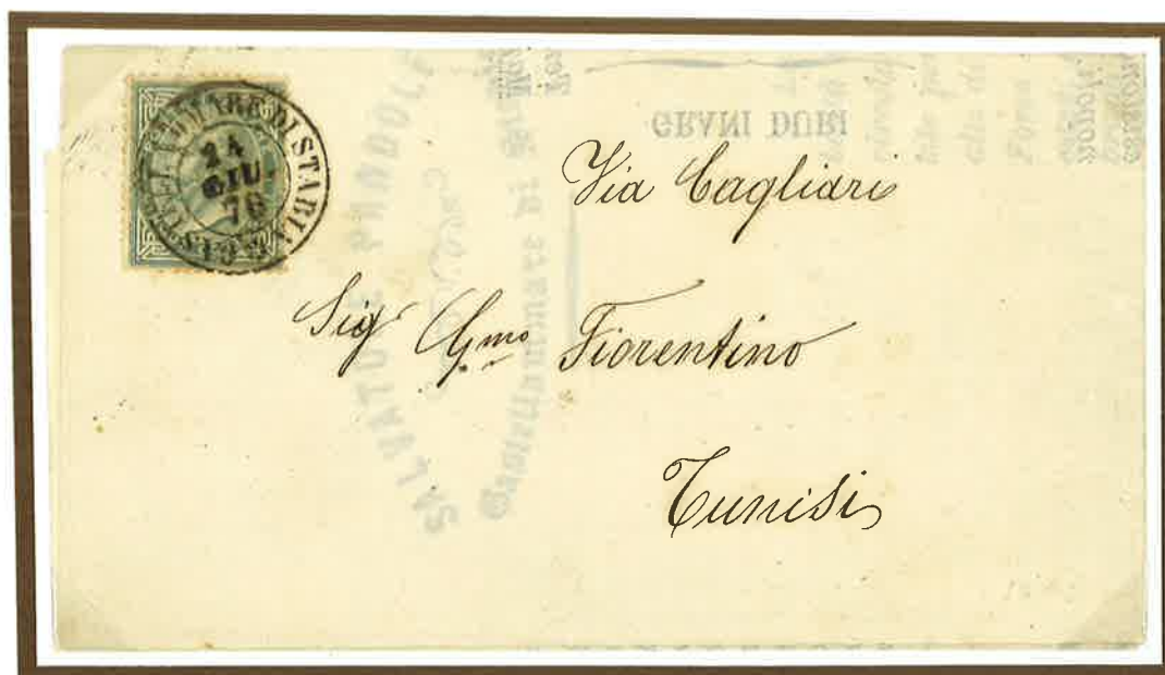
24 June 1876. Single rate printed matters from Castellammare di Stabia to Tunis, prepaid 5 centesimi to destination, after the transit of Leghorn and Cagliari, in accordance with the rate introduced by the General Postal Union, effective from 1 st January 1876.