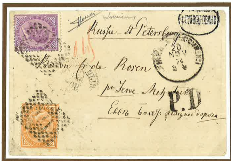
20 November 1871 . Single rate letter from Florence to Ievve (Johvi - Estonia), prepaid 70 centesimi to destination. The letter was carried with the Austrian mediation as confirmed by the transit datestamp of Vienna.