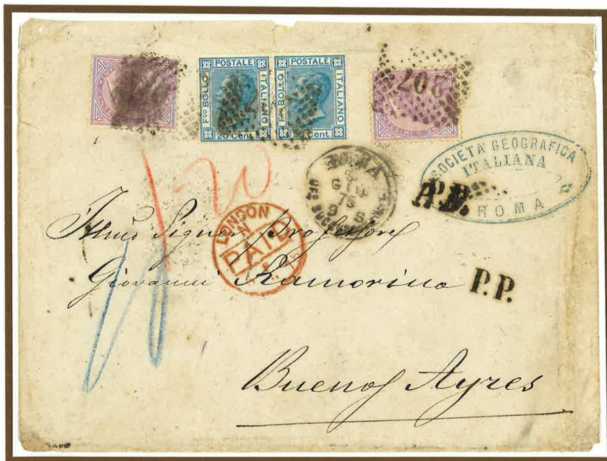
5 June 1875. Single rate letter from Rome to Buenos Aires (Argentina), prepaid 1,60 Lire to the port of disembarkation of Buenos Aires, 1,20 centesimi was credited to UK, 10 centavos charged on delivery. The letter, carried in closed mail to London, was placed on board to the Royal Mail Steam Packet Company packet "BOYNE" in Southampton that disembarked the letter in Buenos Aires on 9 July. This was the last trip of the "BOYNE". Departed for the return from Buenos Aires on 15 July, during the trip, on 13 August, was wrecked on a reef near the French island of Ouessant due to the dense fog.