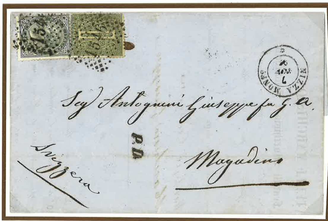
7 November 1866. Double rate printed matter from Nizza Monferrato to Magadino (Switzerland), where arrived on 8 November, prepaid 6 centesimi to destination.