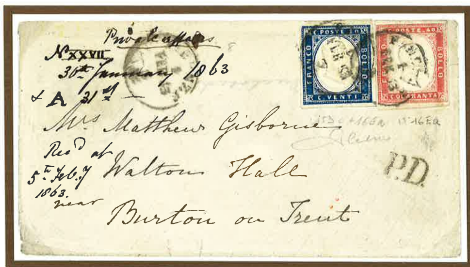
1 February 1863. Single rate letter from Florence to Burton on Trent (United Kingdom), prepaid 60 centesimi to destination.

The direct Anglo-Sardinian Convention, effective from 1 February 1858, indicated a prepaid rate to destination in the UK of 60 centesimi for each 7,5 grams of weight. Prepaid rate for printed matter was established in 10 centesimi for each 40 grams. These rates were in effect up to 30 June 1875, on 1 July 1875 UK joined the General Postal Union.