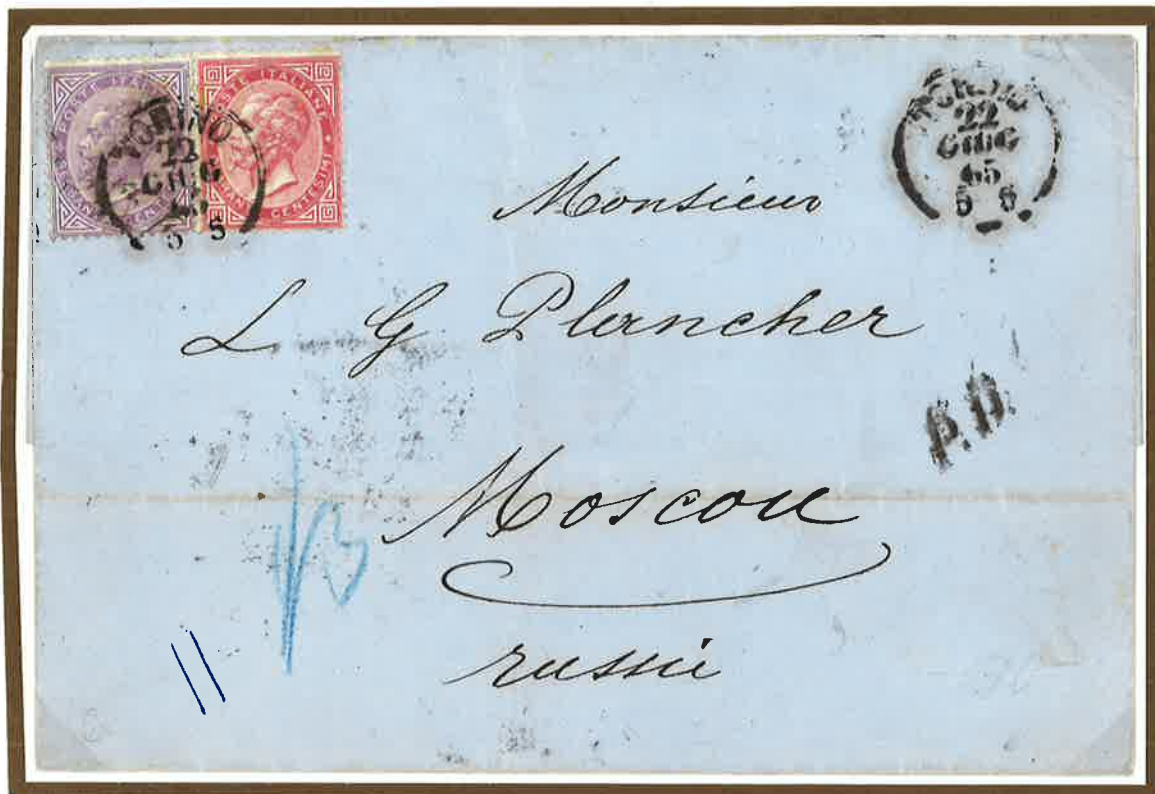
22 June 1865 . Single rate letter from Turin to Moscow (Russian Empire), prepaid 1 Lira to destination. The letter was carried with the Swiss mediation as confirmed by the transit datestamp of Bellinzona and Basilea and also by the handstamp "SCHWEIZ über BADEN".

No direct Convention between Italy and Russia was in place, therefore letters addressed to Russian Empire were delivered mainly with the Swiss or the Austrian mediation. The Swiss-Italian Convention indicated a rate of 1 Lira for each 10 grams for letters delivered to any Russian location. The Austro-Italian Convention indicated a rate of 70 centesimi for each 15 grams for letters delivered to a location no more than 75 km from the Austrian border, the rate was 1 Lira for the other Russian locations. From 20 September 1866 the rate of 70 centesimi was extended to all Russian destinations. From 1 March 1873 the German mediation allowed to prepay letters to destination in Russia at a rate of 50 centesimi for each 15 grams. The direct Italian-Russian Convention, effective from 1 January 1874, established a letter rate of 50 centesimi for each 15 grams of weight, letters were carried to Russia in closed mail.