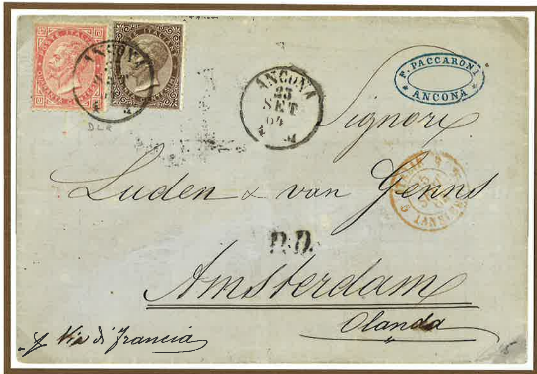
23 October 1864. Single rate letter from Ancona to Amsterdam, prepaid 70 centesimi to destination. The letter was carried through France in the open mail and received in the Exchange Office in Paris the handstamp "ITALIE/ 5 LANSLEBOURG 5". On the reverse the delivery datestamp of Amsterdam dated 26 September.

Up to 30 September 1868 no direct Convention between Italy and The Netherlands was in place, letters were mainly carried with the French mediation. The letter rate to destination was established by the Franco-Italian Convention of 1861 : 70 centesimi for each 7,5 grams.