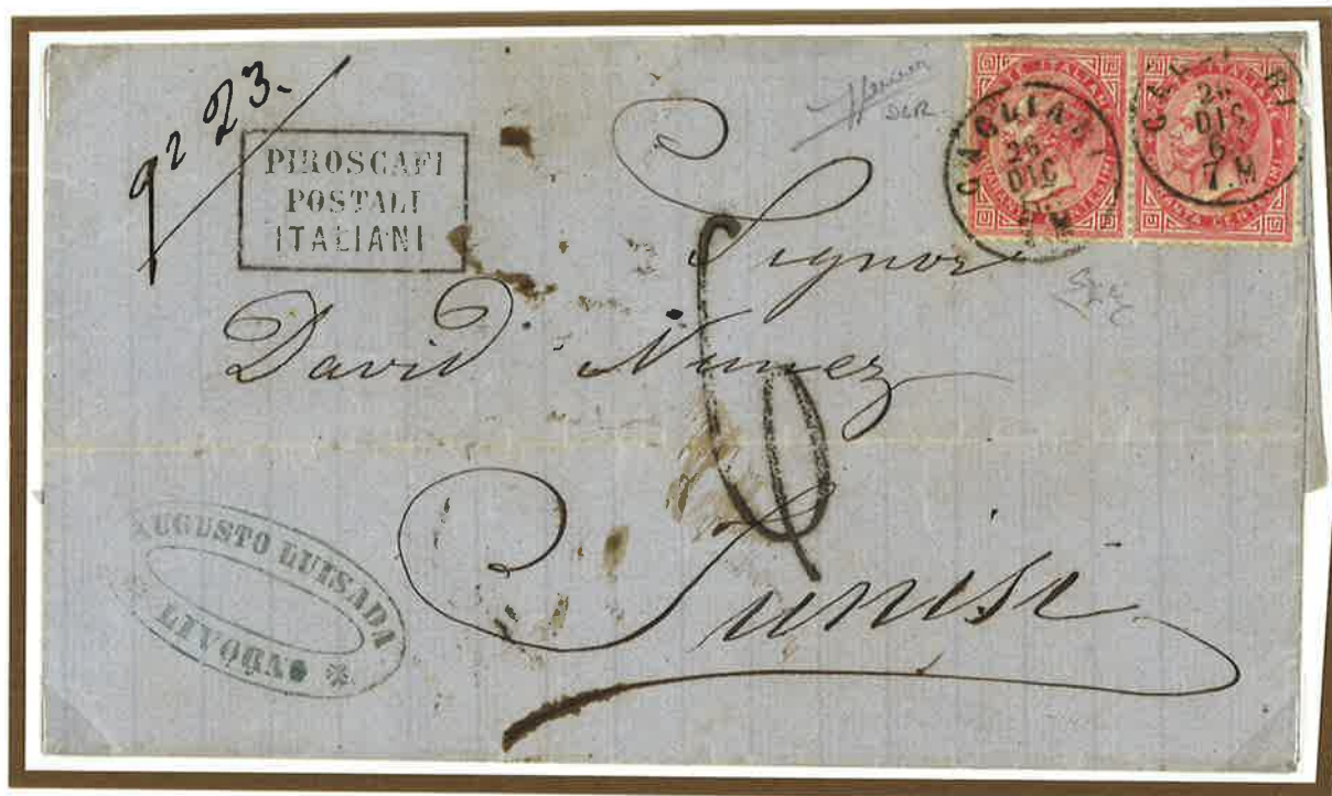
26 December 1863. Triple rate letter (23 grams) from Cagliari to the Italian Post Office of Tunis, prepaid only 80 centesimi as a double rate and charged 6 decimes on delivery, the single rate for unpaid letters to Tunis.

Tunisia was independent but the Bey of Tunisia had to be approved by Constantinople. Letters from Italy were carried to the Italian Post Office of Tunis by the Italian packets, at a rate of 40 centesimi for each 10 grams.