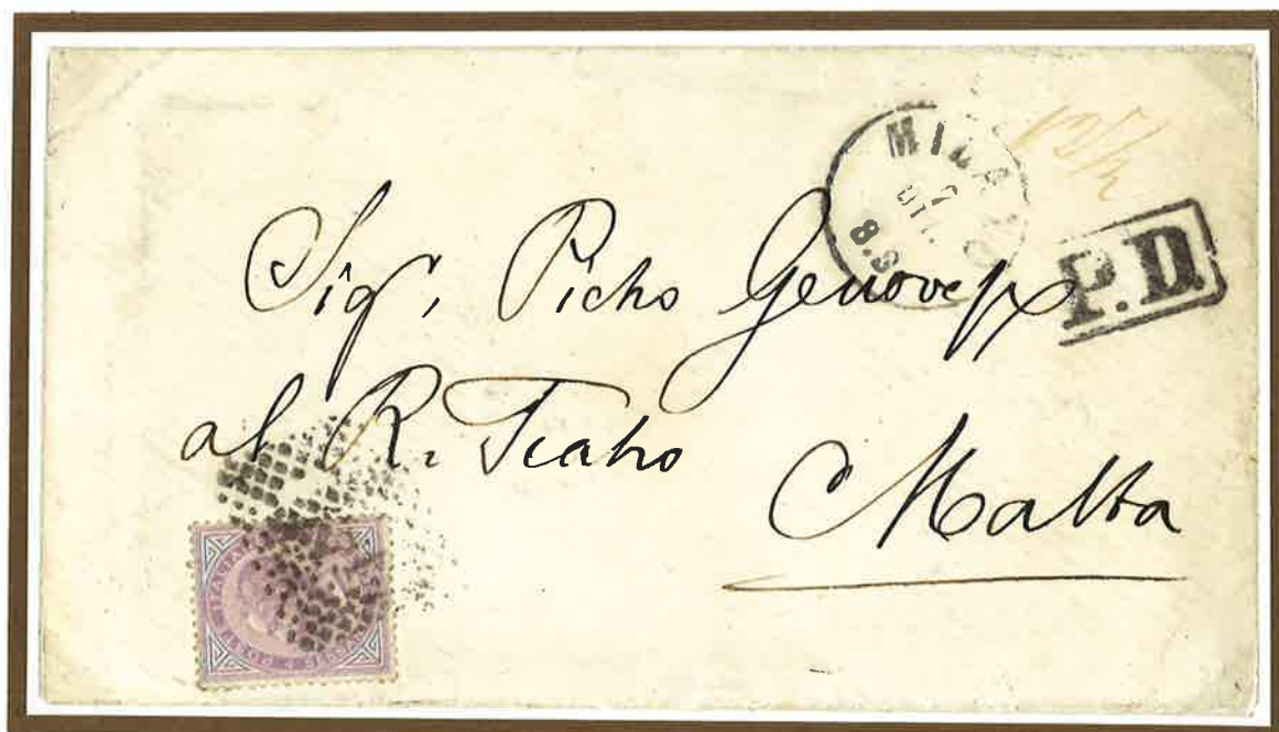
7 October 1866. Single rate letter from Milan to Malta, prepaid 60 centesimi to destination, as required for carriage by the French packet via Marseille. The letter was carried to Leghorn where on 8 October it was embarked on the French packet "QUIRINAL" bound for Marseille where it arrived on 12 October. The letter in Marseille on 13 October, was embarked on the French packet "GODAVERY" of the Line of Levant and it was disembarked in Malta on 16 October 1866.