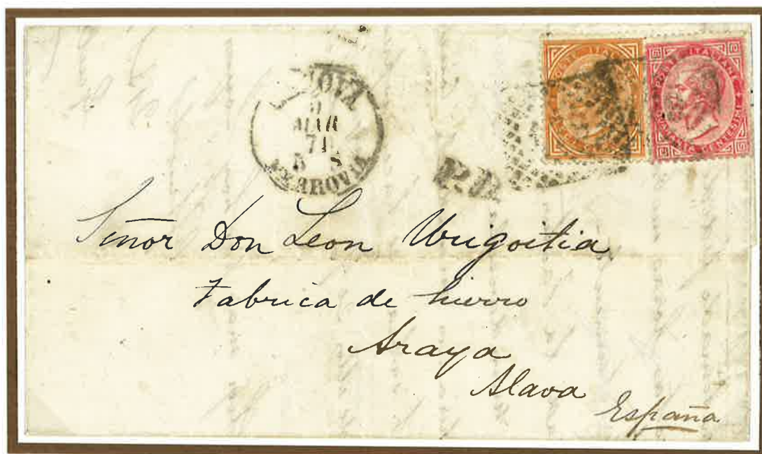
8 March 1871. Single rate letter from Genoa to Araya (Spain), prepaid 50 centesimi to destination. The letter was carried in closed mail through France, as confirmed by the absence of French marking.

Up to 30 June 1868 the stipulations of the Spanish-Sardinian Convention did not allow to prepay letters to destination. The Italo-Spanish Convention effective from 1 July 1868, allowed to prepay letters to destination at a rate of 50 centesimi for each 10 grams of weight. Letters were carried in closed mail through France.