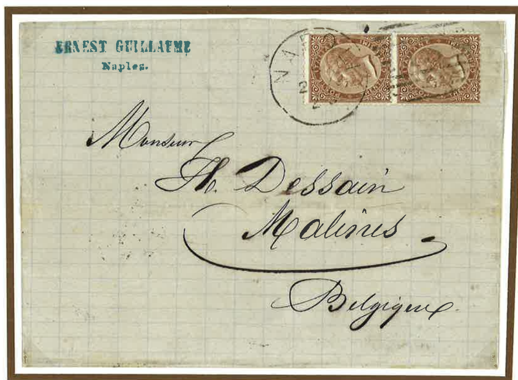
6 February 1878. Double rate letter from Naples to Malines (Belgium), prepaid 60 centesimi (30 centesimi for each 15 grams) to destination, in accordance with the rate introduced by the General Postal Union in 1 st July 1875.