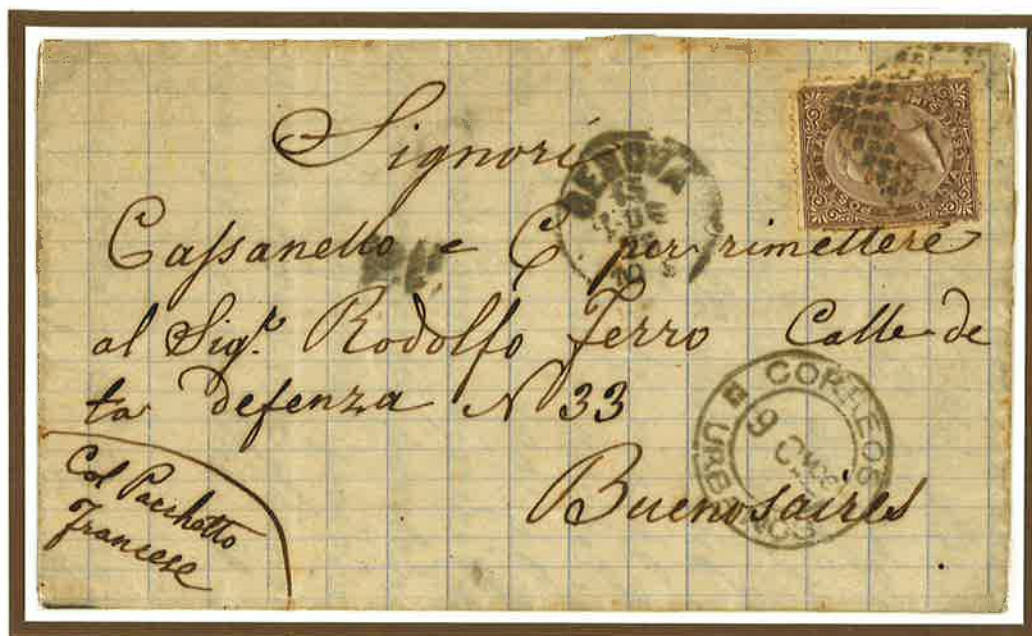
13 July 1876 . Single rate letter from Genoa to Buenos Aires (Argentina), prepaid 30 centesimi to the port of disembarkation and charged 9 centavos on delivery for the Argentinian domestic rate. The rate of 30 centesimi was effective since 1876 for letters up to 15 grams carried by non contract ship, prepaid to the port of disembarkation.

As a consequence of the entry in the General Postal Union of numerous overseas Countries, Italy established in 60 centesimi the rate for letter sent overseas to these Countries. Argentina joined the General Postal Union from 1 st April 1878.