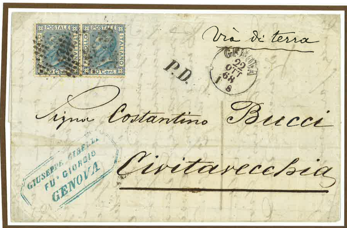
22 October 1868 . Double rate letter from Genoa, carried overland to Civitavecchia (Papal States), prepaid 40 centesimi to destination (20 centesimi for each 10 grams).

Effective from 1 st October 1867 R. D. nr. 3884 the rate of letters prepaid to destination in the Papal States was determined in 20 centesimi for each 10 grams of weight.